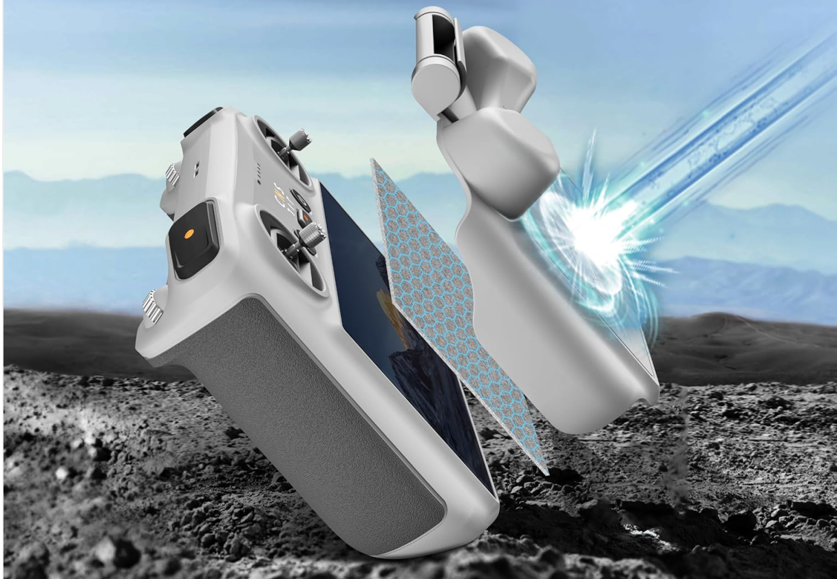
Figure 2: The ultra-soft microfiber lining ensures screen protection.