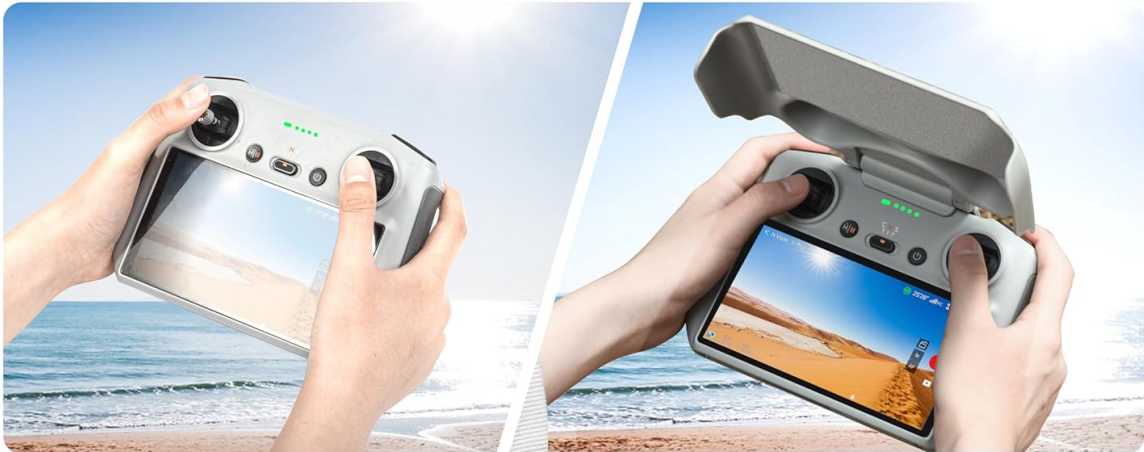
Figure 3: Demonstrating glare reduction with the sun hood in use.