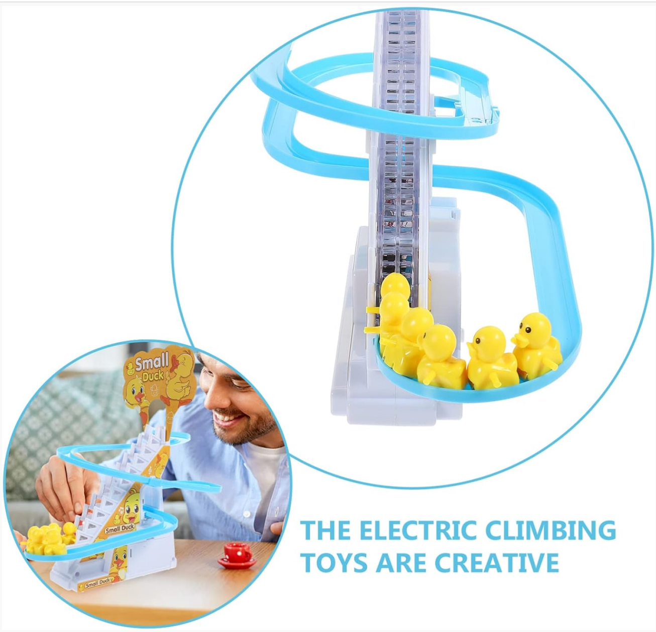
Image: Detail of the toy in operation, highlighting the escalator and ducks.