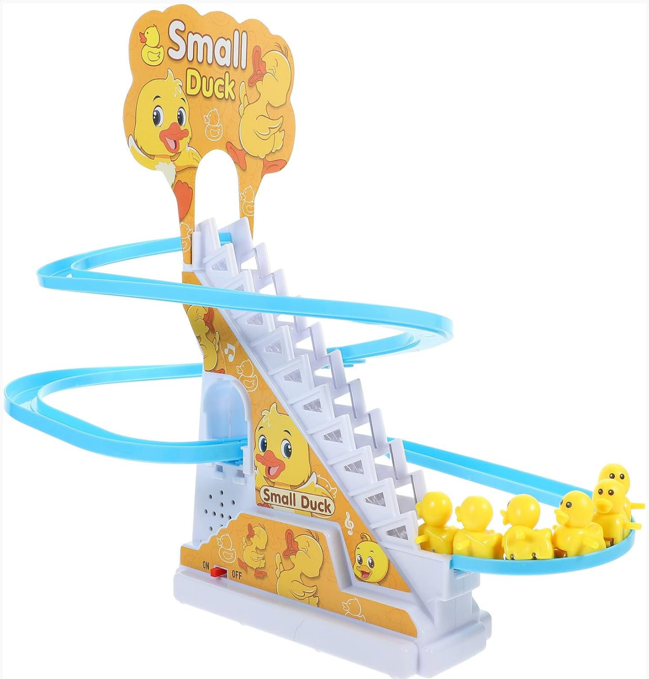
Image: The toy fully assembled, ready for operation.