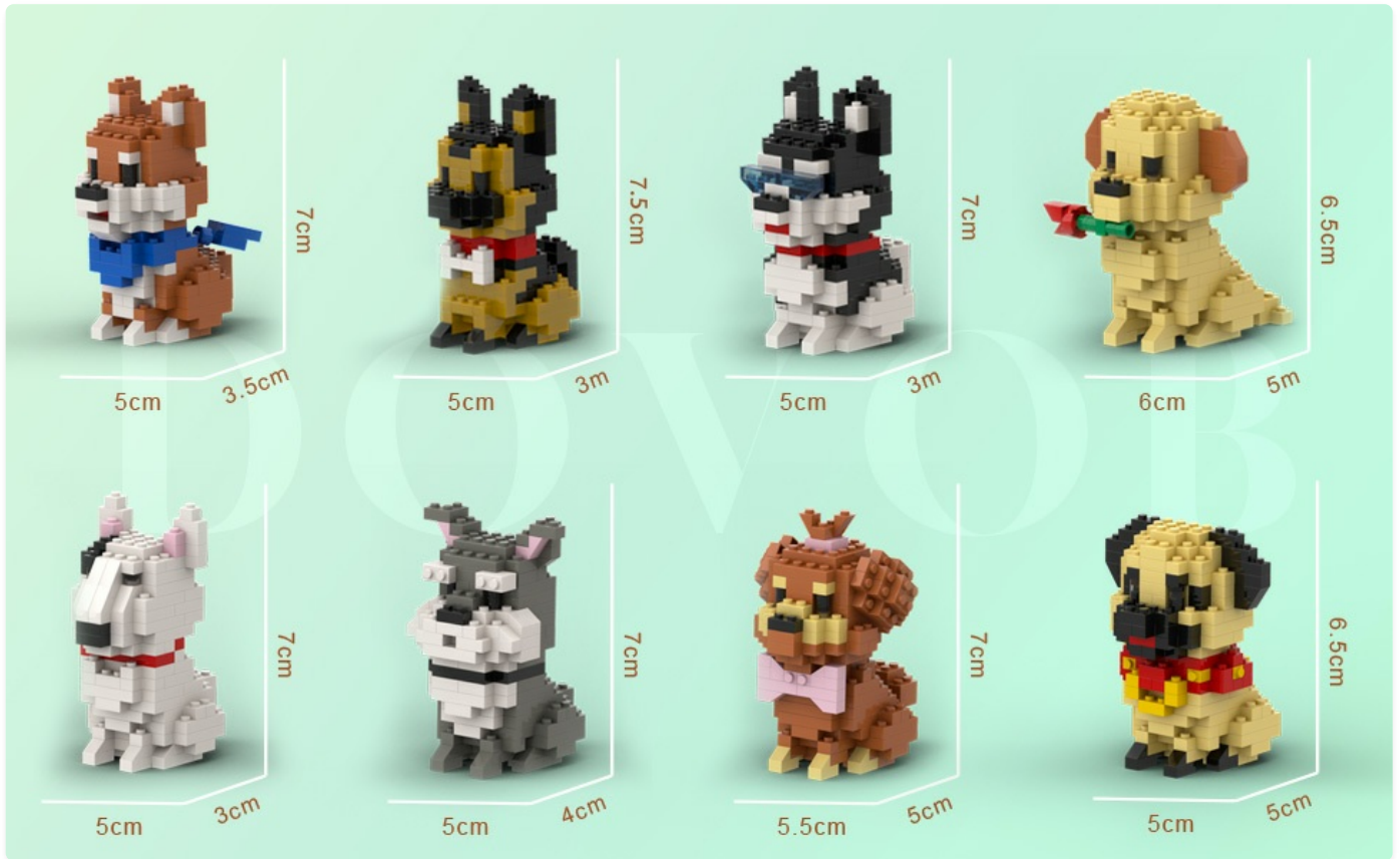
Figure 7: Approximate dimensions of individual dog models.