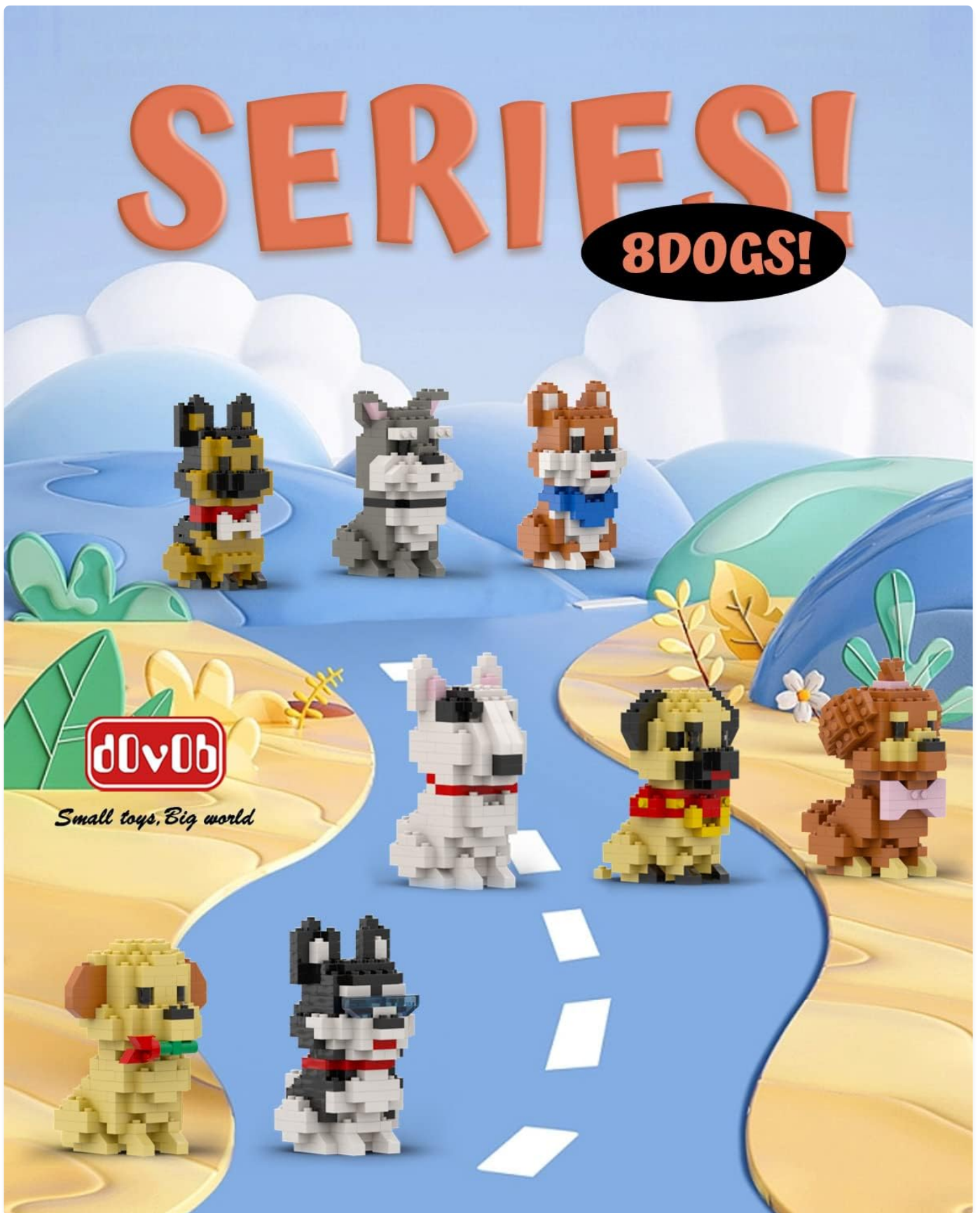
Figure 2: The dOvOb 8-in-1 Dogs Set packaging.