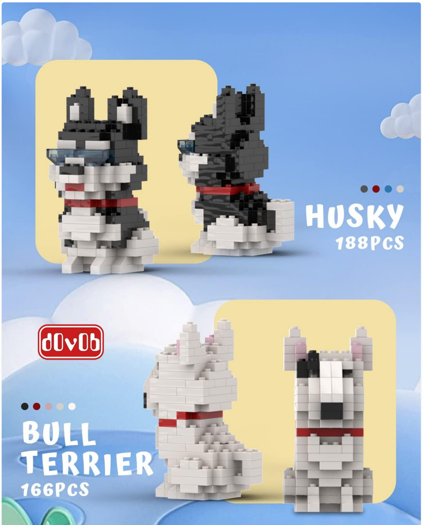
Figure 5: Detailed views of the Husky and Bull Terrier models.