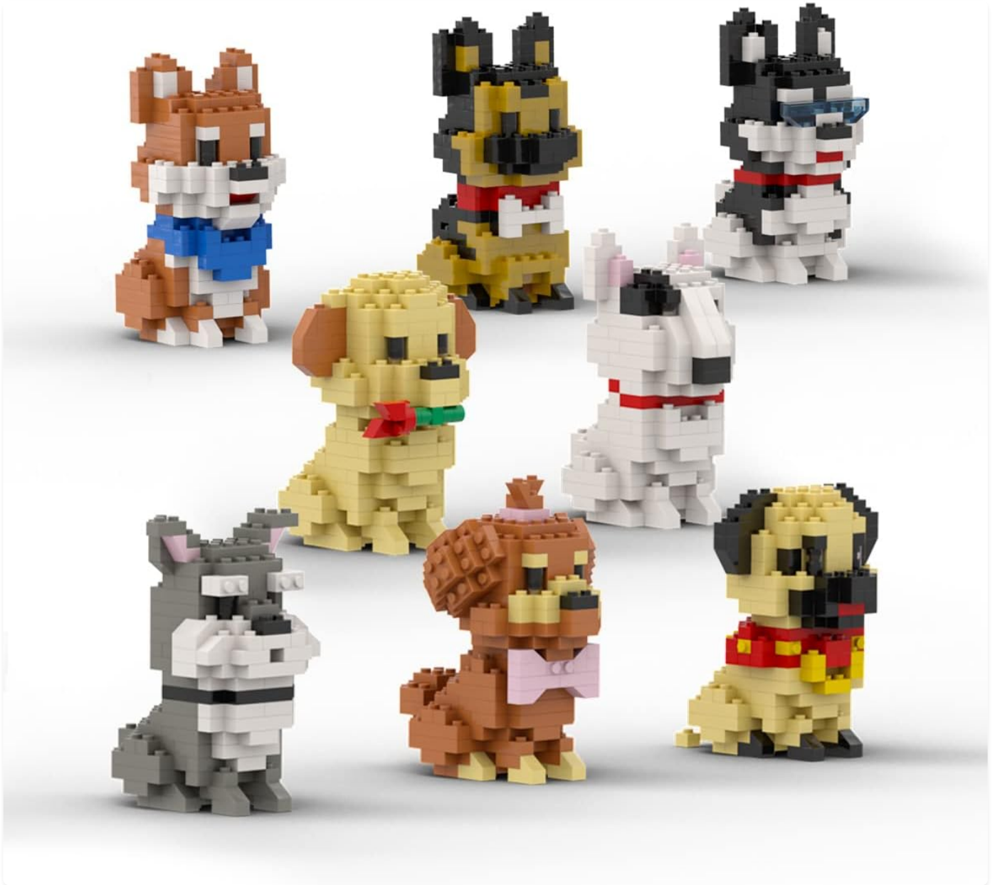
Figure 1: The complete collection of 8 micro mini block dog models.