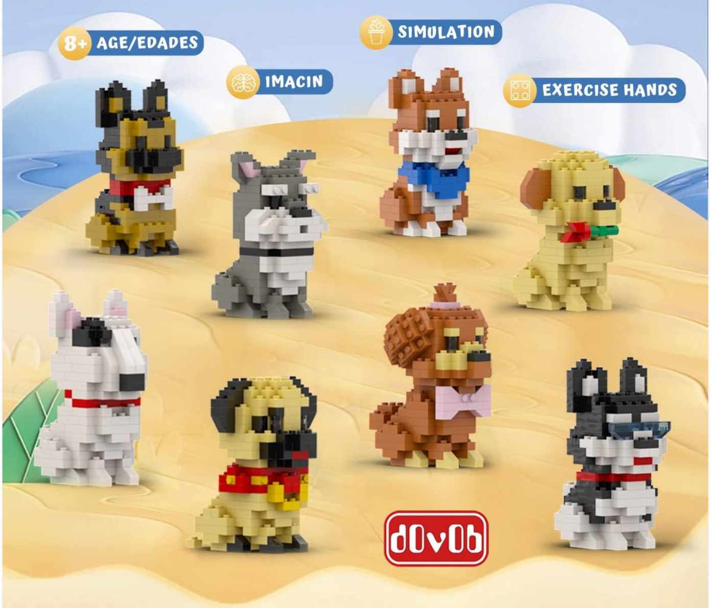
Figure 3: Overview of the 8 puppy models and piece count.