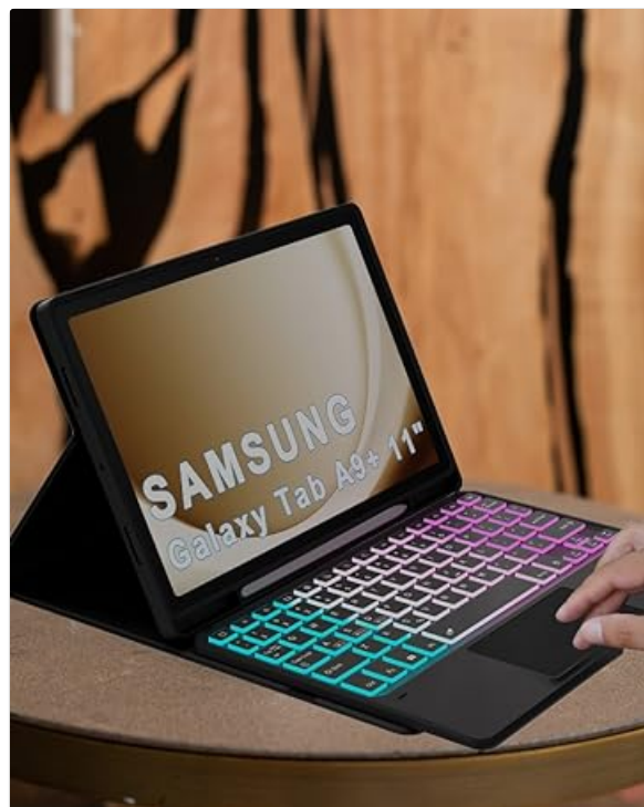
This image illustrates the flexible rotating shaft design, allowing for multiple viewing angles.