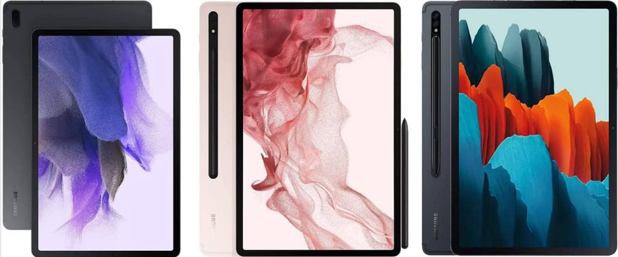
Samsung Tab S7 FE 12.4"

S7 Plus 12.4" /S7 FE 12.4" /S8 Plus 12.4"