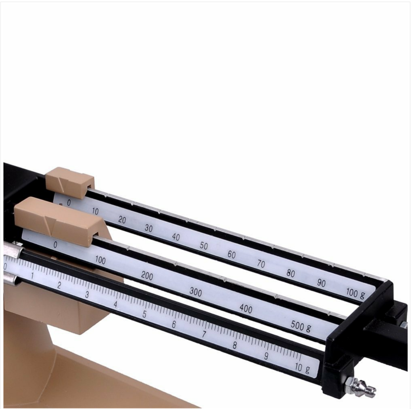
Figure 6: A close-up view of the three beams, illustrating how to read the precise measurement from each poise.