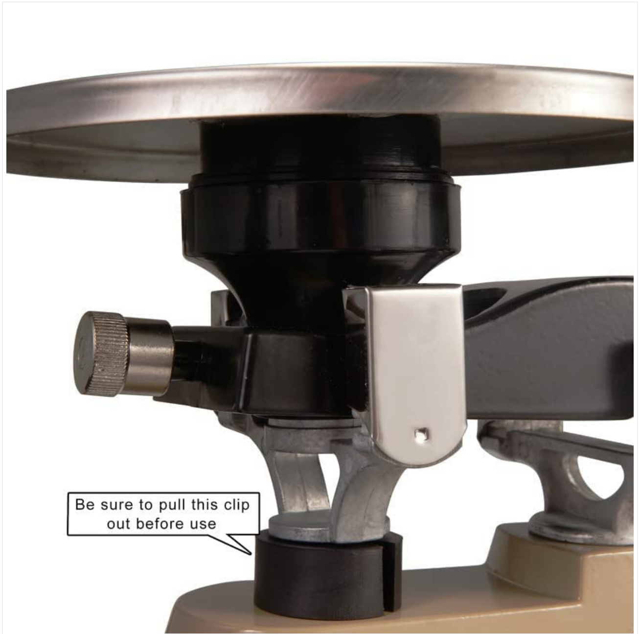
Figure 3: The shipping clip must be disengaged before operating the scale.