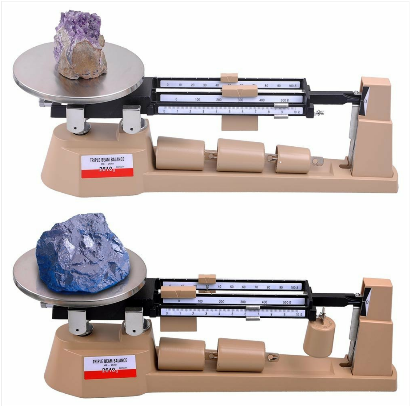
Figure 4: The scale in use, demonstrating how an object is placed on the pan for weighing.