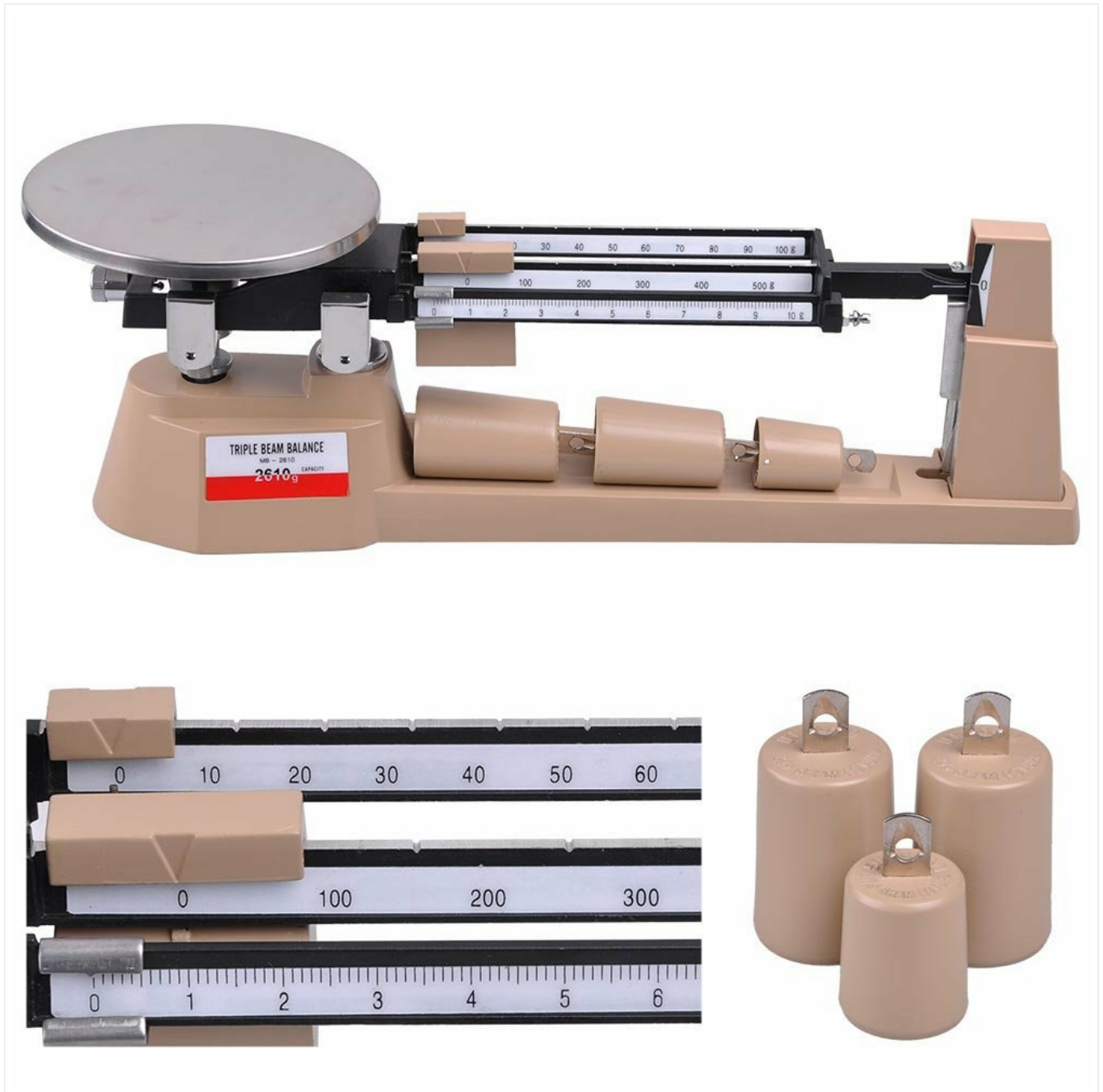
Figure 2: Detailed view of the scale's beams with their respective increments and the additional weights.