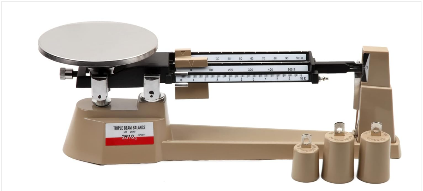
Figure 1: The Generic MB2610 Triple Beam Mechanical Balance Scale, showcasing its main components and included additional weights.

This manual provides comprehensive instructions for the proper setup, operation, and maintenance of the Generic MB2610 Triple Beam Mechanical Balance Scale. Designed for precise measurements in laboratory, analytical, and educational settings, this scale offers a maximum weighing capacity of 2610 grams with a resolution of 0.1 grams. Its robust mechanical design ensures durability and consistent performance without the need for external power sources or batteries.