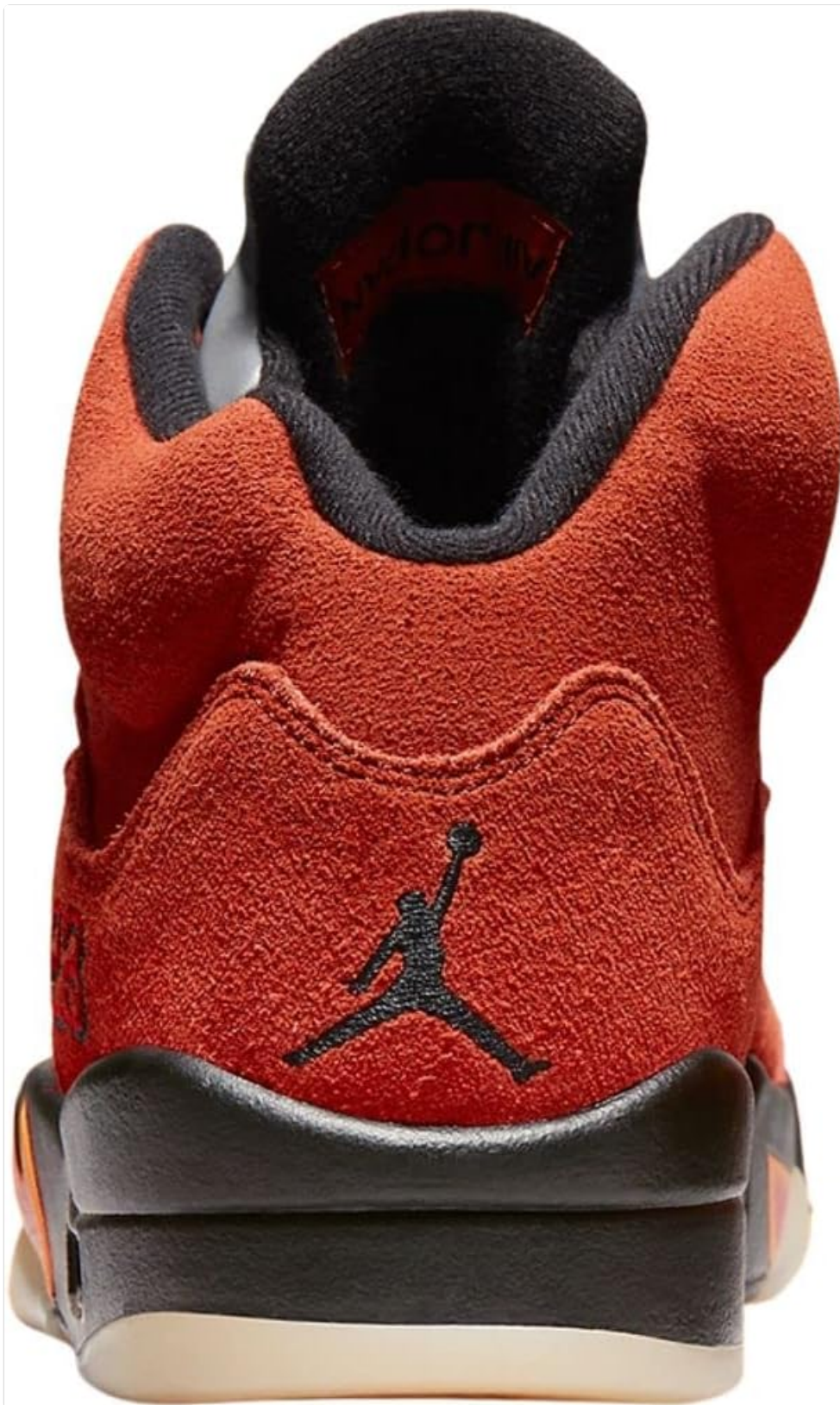
Figure 5.1: Rear view of the Jordan 5 Retro shoe, displaying the heel tab and Jumpman logo.