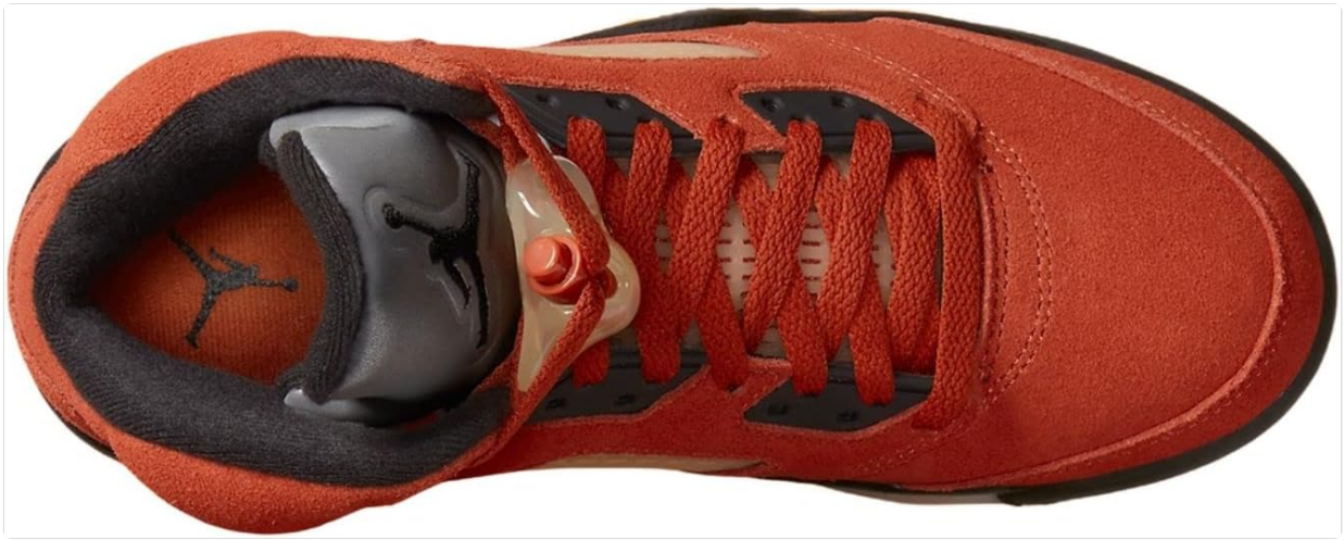
Figure 4.1: Top-down view of the Jordan 5 Retro shoe, showing the lacing system and tongue design.