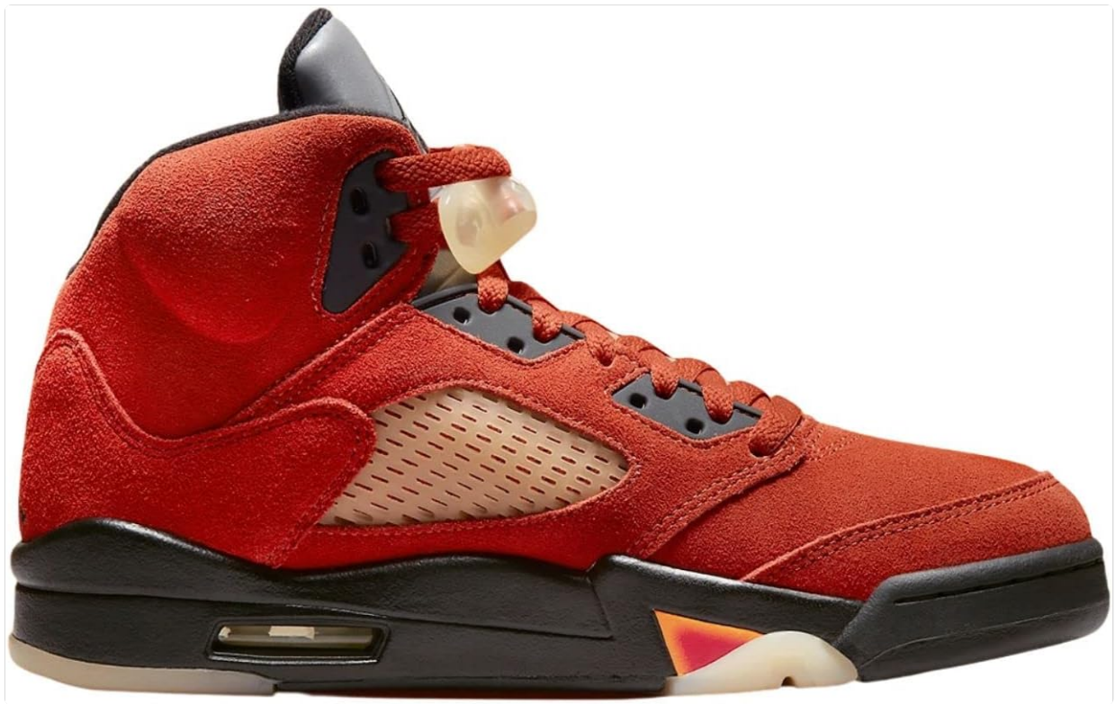
Figure 3.1: Alternate side view of the Jordan 5 Retro shoe, highlighting the overall silhouette and sole structure.