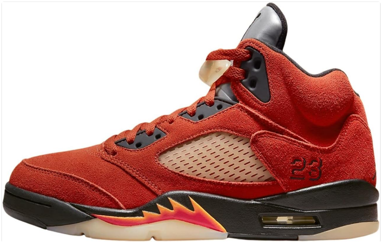
Figure 2.1: Side view of the Jordan 5 Retro shoe, showcasing the red suede upper, mesh panel, and midsole design.