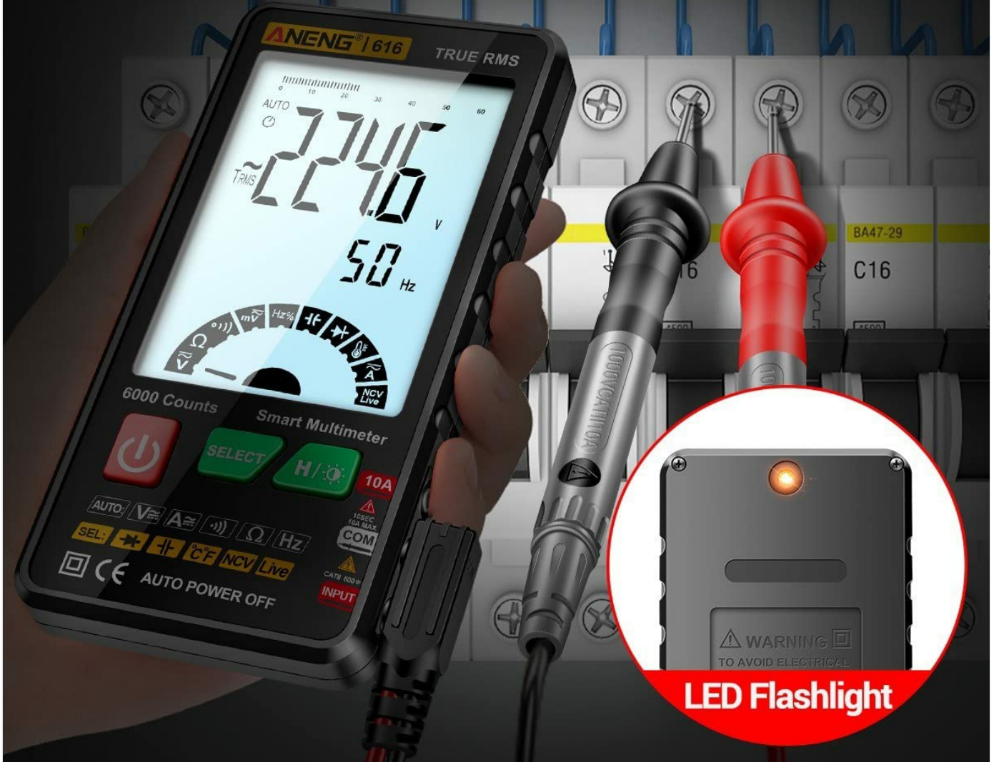
Figure 5.3: The ANENG 616 Multimeter in use, demonstrating its flashlight function. The integrated LED illuminates the measurement area, making it easier to work in low-light conditions.

The flashlight sees the detected location in the dark Bright screen makes screen values clearly visible