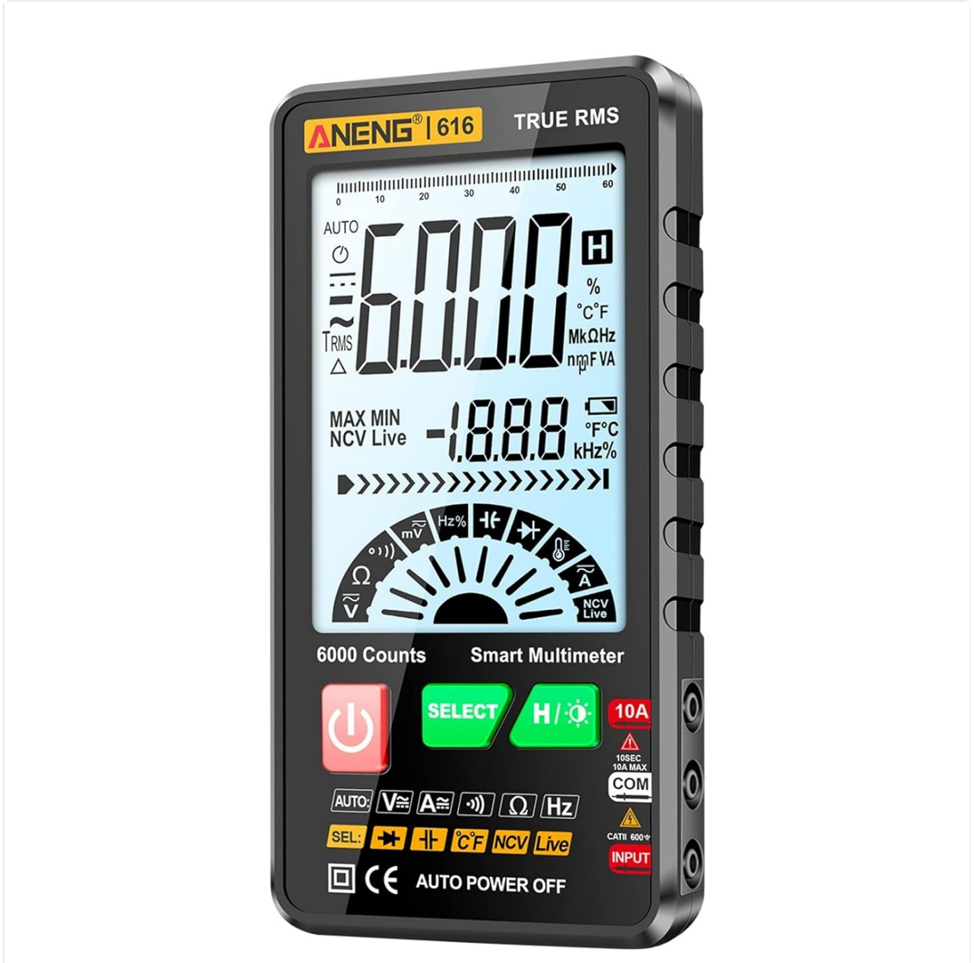
Figure 3.2: A detailed view of the ANENG 616 Multimeter's LCD display. It shows the 6000-count main reading area, along with indicators for various functions such as AC/DC voltage, current, resistance, capacitance, frequency, temperature, NCV, and battery status.

The large 3.5-inch LCD display provides clear readings and various indicators for the selected function and measurement status. Key indicators include: