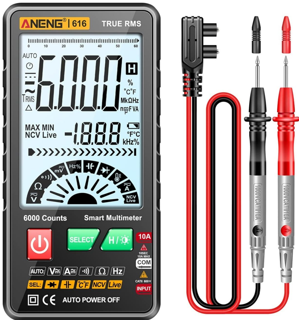
Figure 3.1: The ANENG 616 Smart Digital Multimeter, accompanied by its red and black test leads and a thermocouple for temperature measurements. The multimeter features a large LCD display and clearly labeled function buttons.

1. LCD Display: Large 6000-count display for clear readings.