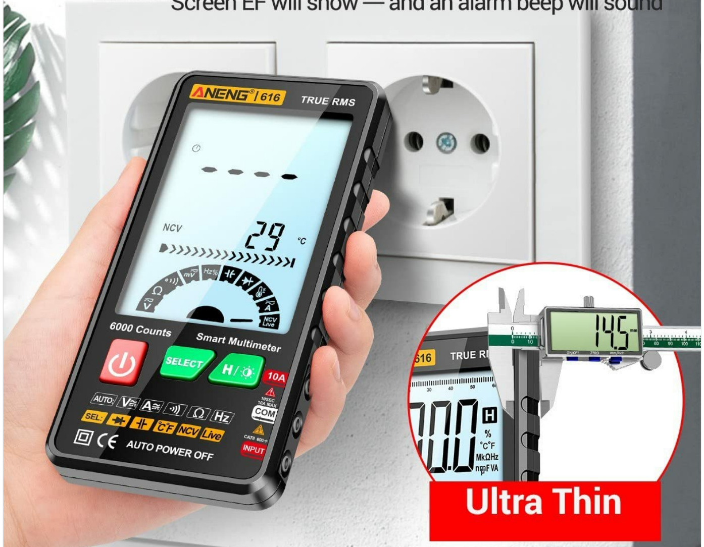
Figure 5.1: The ANENG 616 Multimeter performing NCV (Non-Contact Voltage) detection. The device is held near an electrical outlet, and the display shows the NCV indicator, signifying the presence of AC voltage without direct contact.

Analog bar index rises when nearby AC voltage is detected Screen EF will show — and an alarm beep will sound