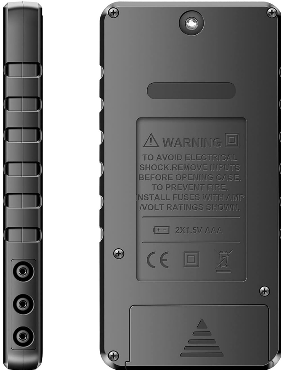
Figure 2.1: Rear view of the ANENG 616 Multimeter, showing the battery compartment and a warning label. The label advises removing inputs before opening the case to prevent electrical shock and fire, and to install fuses with appropriate amp/volt ratings. It also indicates the use of 2x1.5V AAA batteries.