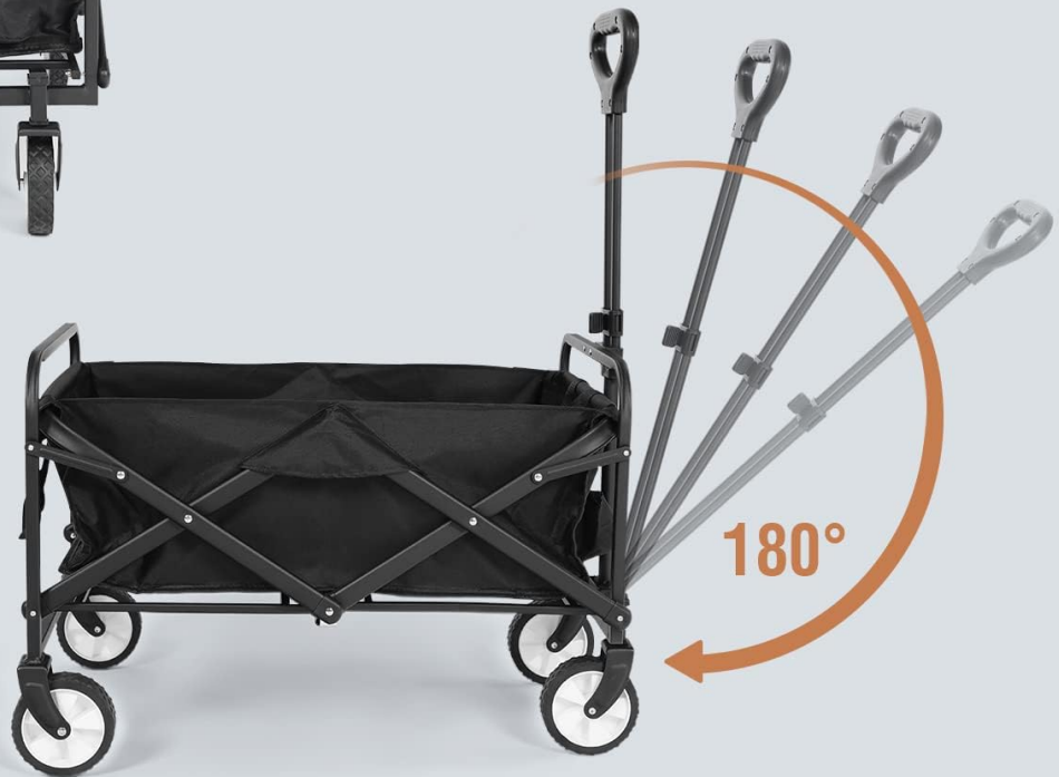
Figure 3.2: The adjustable handle of the LUBBYGIM wagon, which can be extended and its angle modified for comfortable pulling.