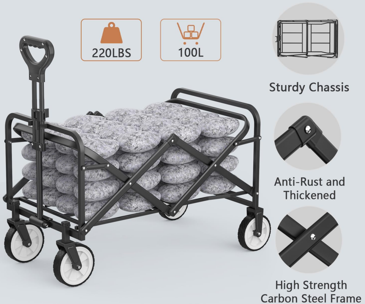
Figure 4.1: The wagon loaded with rocks, illustrating its robust construction and capacity to handle heavy loads up to 220 lbs.

heavy - duty & anti-rust steel frame supports up to 220 lbs