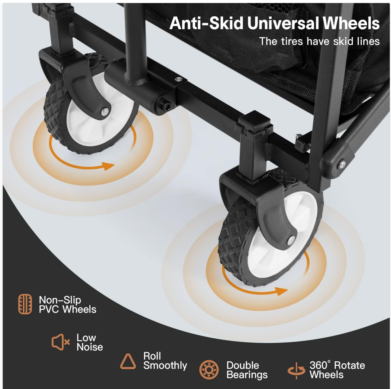
Figure 4.2: Detailed view of the wagon's wheels, emphasizing features like non-slip PVC, low noise, smooth operation, double bearings, and full rotation for easy movement.