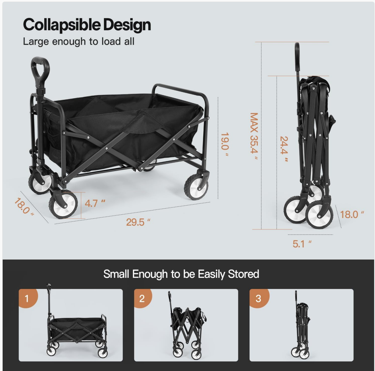
Figure 3.1: The wagon in its unfolded state with dimensions, and its compact folded form.

The wagon is designed for quick and easy setup, requiring no assembly. Simply expand the frame and push down the base.