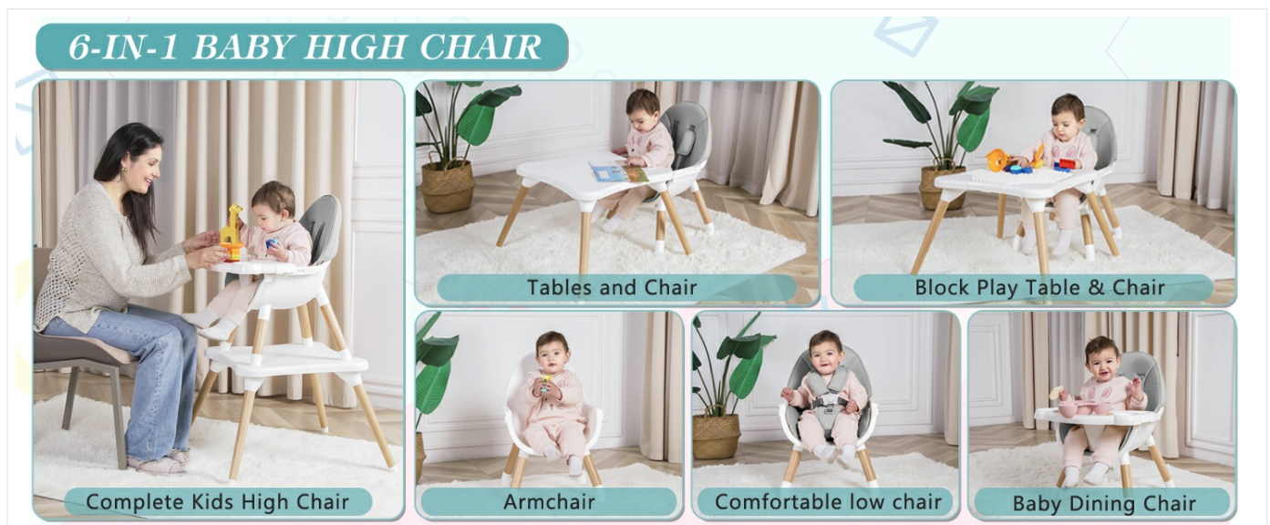
Image: A visual representation of the six different ways the high chair can be configured, including high chair, low chair, and table and chair set.