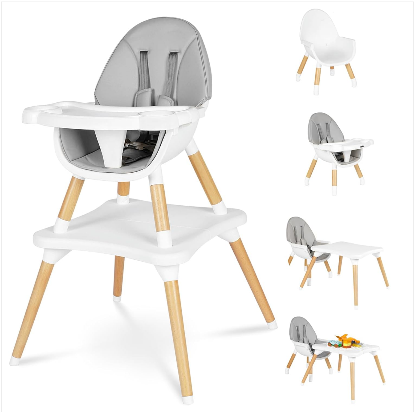
Image: The RICUTON 6-in-1 High Chair shown in its full high chair configuration, with smaller insets illustrating other modes like a low chair, booster, and table and chair set.