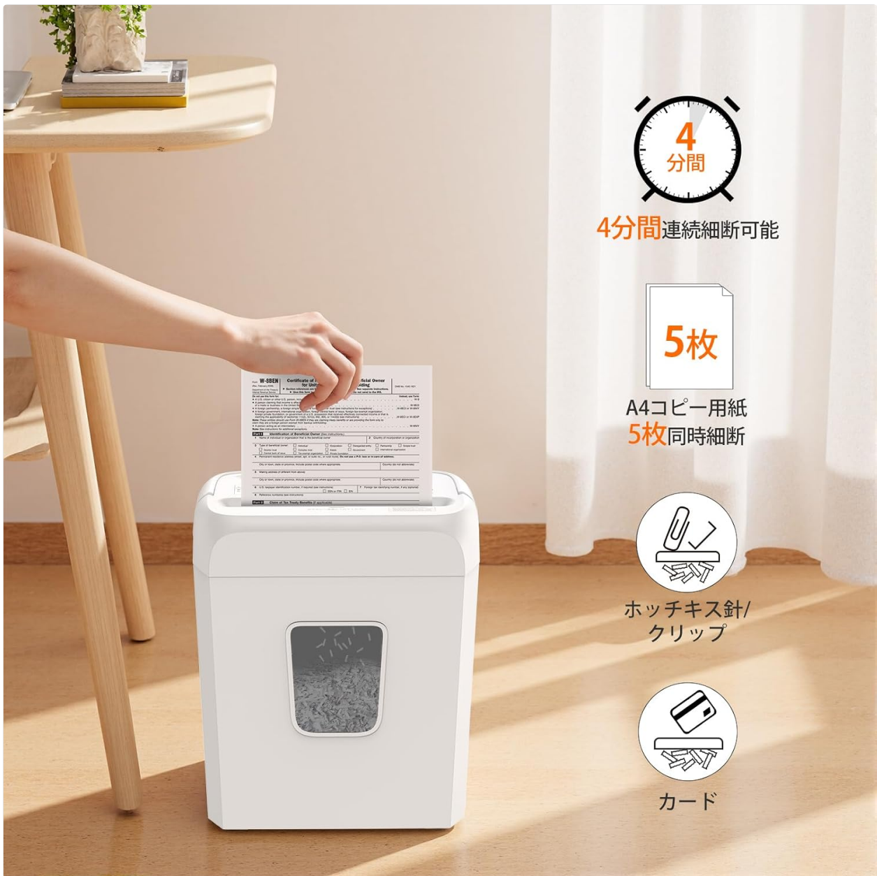
Figure 6.1: The shredder can handle up to 5 sheets of A4 paper simultaneously and has a continuous run time of 4 minutes.