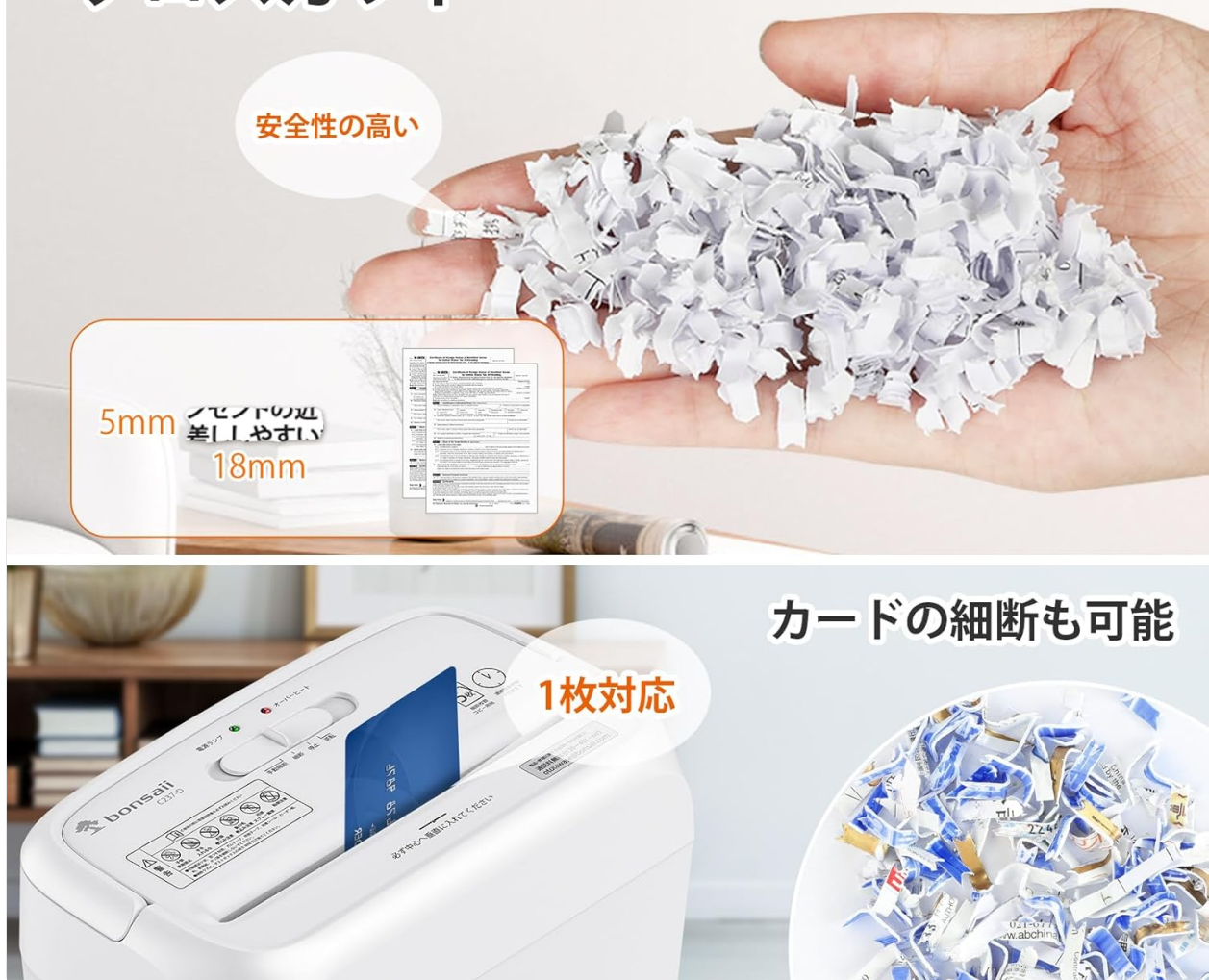
Figure 6.2: The shredder produces 5x18mm micro cross-cut particles for high security and can shred credit cards.