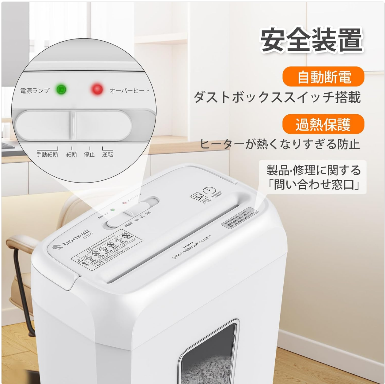
Figure 4.2: Close-up of the control panel and safety features.

The Bonsai C237-D shredder consists of the following main components: