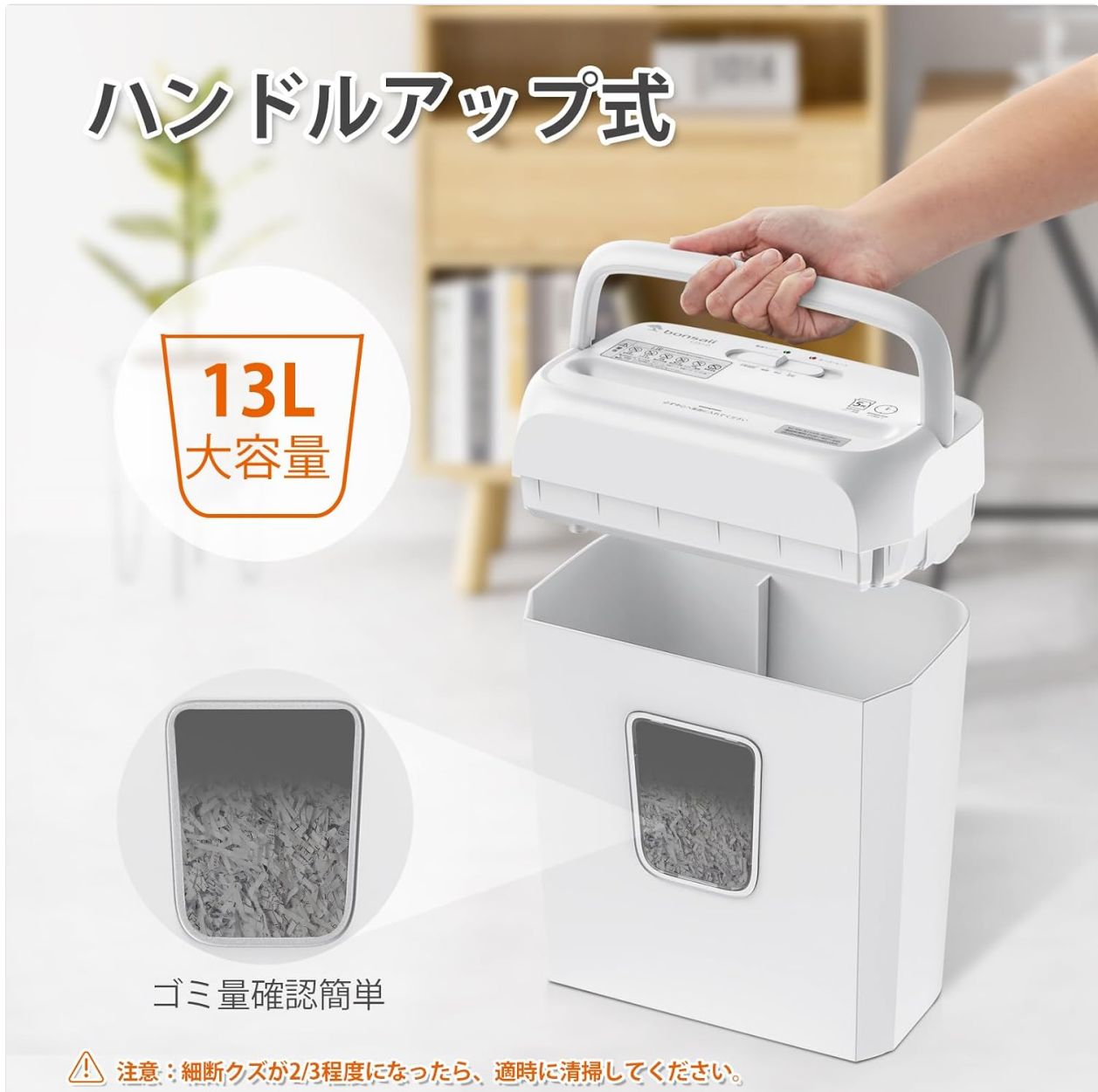
Figure 5.1: The handle-up design allows for easy removal of the shredding head to access the waste bin.