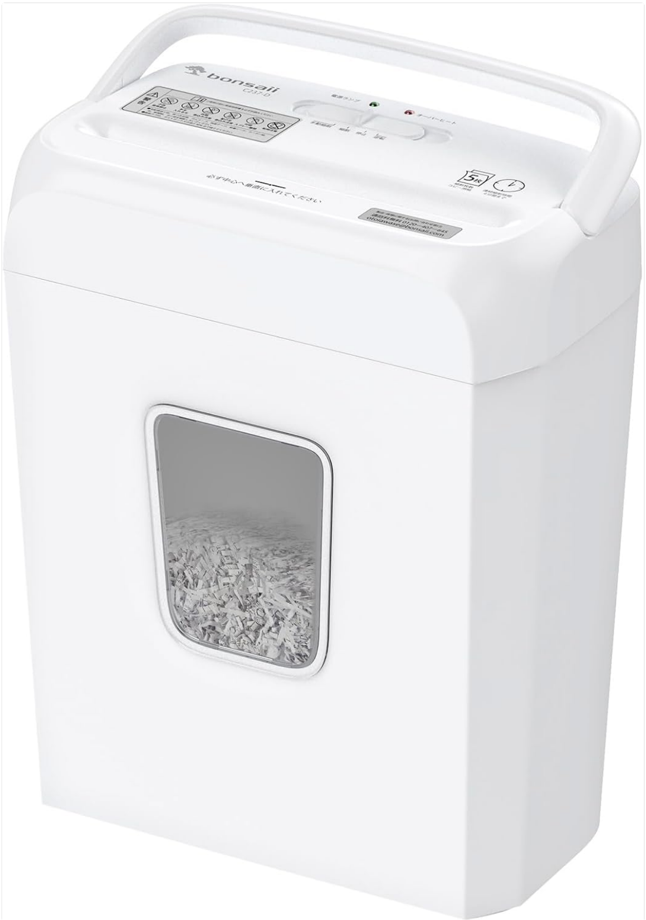
Figure 4.1: Front view of the Bonsai C237-D Shredder.