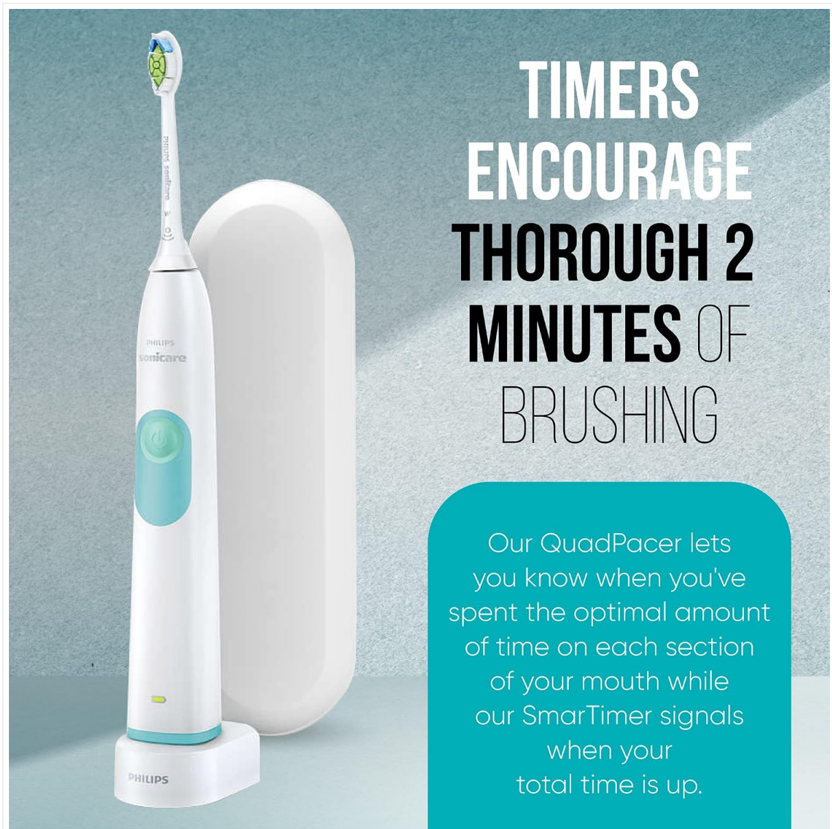
Image Description: The Philips Sonicare EssentialClean toothbrush handle is shown resting on its white charging base. A green indicator light is visible on the handle, signifying that the device is charging.