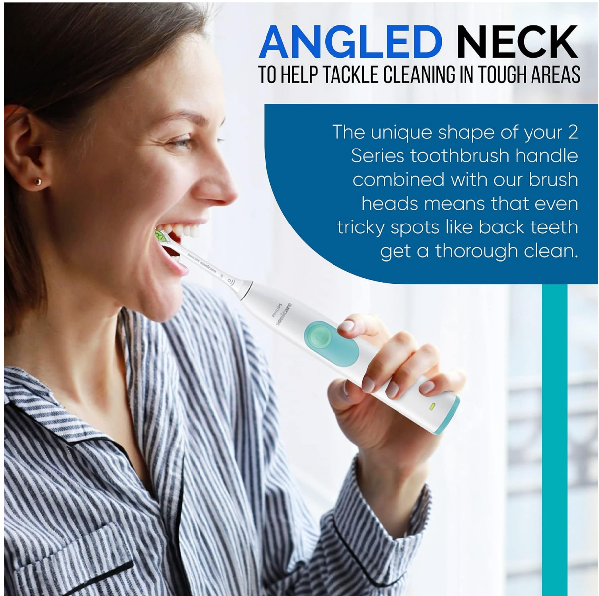
Image Description: A woman is shown brushing her teeth with the Philips Sonicare toothbrush, demonstrating how the angled neck of the brush head allows for effective cleaning in hard-to-reach areas, particularly the back teeth.