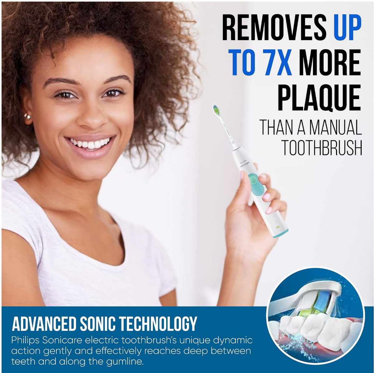
Image Description: A smiling woman holds the Philips Sonicare toothbrush, with an inset graphic illustrating the advanced sonic technology that removes up to 7 times more plaque than a manual toothbrush.

The Philips Sonicare's advanced sonic technology delivers up to 31,000 brush strokes per minute, creating dynamic fluid action that reaches deep between teeth and along the gumline for effective plaque removal. This technology is safe and gentle for various oral health needs, including use with braces, fillings, crowns, veneers, and can be used in the daily treatment of gum disease.