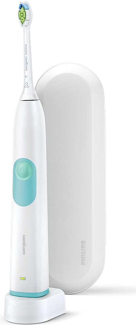
Image Description: The Philips Sonicare EssentialClean electric toothbrush is shown alongside its retail packaging, charging base, and a white travel case. The toothbrush itself is white with a light blue power button and a green-tipped brush head.