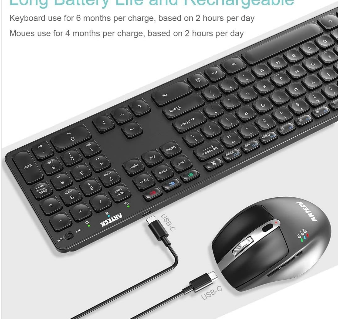
Figure 1: Keyboard and mouse connected for USB-C charging.

Mouses use for 4 months per charge, based on 2 hours per day