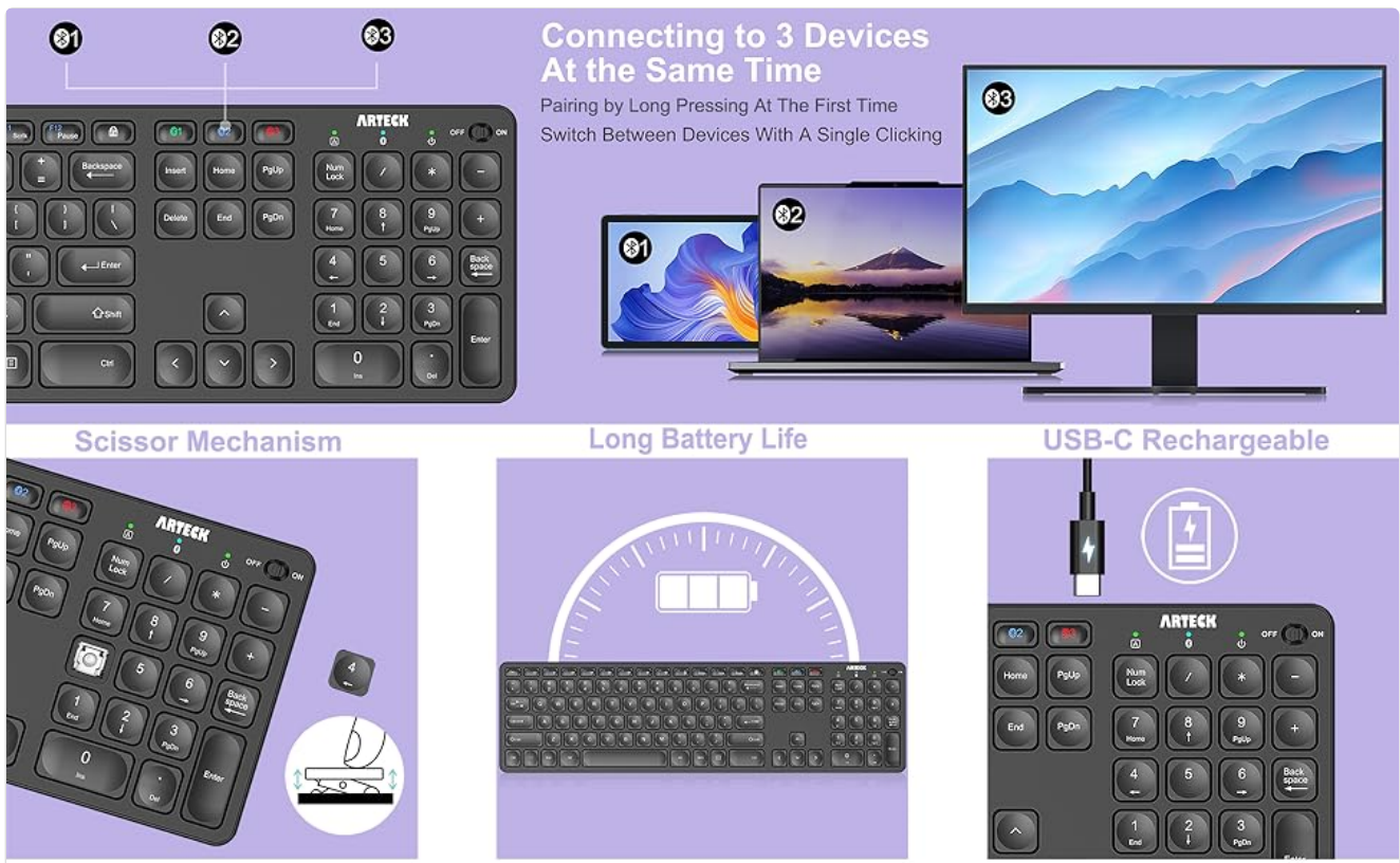
Figure 2: Multi-device connection setup for keyboard and mouse.