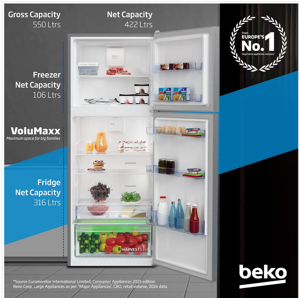
Image: Overview of the Beko RDNT550XS refrigerator's internal capacity, showing gross capacity of 550 liters, net capacity of 422 liters, freezer net capacity of 106 liters, and fridge net capacity of 316 liters.