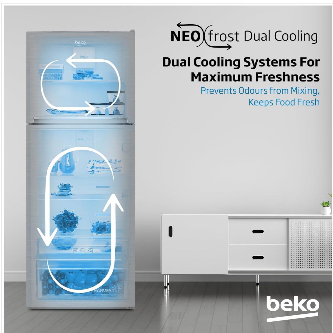
Image: Diagram illustrating the NeoFrost Dual Cooling system with separate airflows for the refrigerator and freezer compartments, preventing odor mixing.