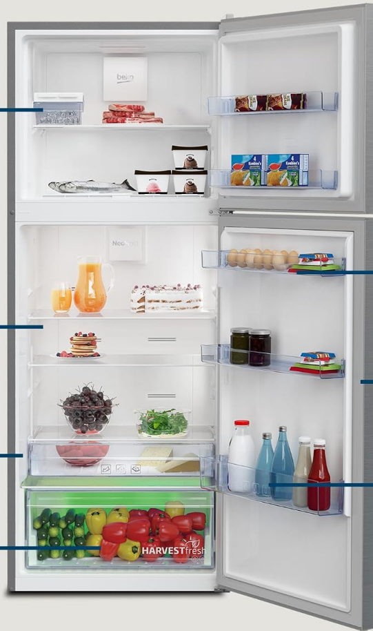
Image: Interior view of the Beko RDNT550XS refrigerator, highlighting features like adjustable tempered glass shelves, chiller compartment, spacious crisper box, compact egg tray, large beverage compartment, and twist & serve ice cube tray.