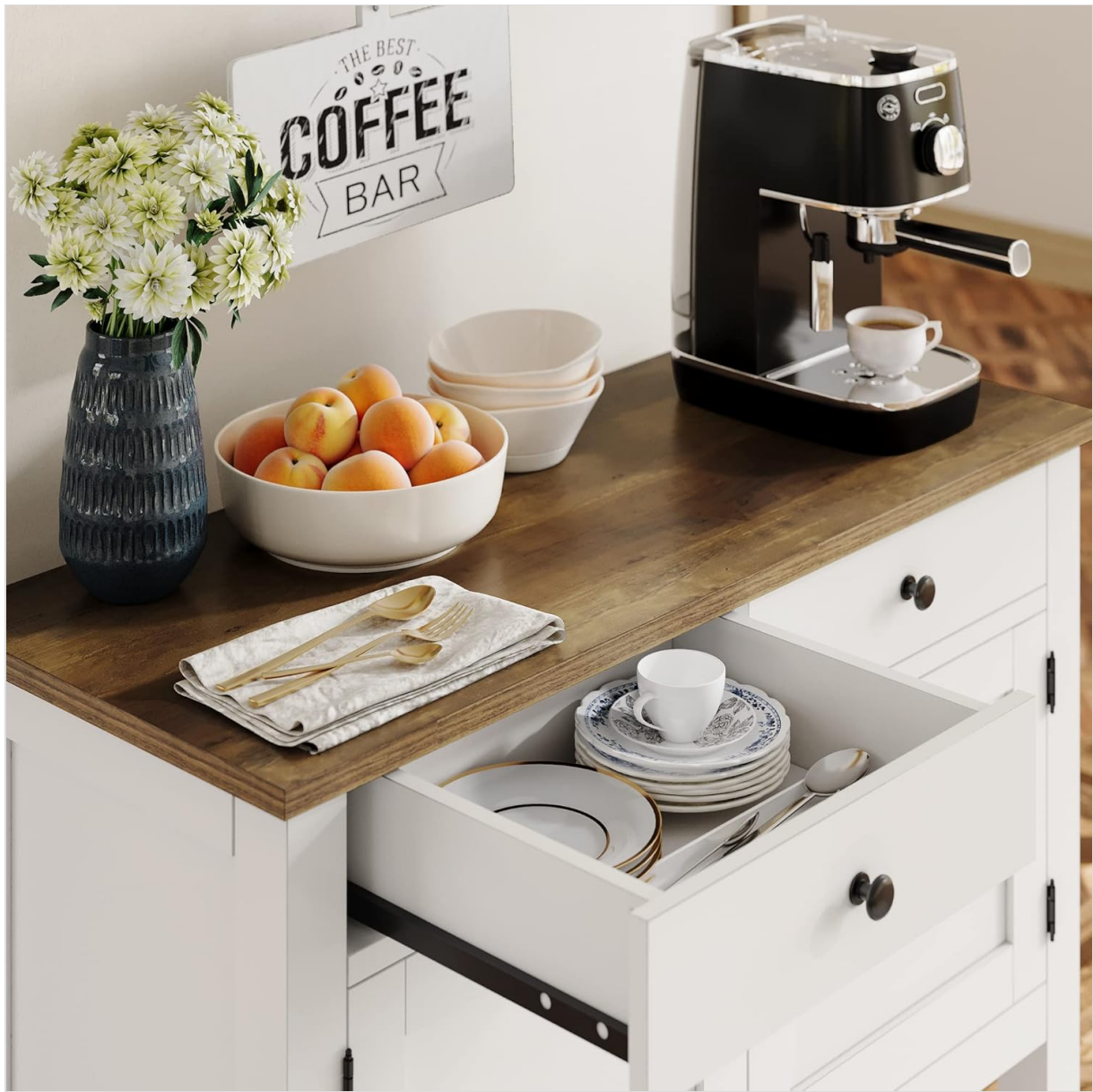
Image: A close-up view of one of the console table's drawers, open and containing plates and cutlery, demonstrating its storage capacity.