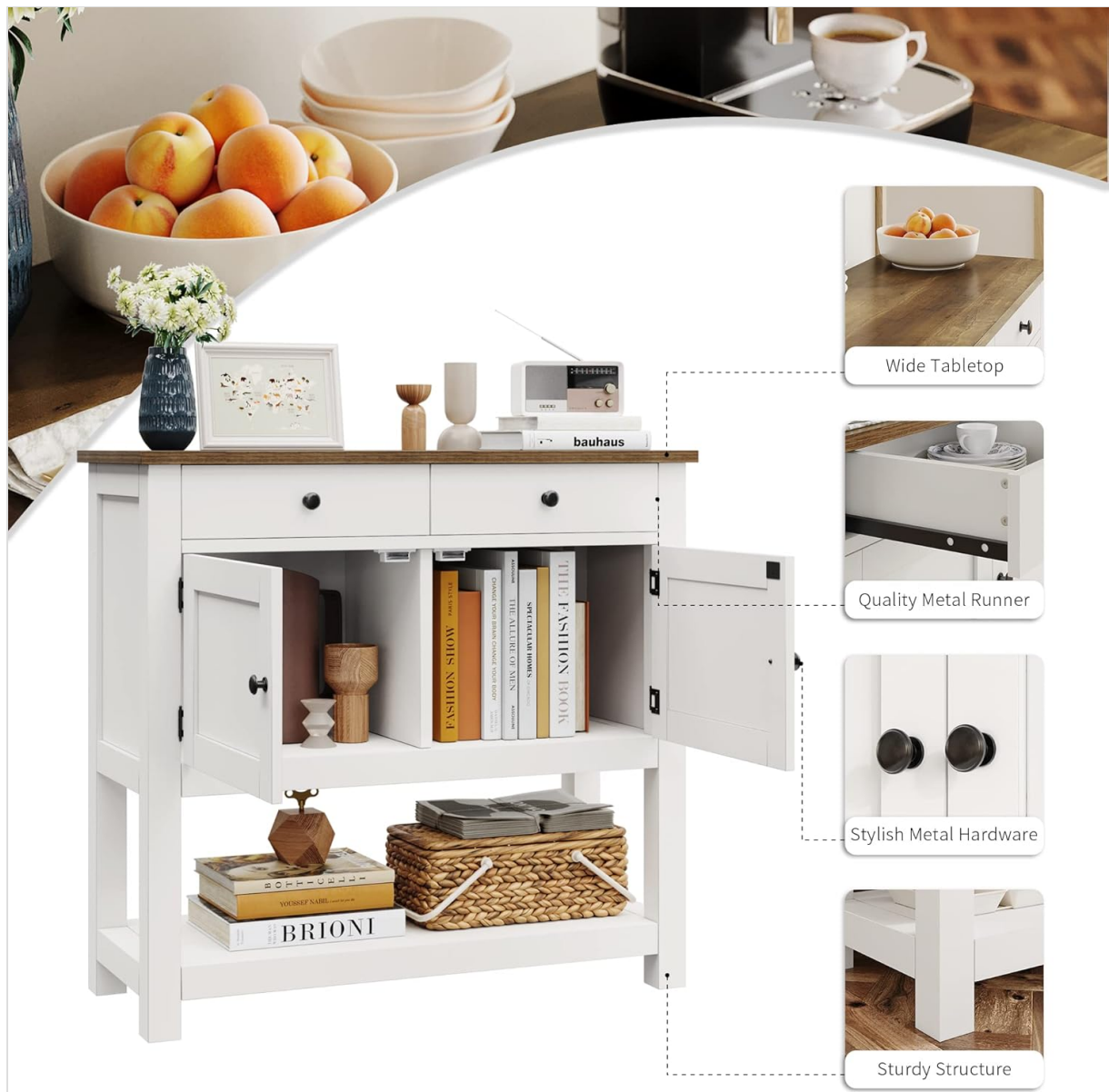
Image: A diagram highlighting key features of the console table, including its wide tabletop, quality metal drawer runners, stylish metal hardware (knobs and hinges), and sturdy overall structure.