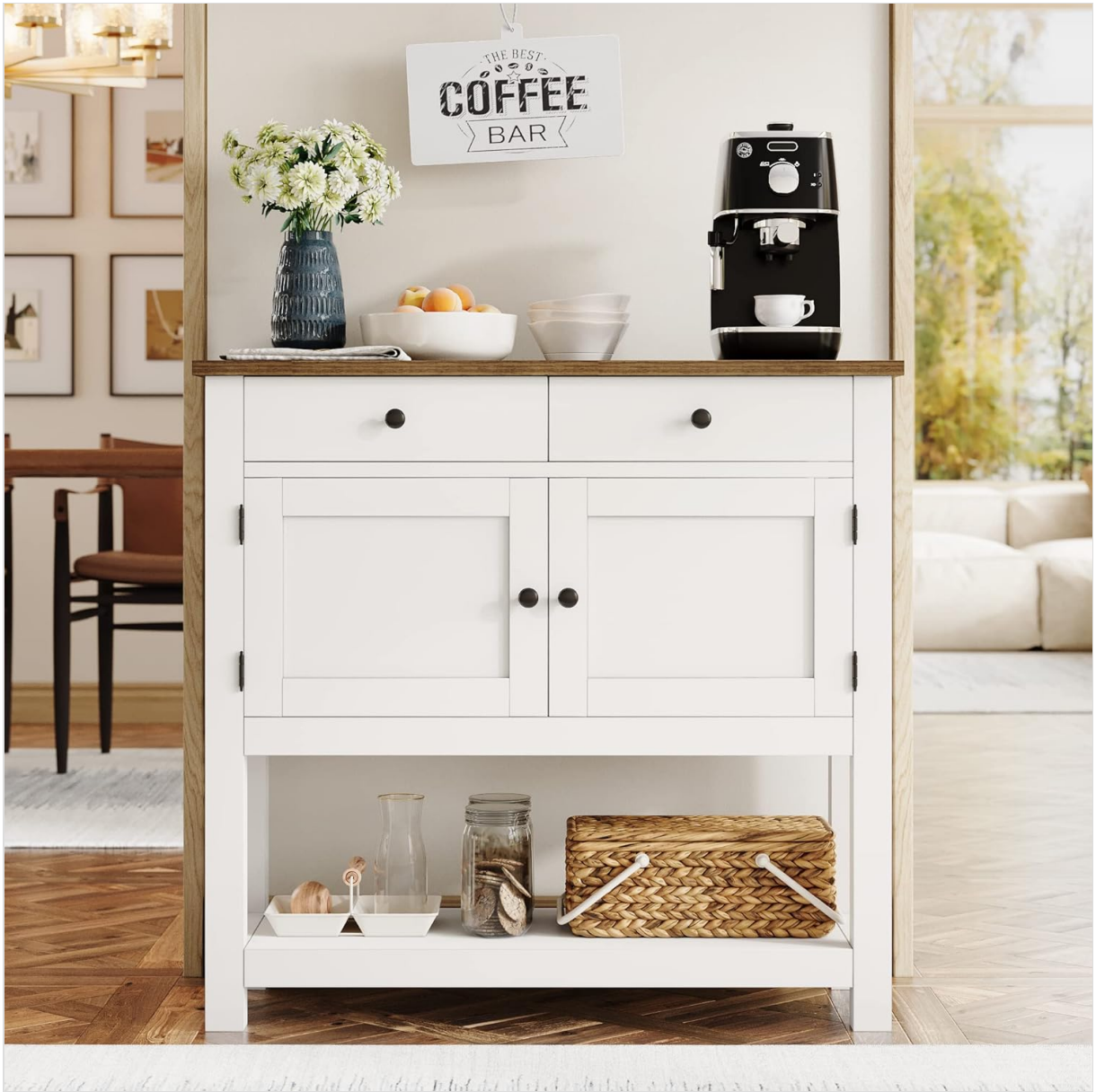
Image: The console table configured as a coffee bar, featuring a coffee machine, fruit bowl, and decorative sign.