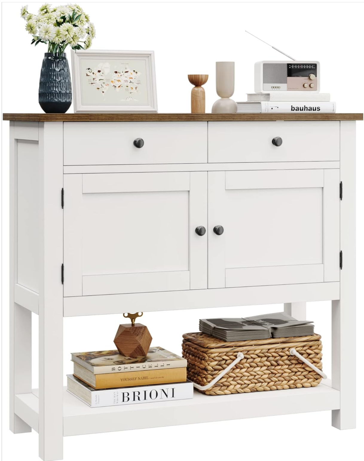
Image: The HOSTACK Farmhouse Console Table in white with a brown top, featuring two drawers and a two-door cabinet, with an open bottom shelf. Decorative items are placed on top and the shelf.