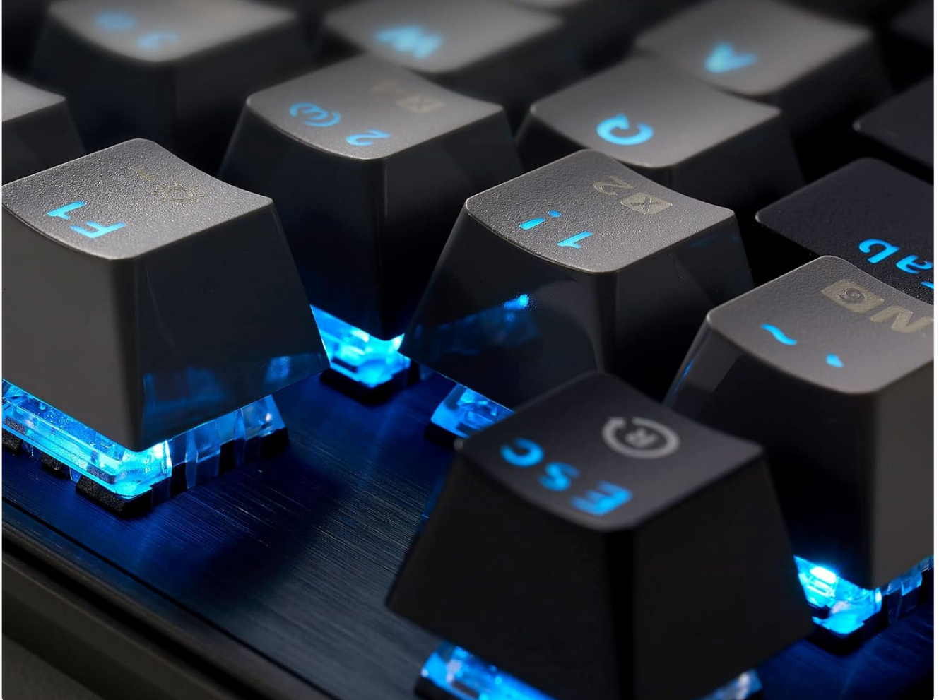
Image 2.2: Detailed view of the double-shot ABS keycaps and blue backlighting on the GK715 keyboard.