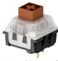
Brown Tactile Switch

Typing Smoothly Up and Down For Entertain and Work