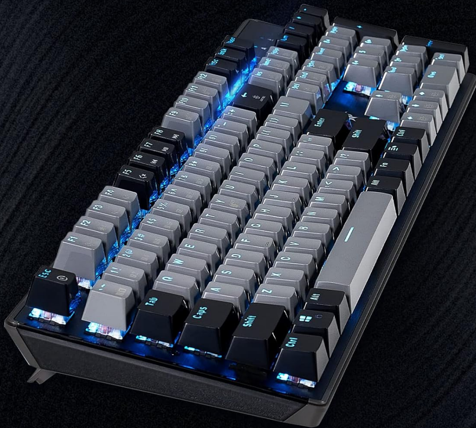
Image 2.1: The GK715 keyboard showcasing its 104-key layout and anti-ghosting capability.