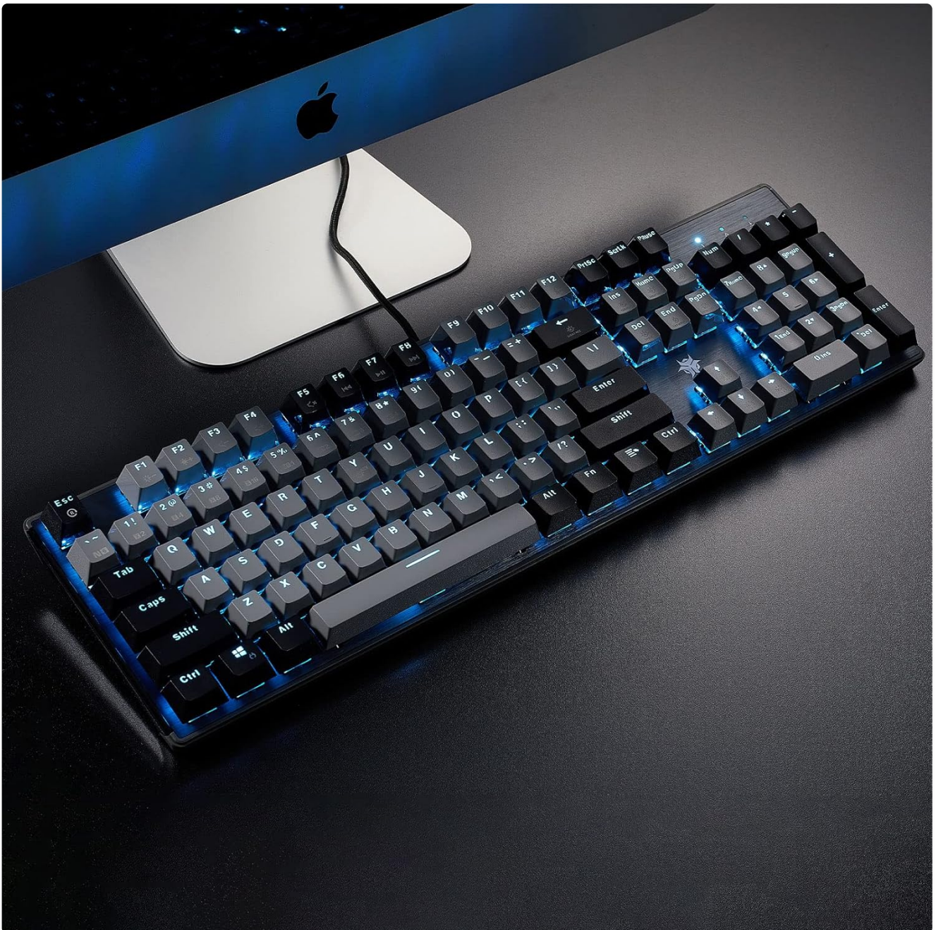
Image 3.2: The GK715 keyboard in a typical computer setup, demonstrating its wired connection and blue backlighting.