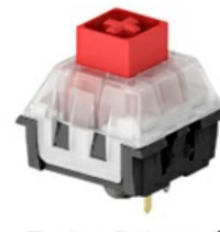
Red Linear Switch

Typing Smoothly Up and Down For Entertain and Work