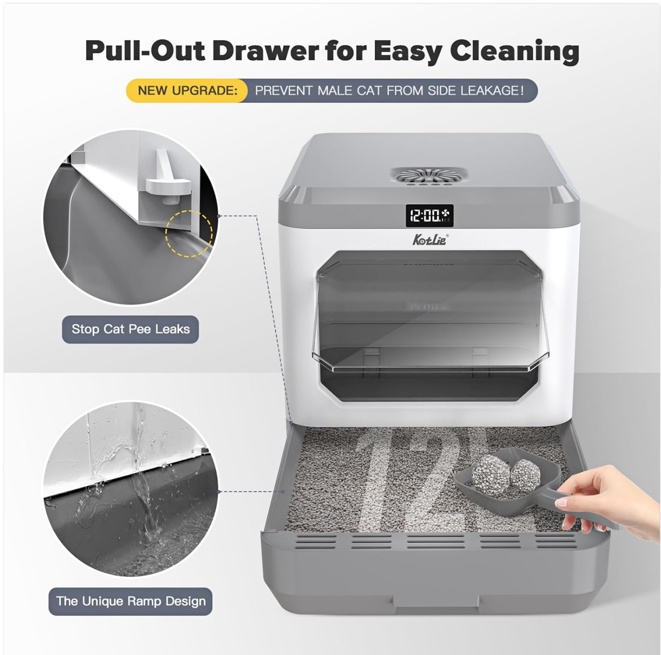
Figure 6: Easy Cleaning with Pull-Out Drawer. This image demonstrates the convenience of the pull-out drawer for quick and easy cleaning of the litter, minimizing mess and effort.

Your browser does not support the video tag.