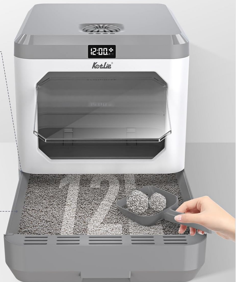
Figure 3: Pull-Out Drawer Design. The image highlights the pull-out drawer mechanism, which simplifies litter changing and cleaning. Note the upgraded ramp design with raised edges to prevent male cat urine side leakage.

Your browser does not support the video tag.