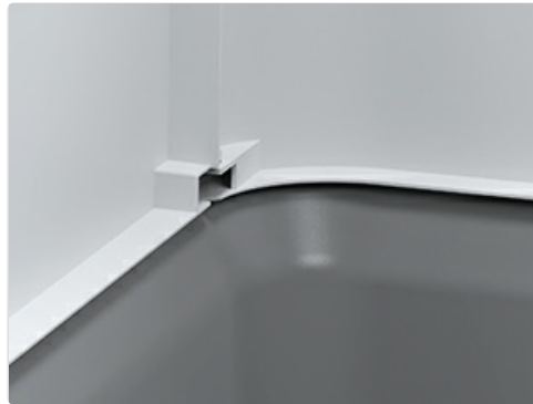
Figure 7: Litter Mat. The image shows the textured surface of the included litter mat, designed to capture loose litter from your cat's paws.

The silicone litter mat is designed to trap loose litter. Simply shake off trapped litter back into the box or dispose of it. The mat can be rinsed with water and air-dried.