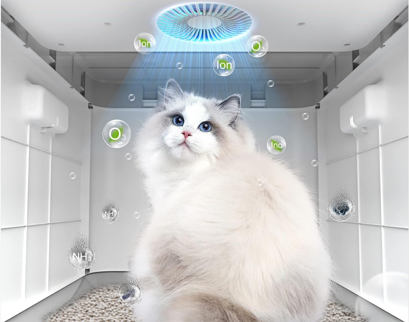
Figure 5: Advanced Plasma Device. This image illustrates the internal workings of the advanced plasma device, showing how ions and ozone are used to neutralize odors and disinfect the litter box environment.

Indulge in an odor-free environment with Kotlie plasma odor control cat litter box