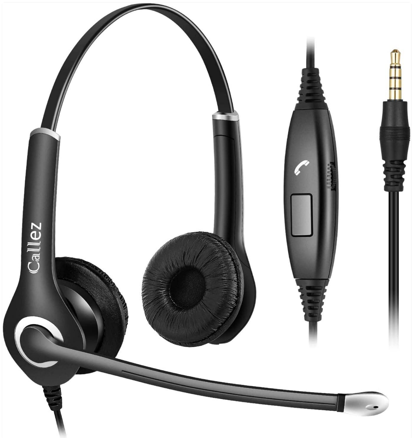
Image: The Callez 3.5mm Cell Phone Headset, showcasing its design with the 3.5mm jack and in-line controls.