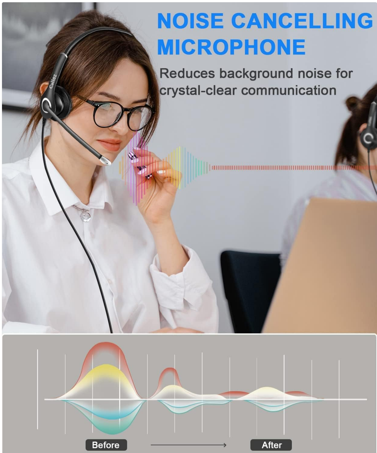
Image: A person wearing the headset, demonstrating the noise-cancelling microphone feature with a graphic showing sound wave reduction before and after processing.

The built-in noise-cancelling microphone is designed to reduce background noise, ensuring clearer communication. Position the microphone correctly to maximize this feature's effectiveness.