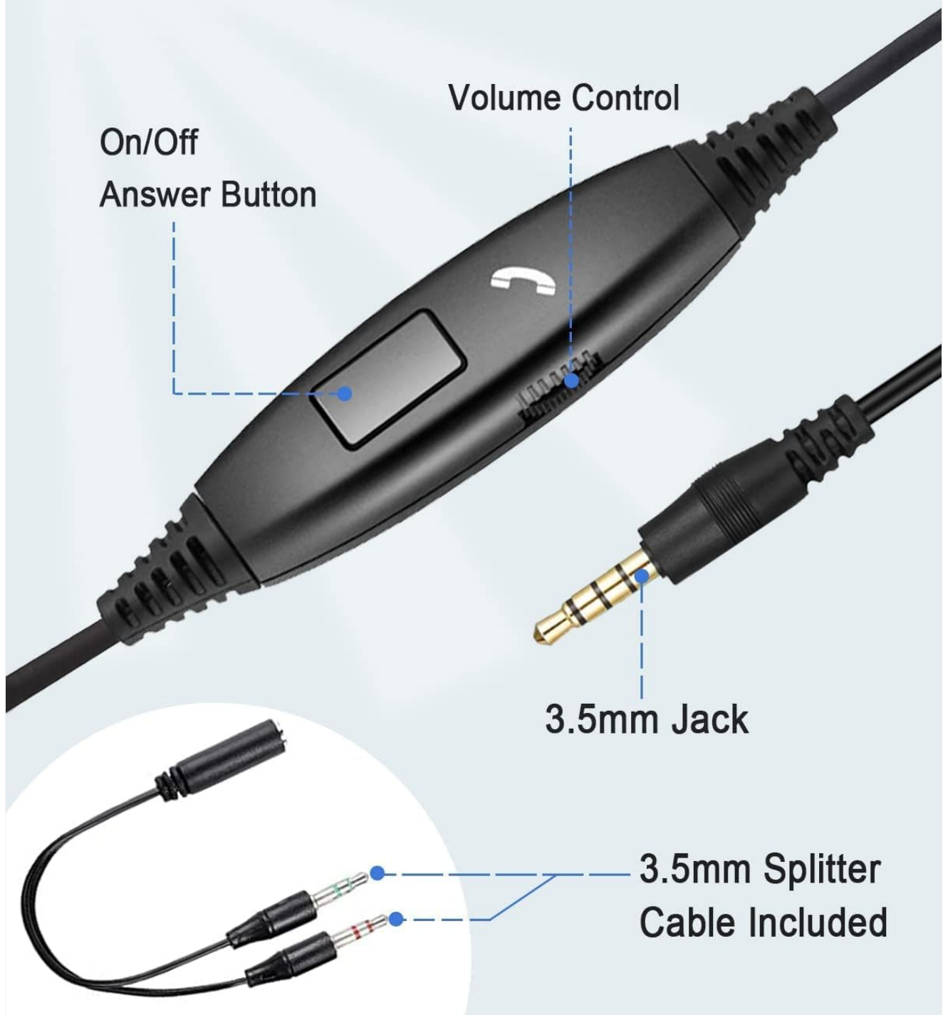
Image: Close-up view of the in-line control unit, highlighting the volume control and answer/end call button.