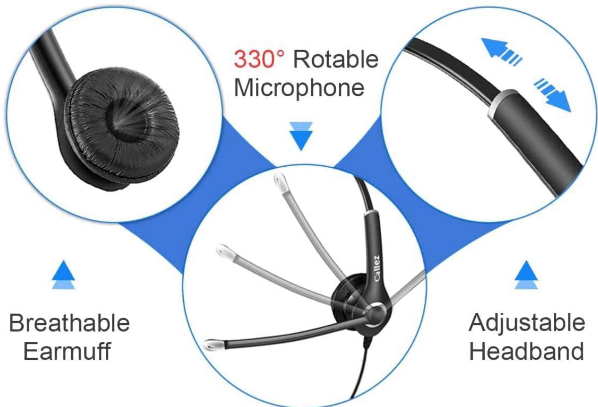
Image: Diagram illustrating the adjustable headband, breathable earmuff, and 330° rotatable microphone for enhanced comfort.