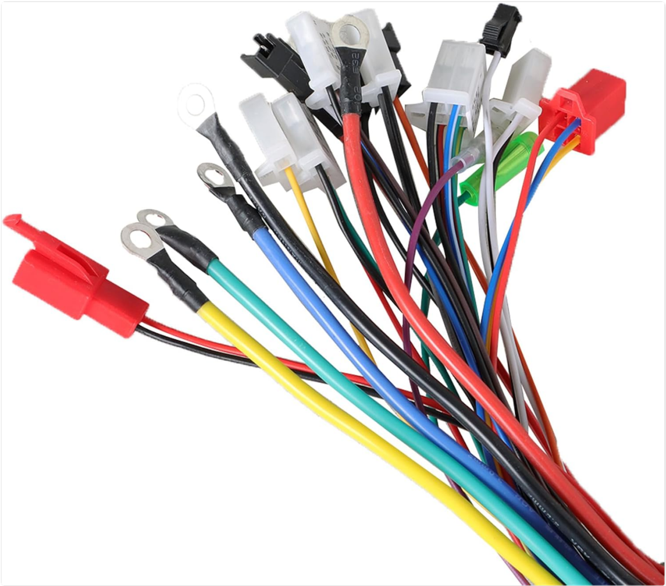
Figure 2.2: A detailed view of the various connectors and wire bundles extending from the controller, showing the different types of plugs for specific functions.