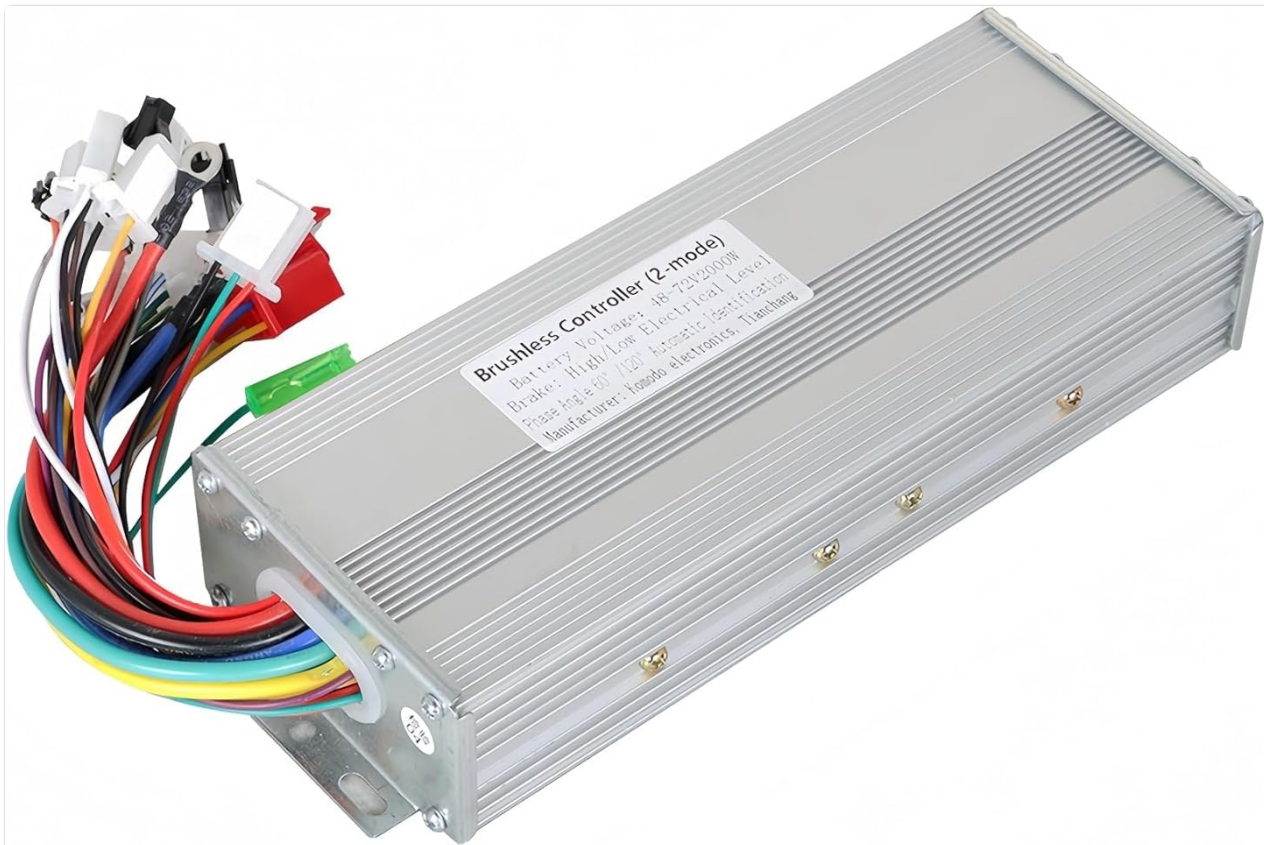
Figure 1.1: The Silsco 48-72V 2000W Brushless Motor Speed Controller, showcasing its robust aluminum casing and integrated wiring harness.