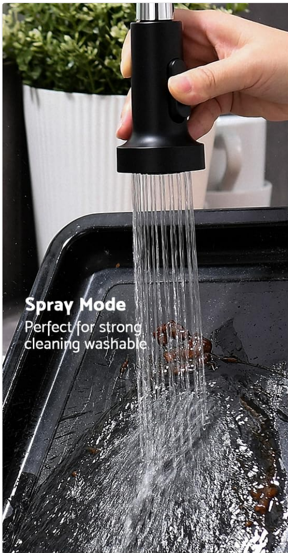
Spray Mode Perfect for strong cleaning washable