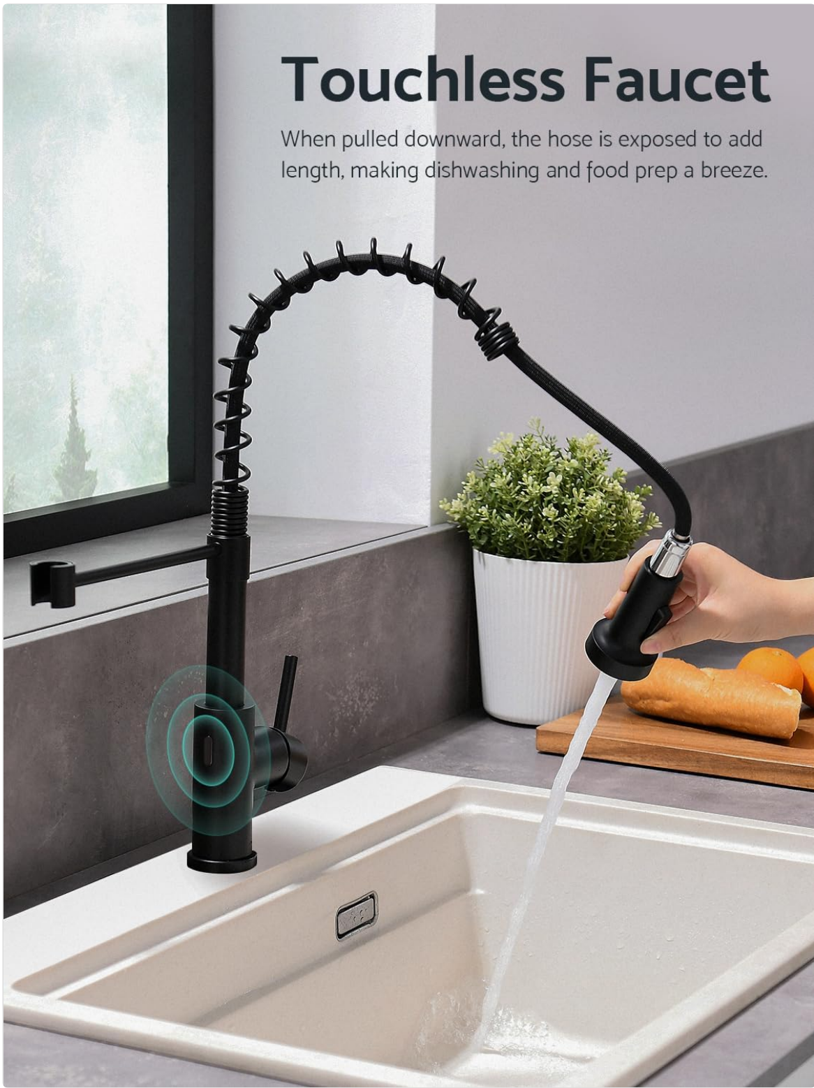
Image: Touchless Faucet operation. A hand is shown waving near the faucet to activate the water flow, demonstrating the motion sensor feature.

When pulled downward, the hose is exposed to add length, making dishwashing and food prep a breeze.