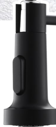
Image: Multifunctional Outlet Water Effect. This image illustrates the two available water modes: a powerful spray for cleaning and a steady stream for filling.

Offer unique flexibility in kitchen operations to reach any of your needs.