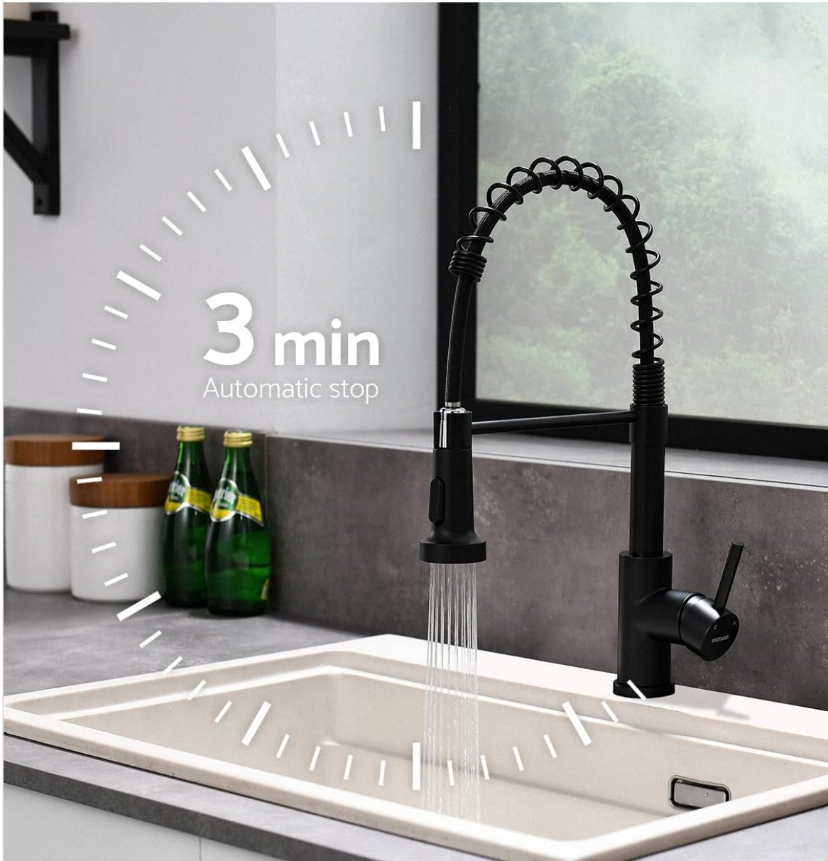
Image: Automatic Shut-Off feature. The faucet is shown with water flowing, indicating the 3-minute automatic shut-off timer for water conservation.

It will stop water flow in sensor mode after 3 minutes to prevent water waste in case of accidental activation.