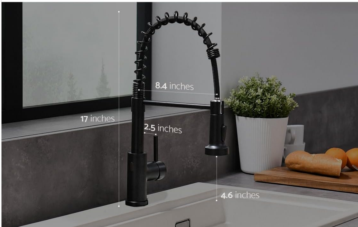
Image: Faucet Dimensions. A diagram illustrating the key dimensions of the faucet, including required hole size, supply hose size, and overall height and reach.