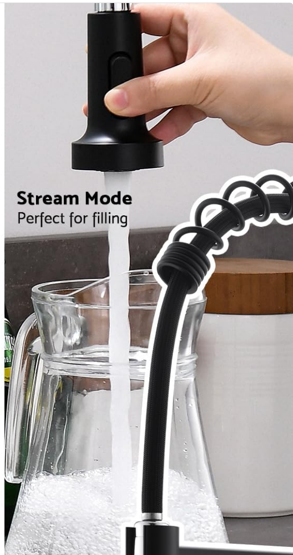
Stream Mode Perfect for filling