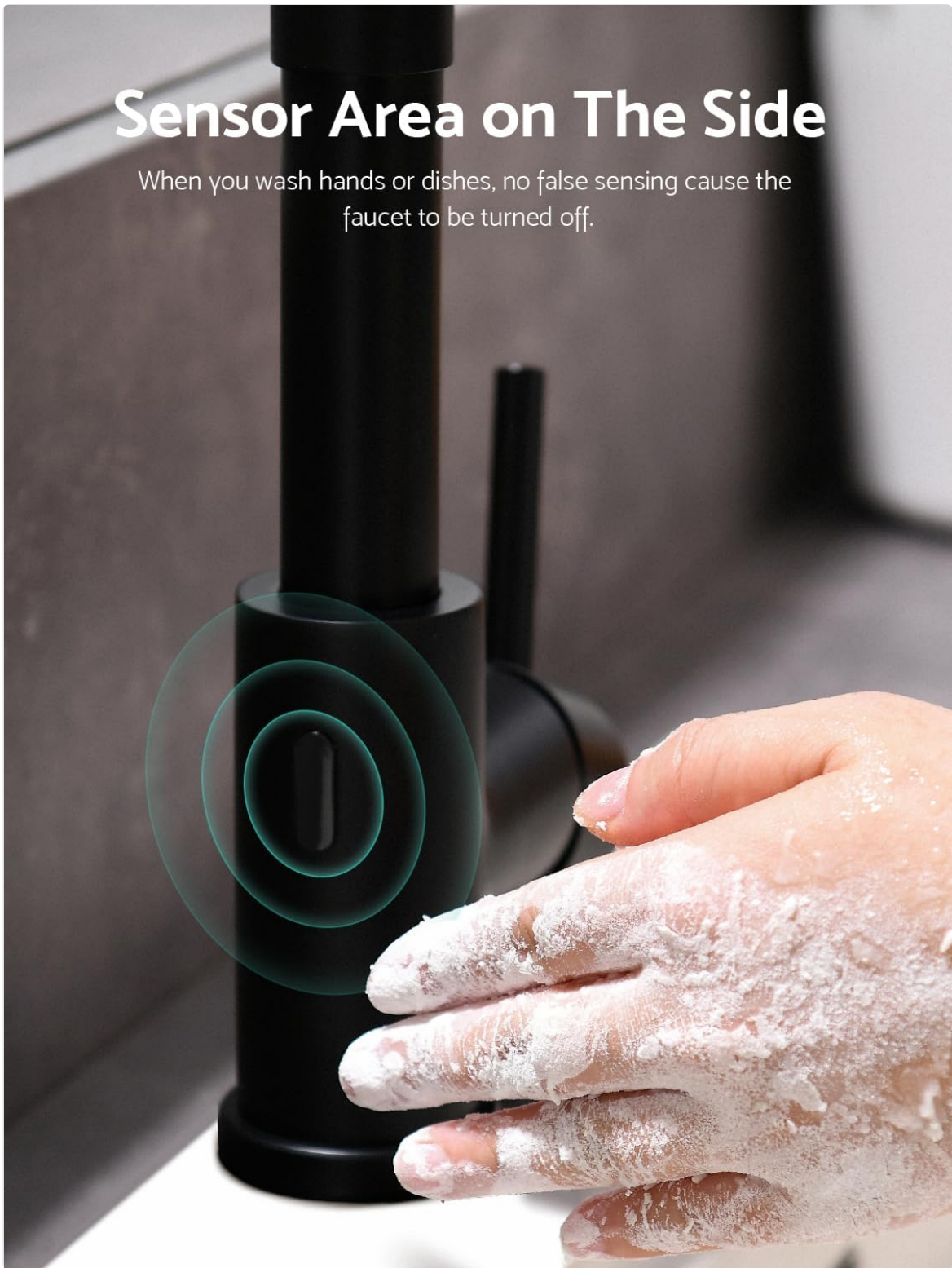
Image: Sensor Area on the Side. A close-up view highlights the motion sensor located on the side of the faucet, designed to prevent false activations.

When you wash hands or dishes, no false sensing cause the faucet to be turned off.