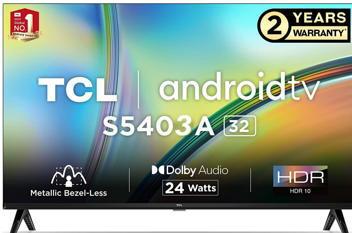
Image: The TCL S Series 32-inch Smart Android TV, showcasing its sleek design and the Android TV interface with popular streaming applications like Netflix, Prime Video, YouTube, and Twitch.

This manual provides essential information for setting up, operating, and maintaining your TCL S Series 32-inch HD Ready LED Smart Android TV. Please read this manual thoroughly before using your television to ensure proper and safe operation. Keep this manual for future reference.