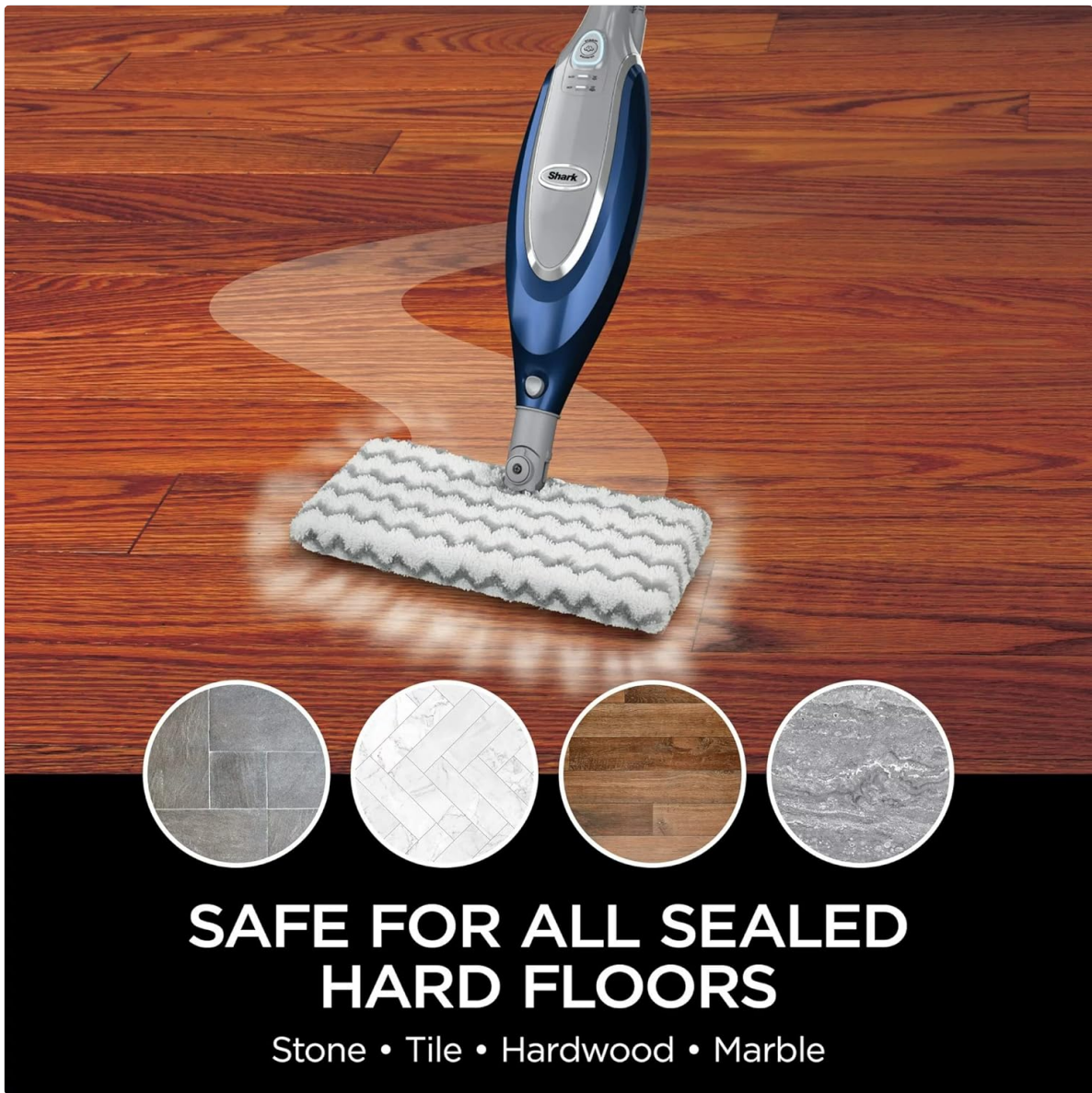
Image 4: Visual representation indicating the Shark Steam Mop is safe for various sealed hard floor types: stone, tile, hardwood, and marble.