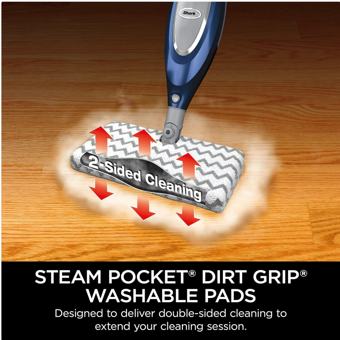
Image 9: Close-up of the Steam Pocket Dirt Grip Washable Pads, emphasizing their design for double-sided cleaning and reusability.