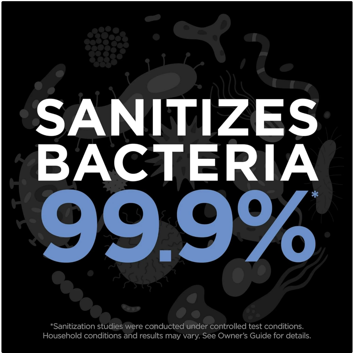
Image 7: Graphic indicating the Shark Steam Mop's ability to sanitize 99.9% of bacteria, with a background of various microorganisms.