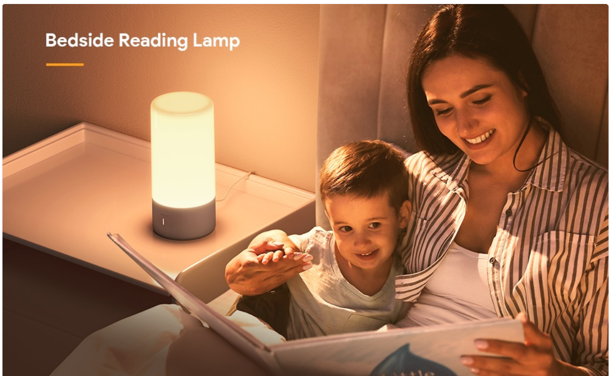
Image: The Hifree T6 Table Lamp demonstrating its brightness adjustment capabilities, tunable from 5% to 100%.