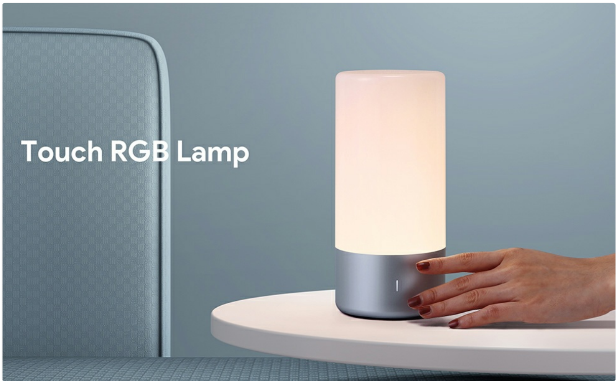
Image: Overview of the Hifree T6 Table Lamp's sensitive touch panel features, including adjustable color, brightness, and power control.