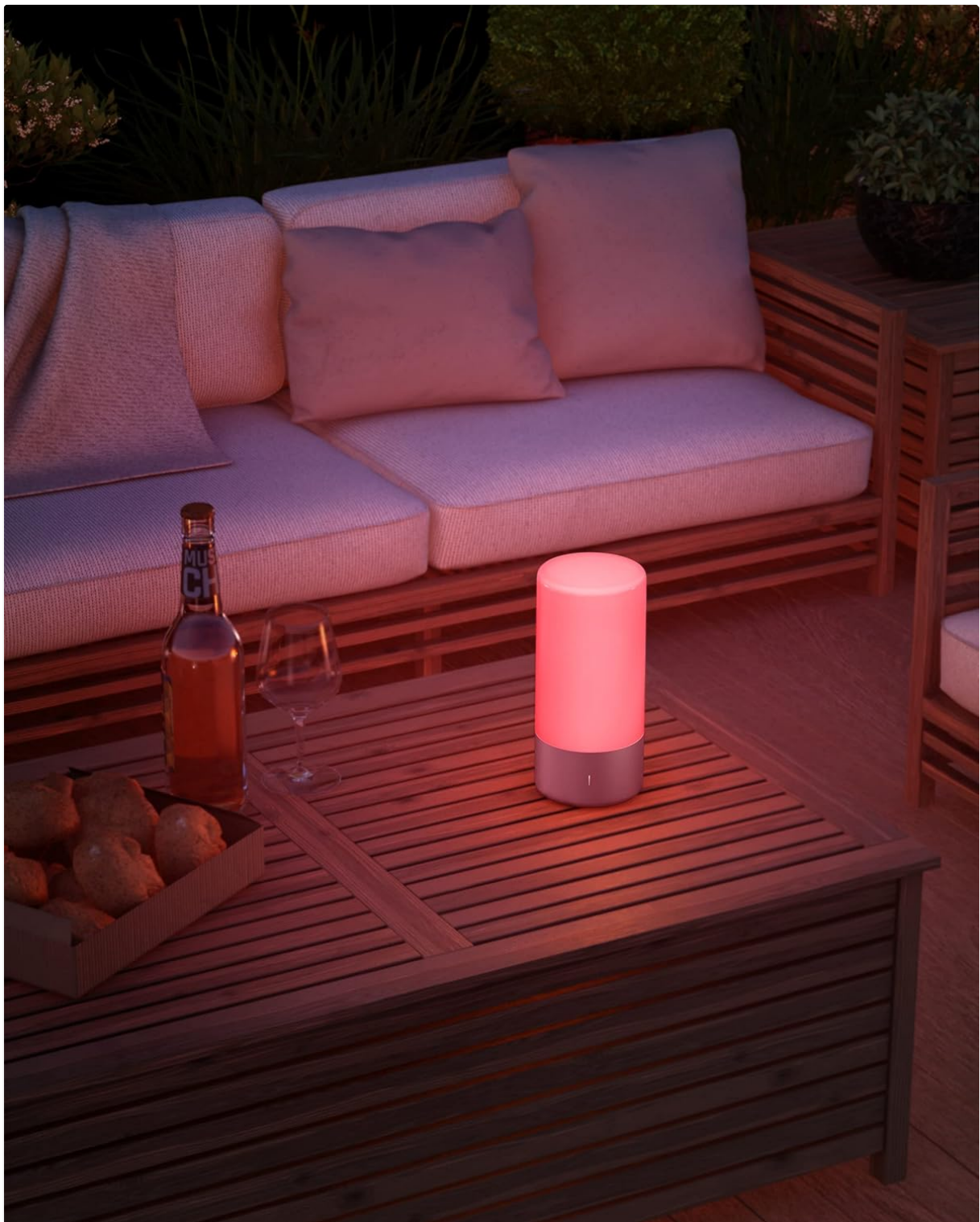
Image: The Hifree T6 Table Lamp highlighting its curved edge and upgraded touch sensor on the base.