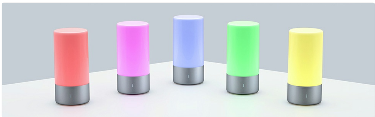
Image: A row of Hifree T6 Table Lamps illuminated in various RGB colors, demonstrating the range of color options.