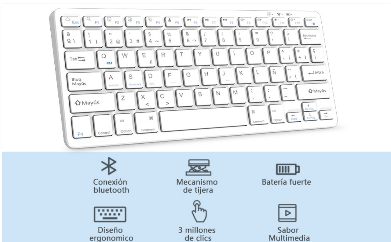
Image 5.2: Visual representation of the keyboard's multimedia function keys and their corresponding actions.

Note: Some functions may require specific operating system support or configuration.