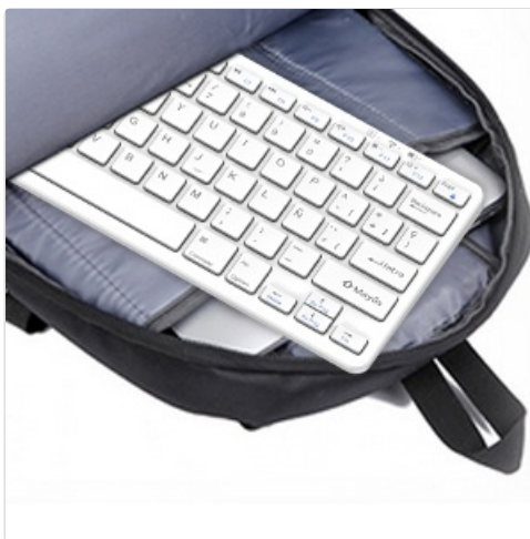
Image 6.1: The aMZCaSE Bluetooth Keyboard easily fits into a backpack, highlighting its portability.