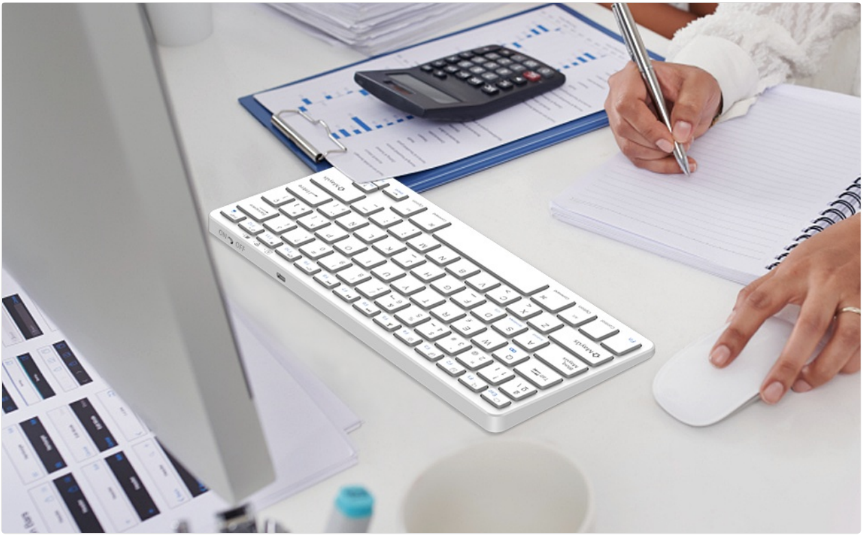
Image 4.2: The aMZCaSE Bluetooth Keyboard demonstrating universal compatibility with Android, Windows, and iOS devices.