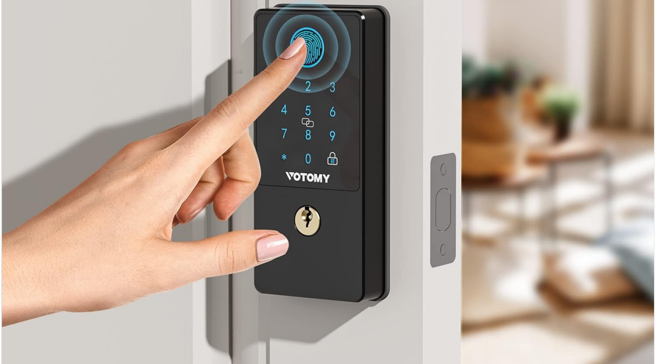
Figure 4.1: Multiple convenient ways to unlock your door.