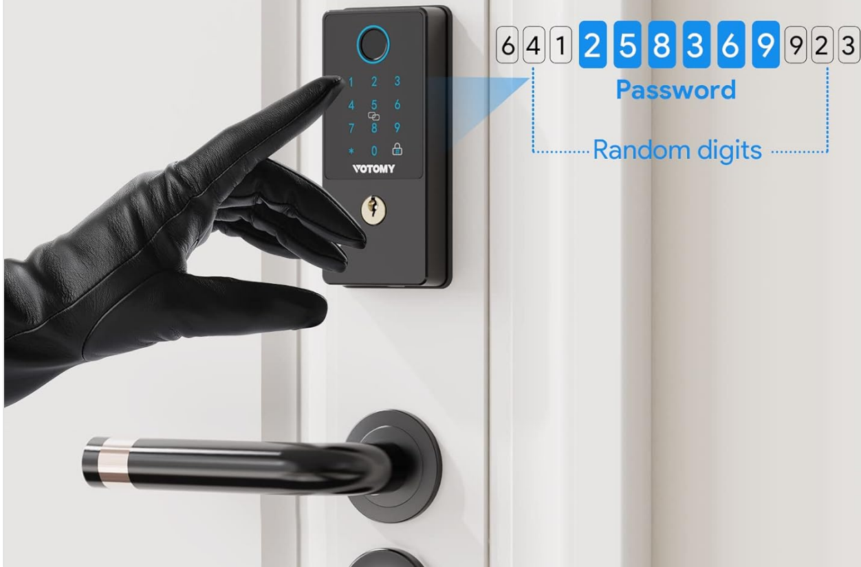
Figure 4.4: Anti-peep touchscreen keypad for enhanced security.

Add random digits before and after your password to protect from prying eyes