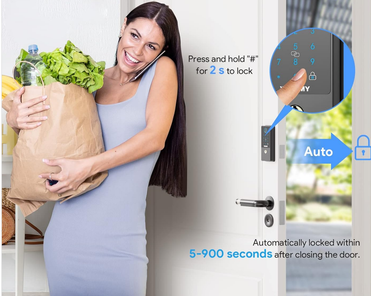
Figure 4.3: Auto-lock and one-touch locking for added convenience.