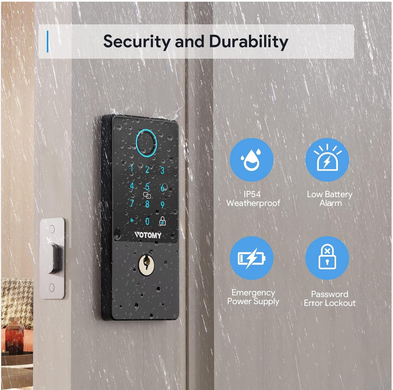
Figure 3.1: Security and durability features of the lock.