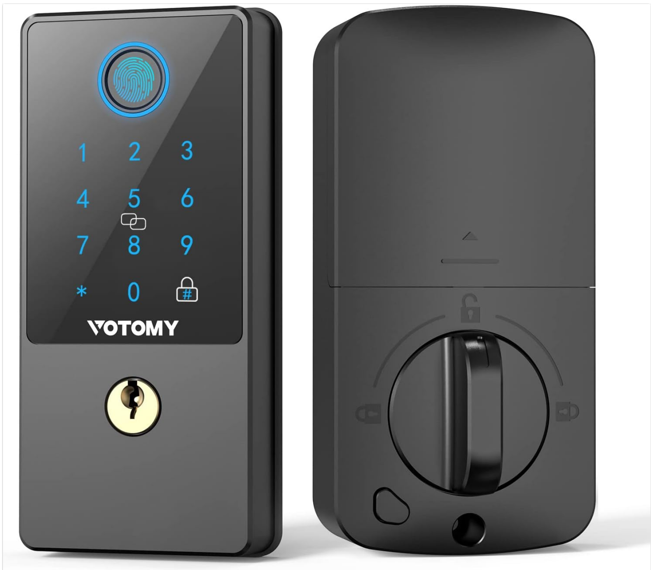
Figure 1.1: Front and back view of the ED007 Fingerprint Door Lock.