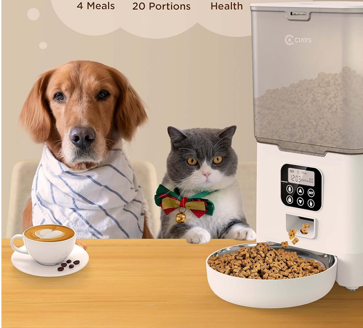
Image 1.1: Ciays Automatic Pet Feeder in use, highlighting its core functionalities.