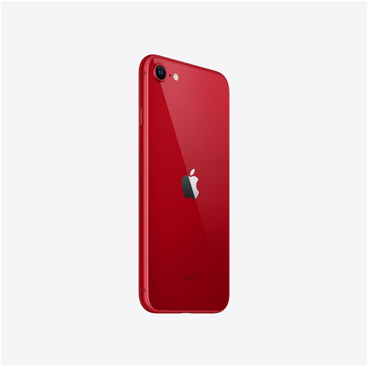
Figure 2: Side view of the iPhone SE 3rd Gen's right side, highlighting the SIM card slot and volume buttons.