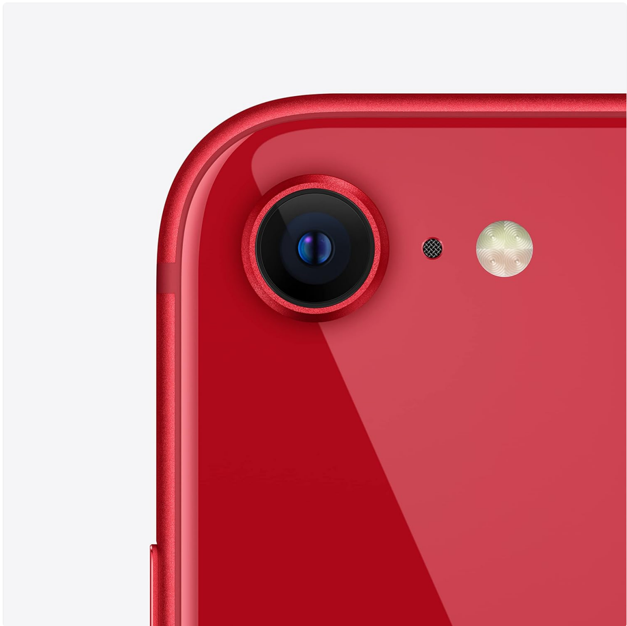
Figure 4: Detailed view of the iPhone SE 3rd Gen's single rear camera lens and flash module.