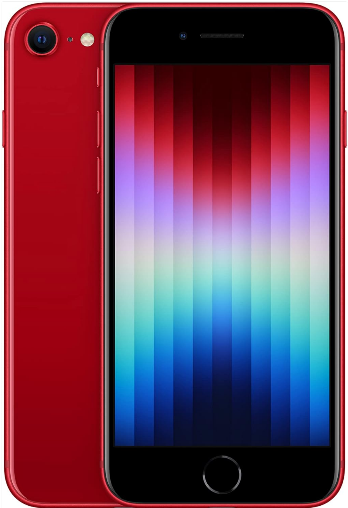
Figure 1: Front and back view of the Apple iPhone SE 3rd Generation in red. The front shows the display with app icons, and the back highlights the single camera and Apple logo.