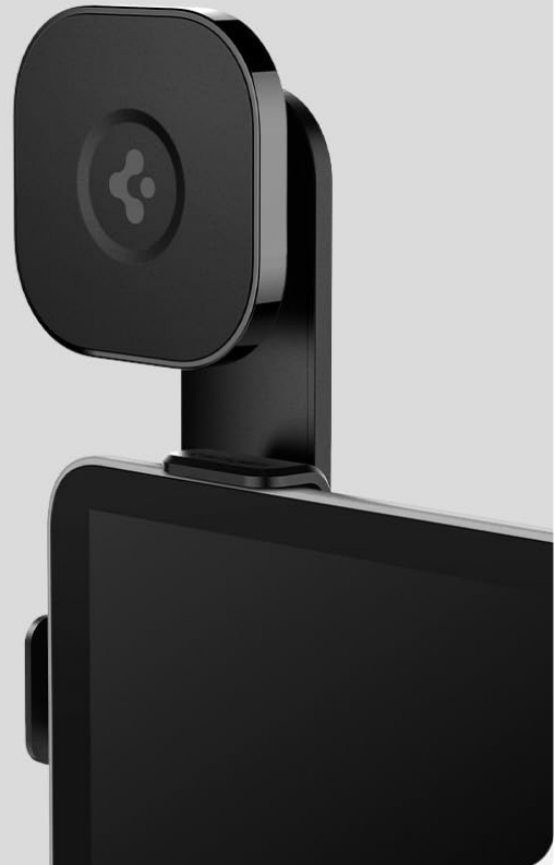
Figure 5: Magnetic attachment of an iPhone to the OneTap 3 mount.