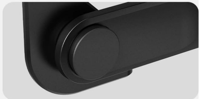
Figure 7: Detail of the adjustable arm mechanism and cable organizer.

Simple and easy locking system with just a tap.