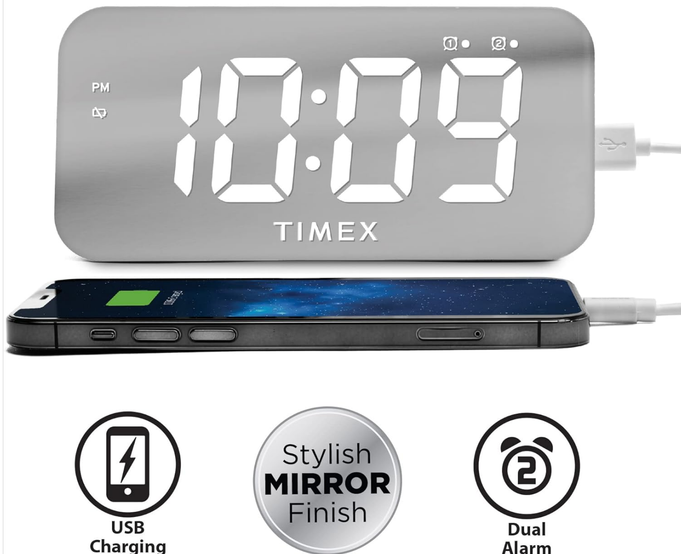
Figure 2: USB Charging Port in Use

This image shows the Timex T1320W alarm clock with a smartphone connected to its side-mounted USB-A charging port, demonstrating the 5W charging capability. The clock displays the time 10:09, and the phone screen indicates it is charging. This illustrates a primary feature of the alarm clock.