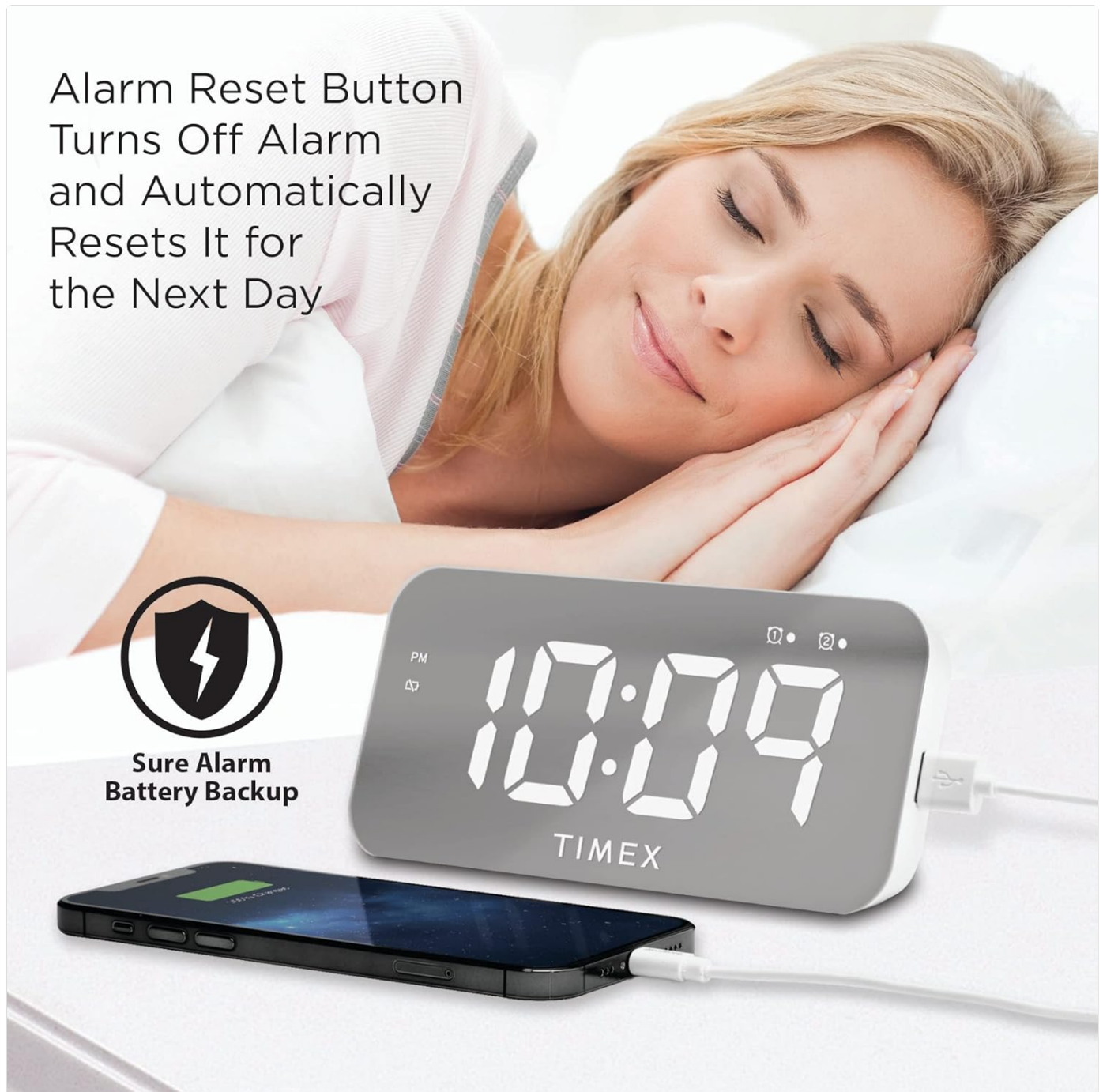
Figure 4: Alarm Reset Feature

The alarm reset button turns off the alarm and automatically resets it for the next day.