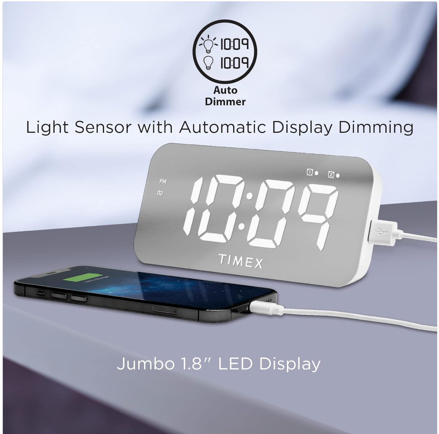
Figure 5: Auto Dimmer Function

Press the SNOOZE/DIMMER button repeatedly (when the alarm is not sounding) to cycle through different display brightness levels. The clock also features an automatic light sensor that adjusts display brightness based on room lighting conditions.