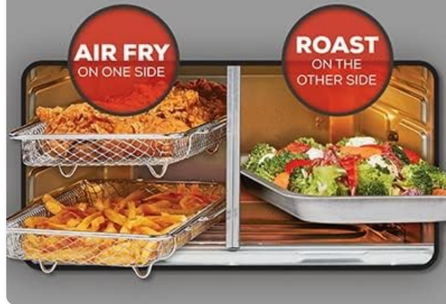
Image: A graphic illustrating the dual-zone capability, showing air-fried food on one side and roasted food on the other, with custom settings for each.