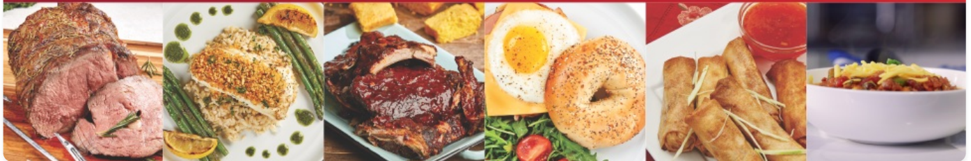
Image: A collage showcasing various dishes prepared using the 12-in-1 versatility of the oven, including air-fried chicken, baked goods, pizza, and roasted meats.