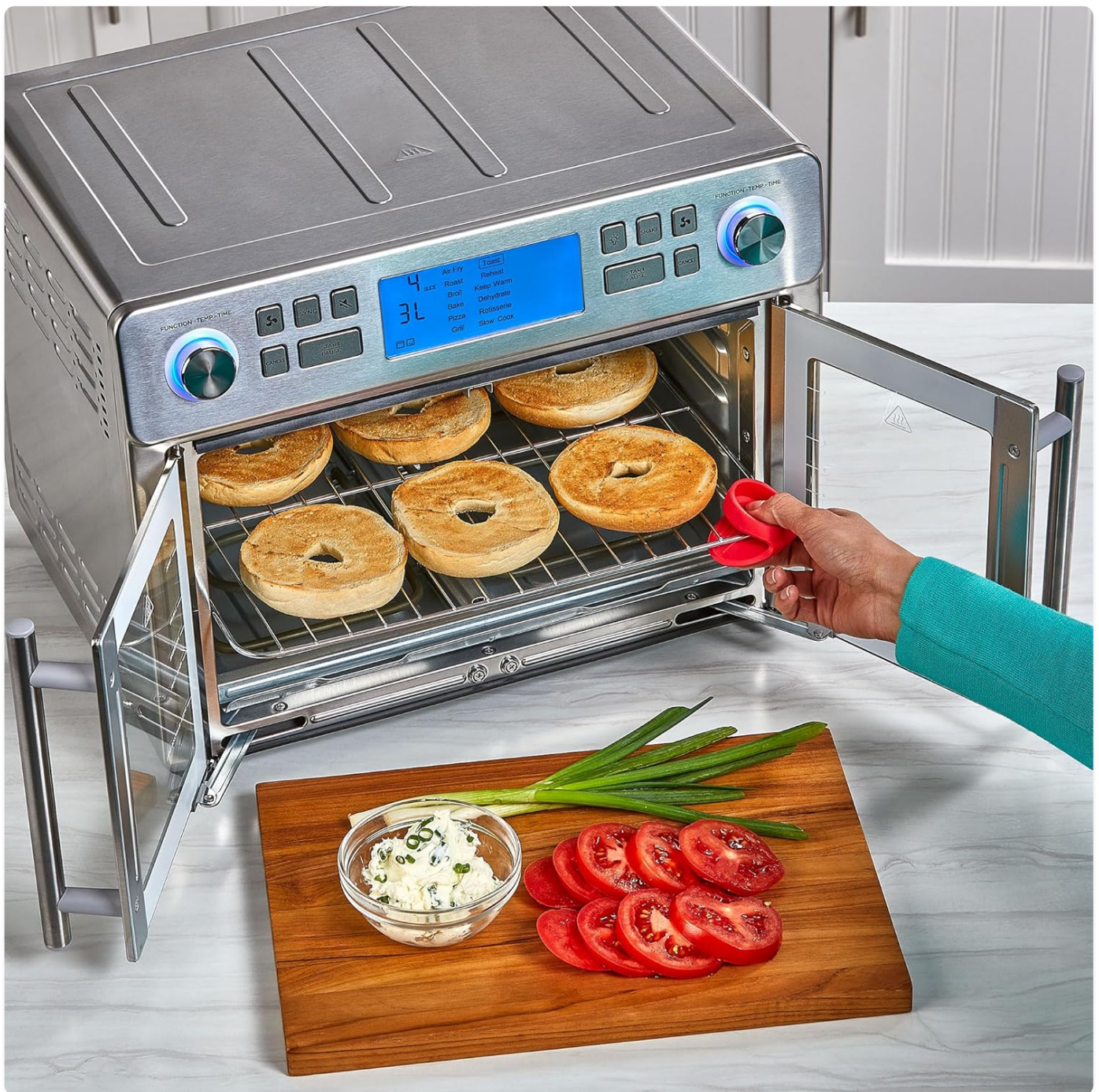
Image: Bagels being toasted on a rack inside the Emeril Lagasse Dual Zone 360 Air Fryer Oven, demonstrating the 'Toast' function.