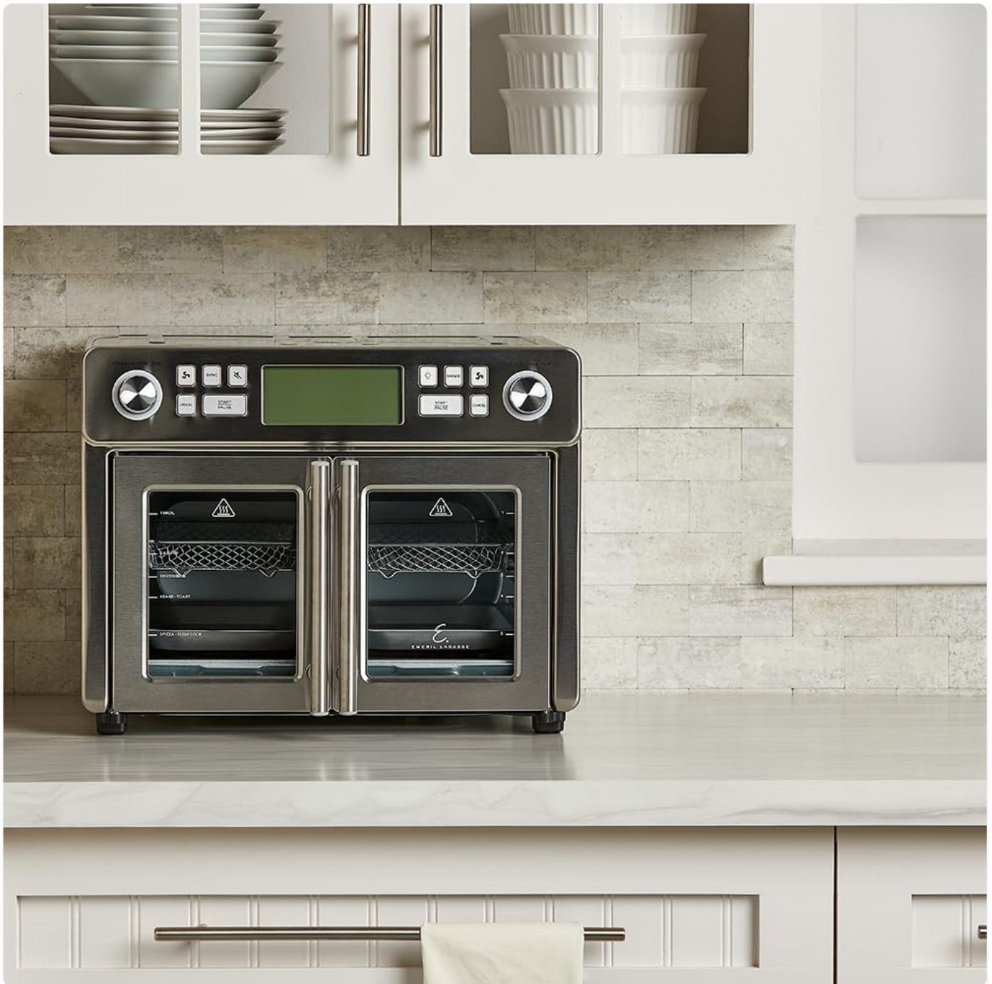
Image: The Emeril Lagasse Dual Zone 360 Air Fryer Oven positioned on a kitchen counter, demonstrating appropriate clearance.