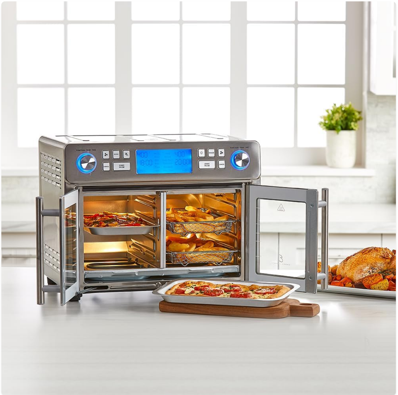
Image: The Emeril Lagasse Dual Zone 360 Air Fryer Oven with its French doors open, revealing the interior cooking compartments.