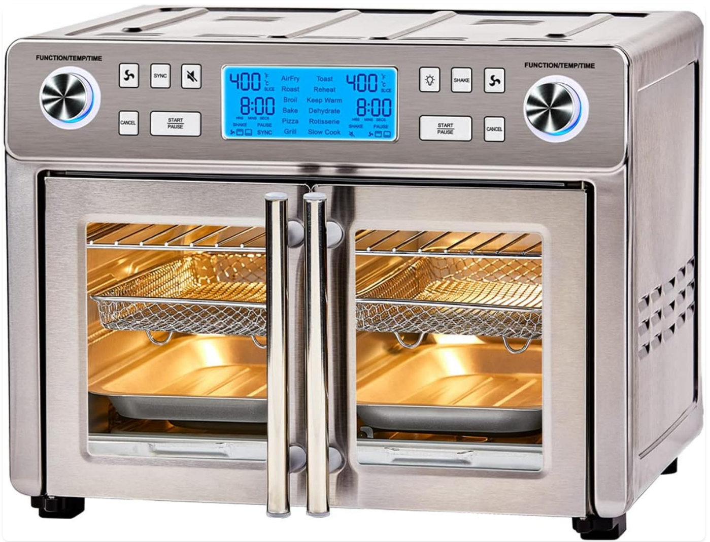
Image: The Emeril Lagasse Dual Zone 360 Air Fryer Oven with its French doors closed, showcasing its sleek stainless steel design.