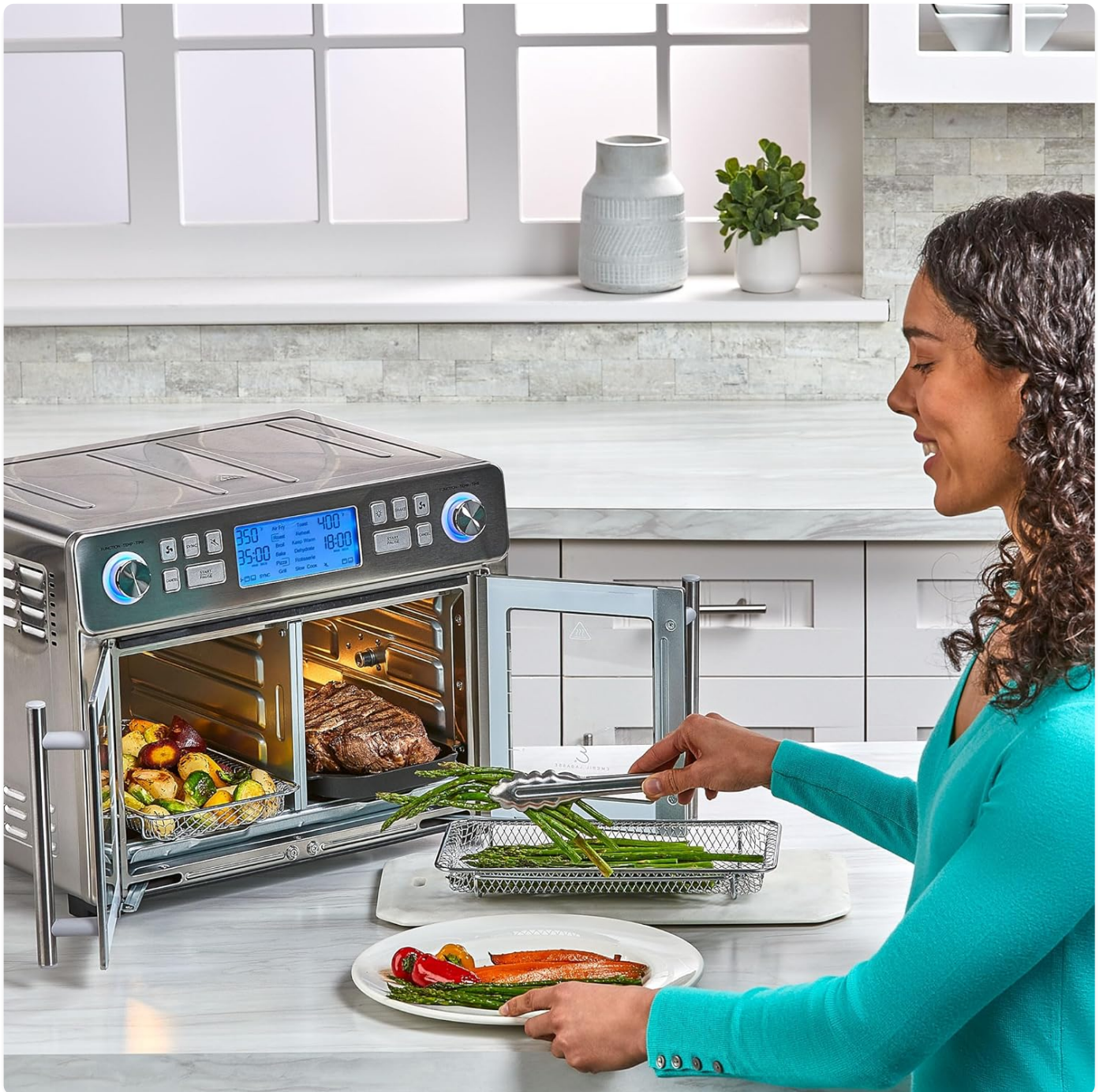
Image: A woman carefully placing a tray of food into one of the oven's compartments, demonstrating ease of use.