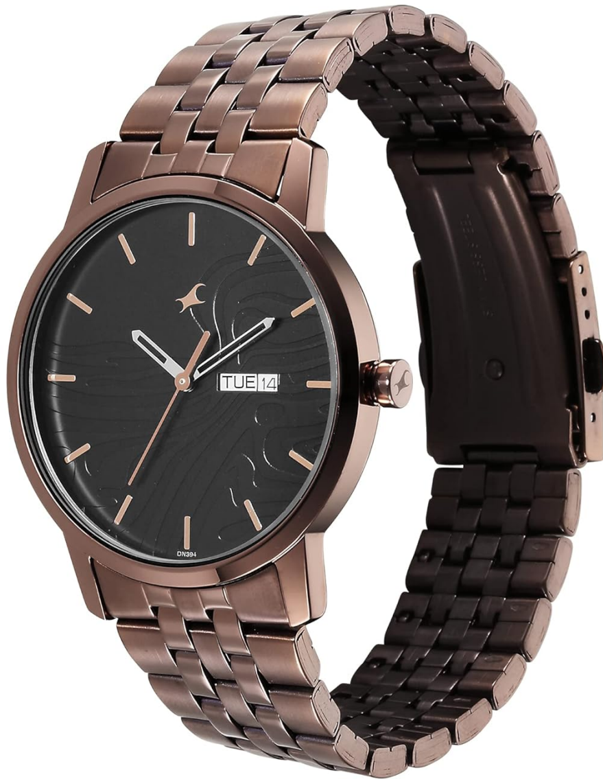
Image 2: Angled view of the watch, highlighting the strap and dial texture.