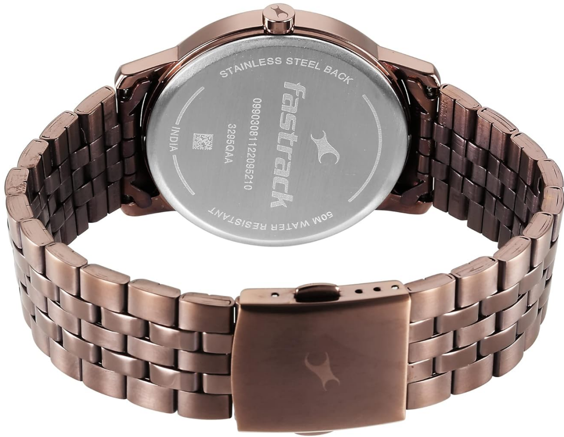
Image 3: Back view of the watch, showing the stainless steel case back and water resistance marking.