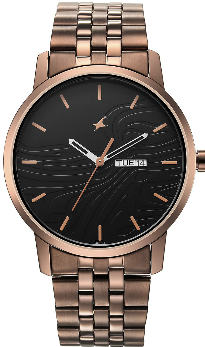
Image 1: Front view of the Fastrack Urban Camo Quartz Analog Watch with brown metal strap and black dial.