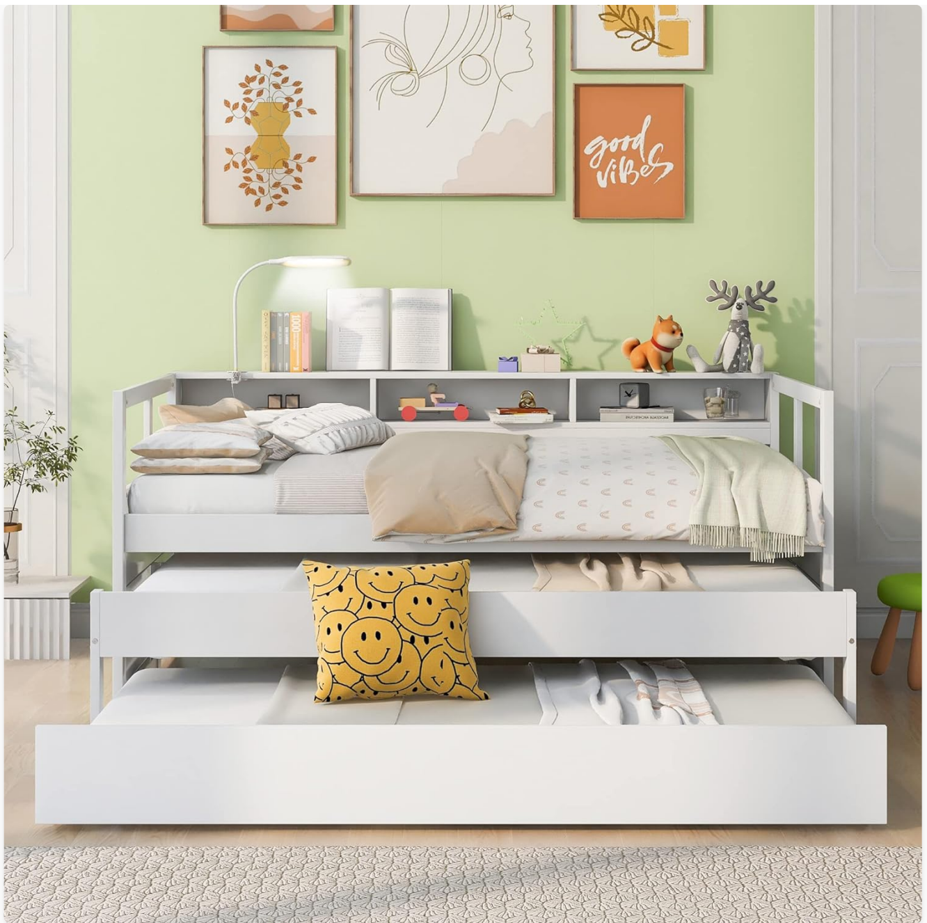
Image 1.1: The Polibi Twin XL Daybed with trundles extended, showcasing its multi-functional design in a bedroom environment.