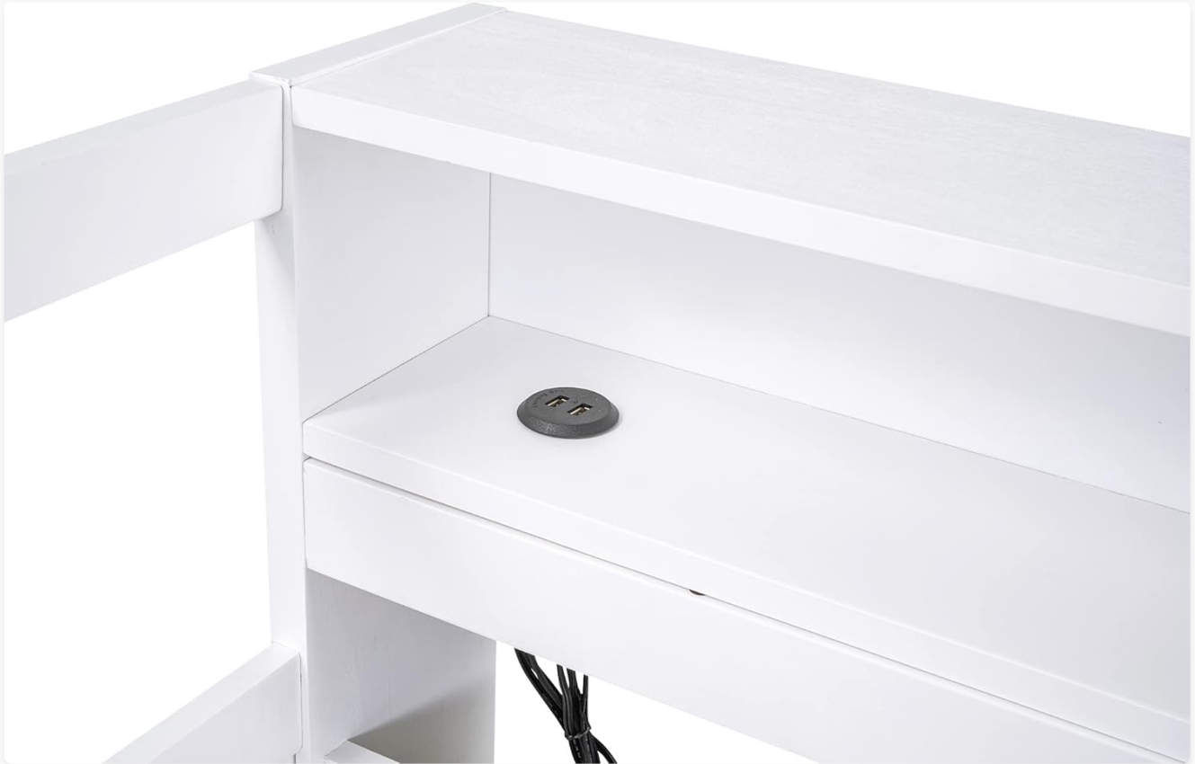
Image 5.3: A close-up view of the USB charging port, conveniently located within the storage cubby for easy access.