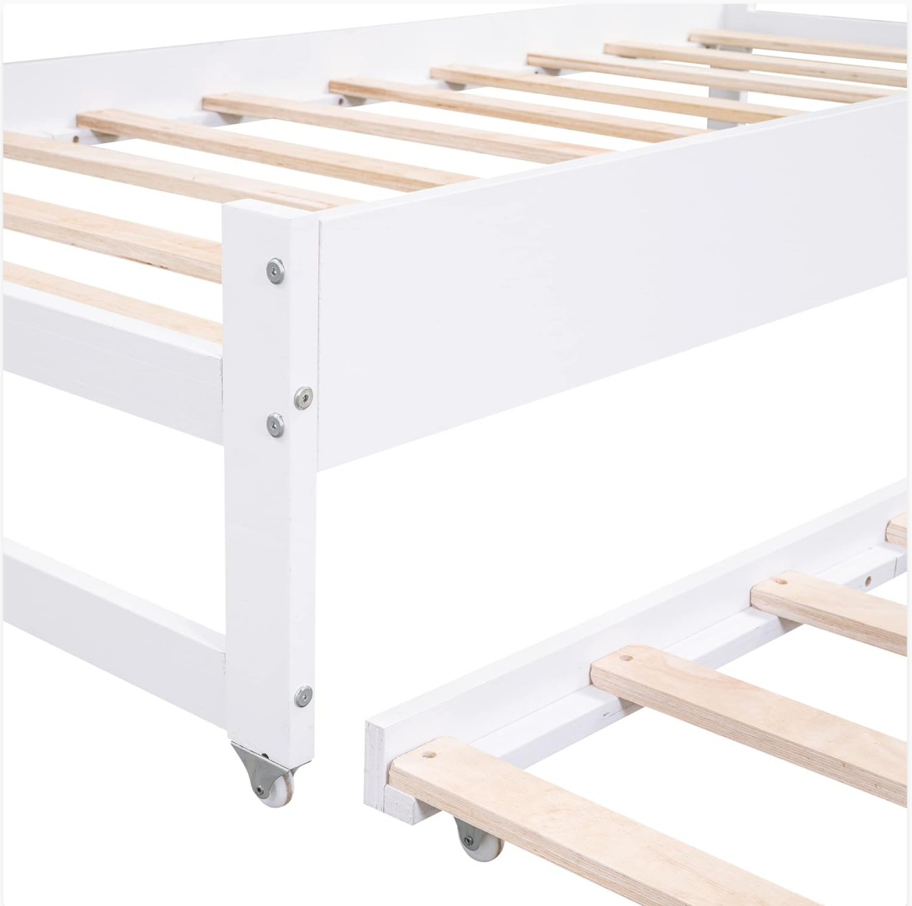
Image 5.2: Detail of the trundle wheels, designed for easy and smooth extension and retraction.