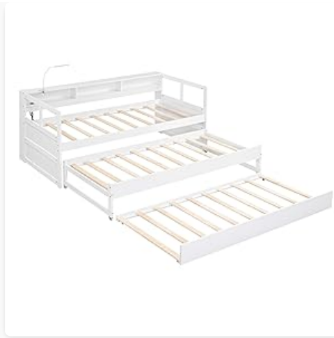
Image 5.1: The daybed with both trundles extended, demonstrating the additional sleeping capacity.