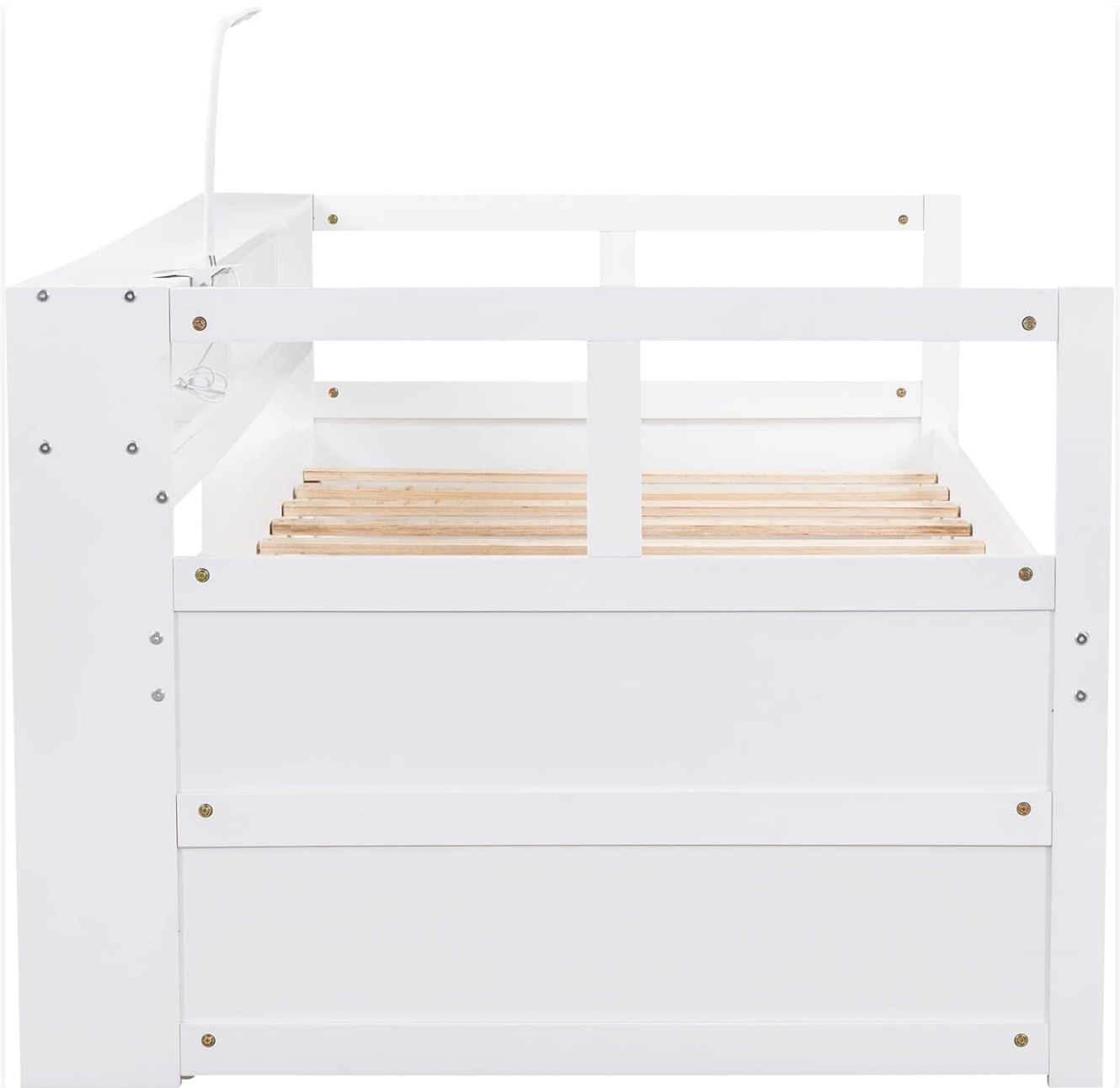
Image 4.2: Side view of the daybed frame, illustrating the structural connections and assembly points for the main frame and trundles.