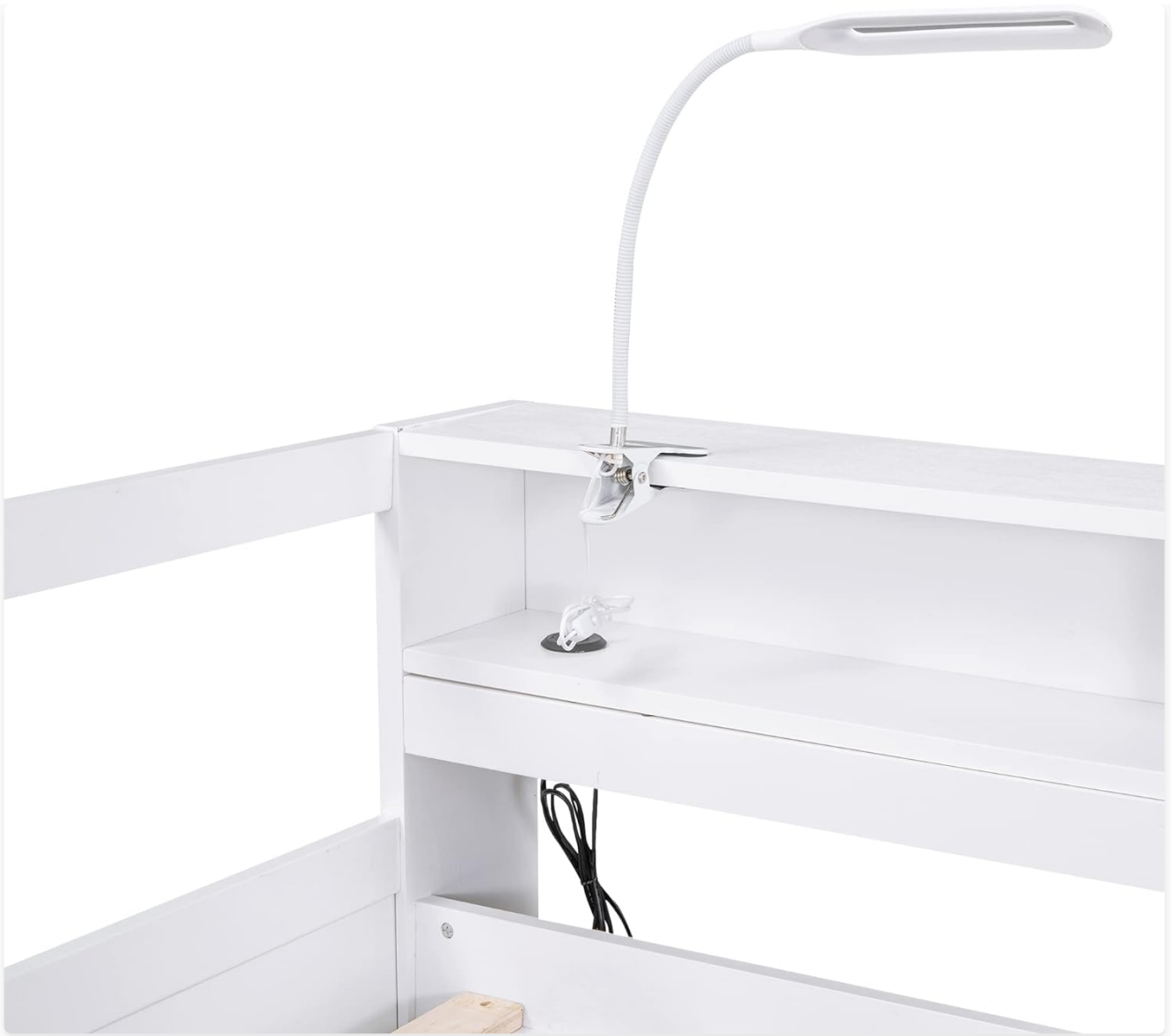
Image 5.4: A close-up of the portable LED light, showing its flexible arm and clip mechanism for attachment to the daybed's frame or cubby.