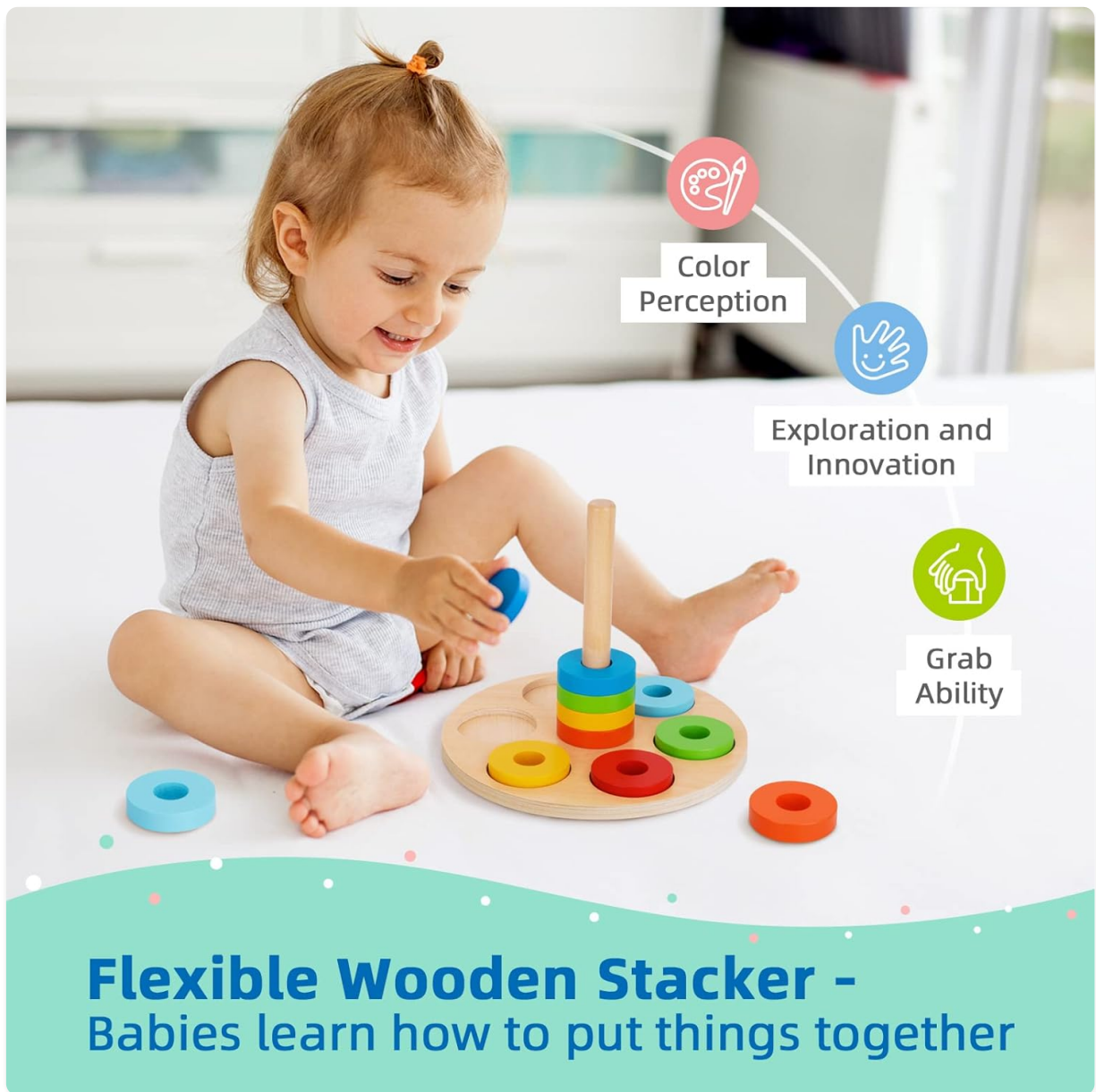
Figure 5: The flexible wooden stacker helps develop color recognition and fine motor skills.