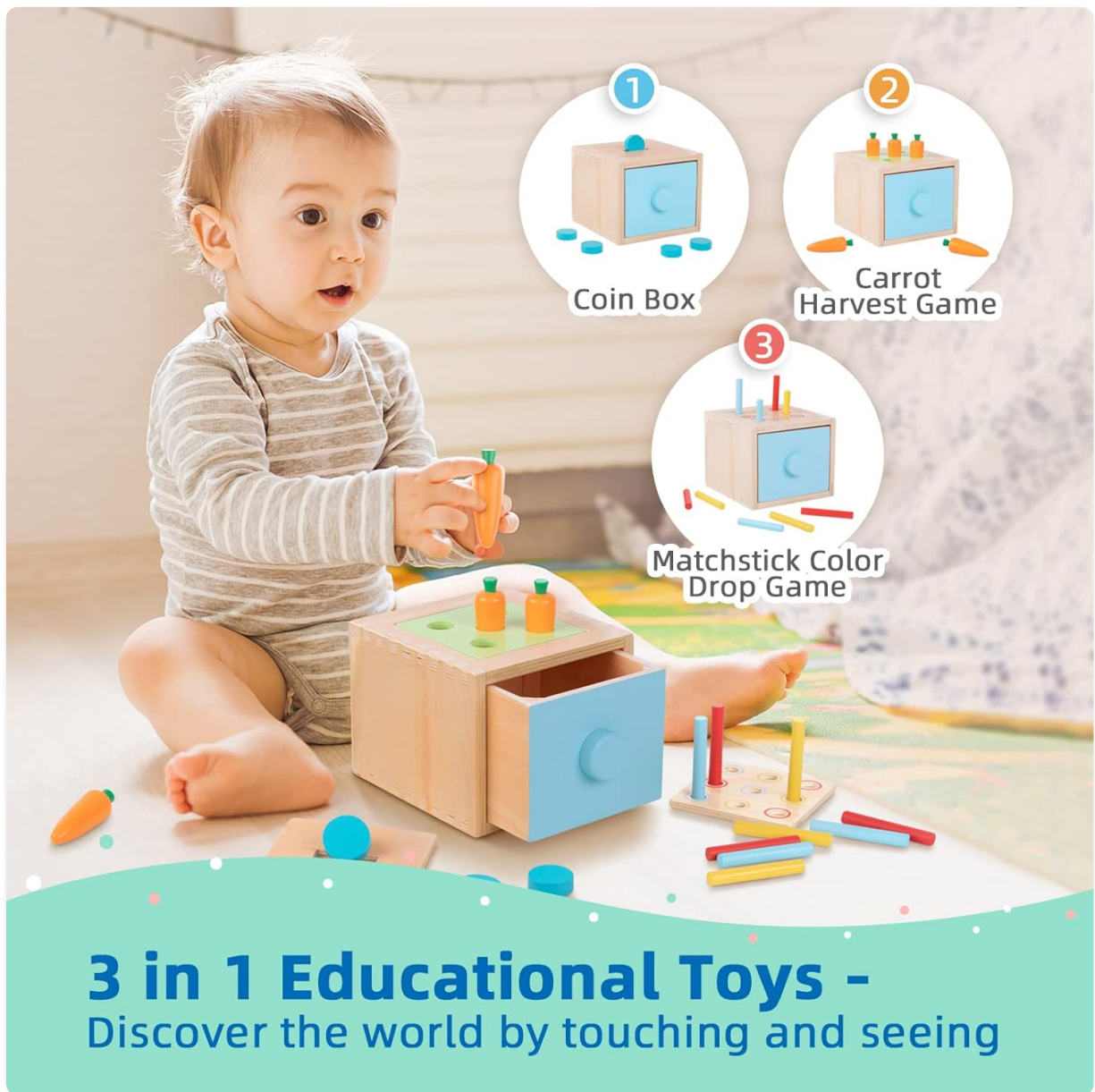
Figure 3: Demonstrating the versatility of the 3-in-1 educational box.