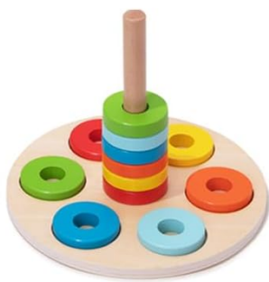
Flexible Wooden Stacker