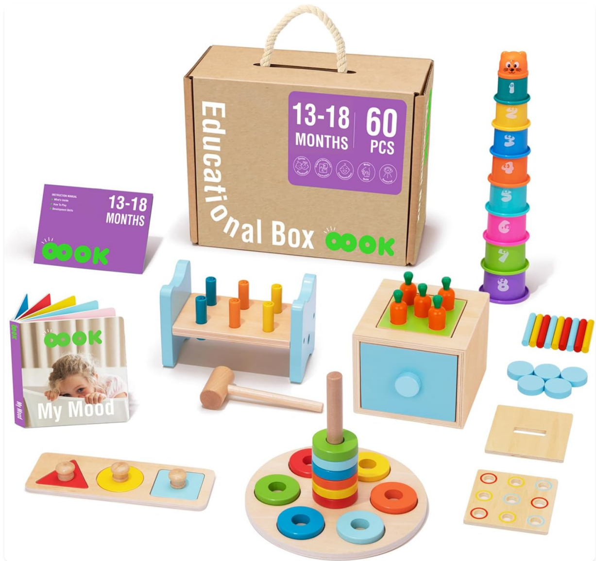
Figure 1: Overview of the TOOKYLAND Montessori 8-in-1 Educational Toy Set components.