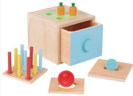
3 in 1 Educational Toys