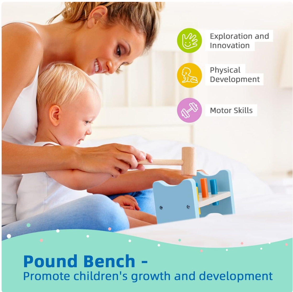
Figure 6: The pound bench assists in developing motor skills and coordination.