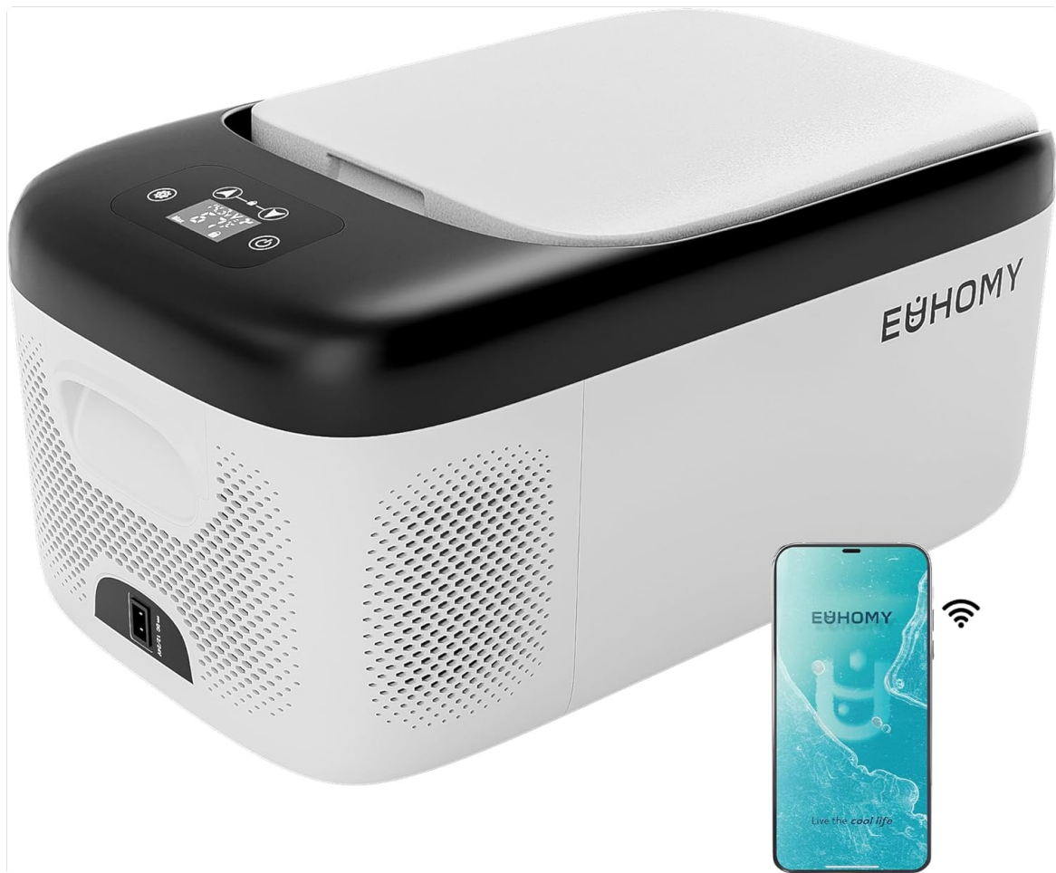
Image: The portable refrigerator can be controlled via a smartphone application.