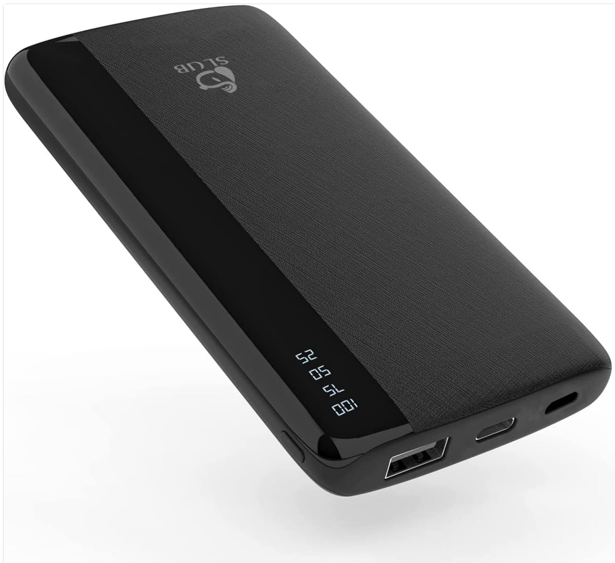
Figure 1.1: The SLuB 12000mAh Portable Charger.