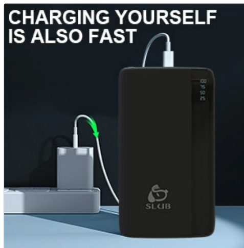
Figure 4.1: Charging the SLuB Portable Charger.