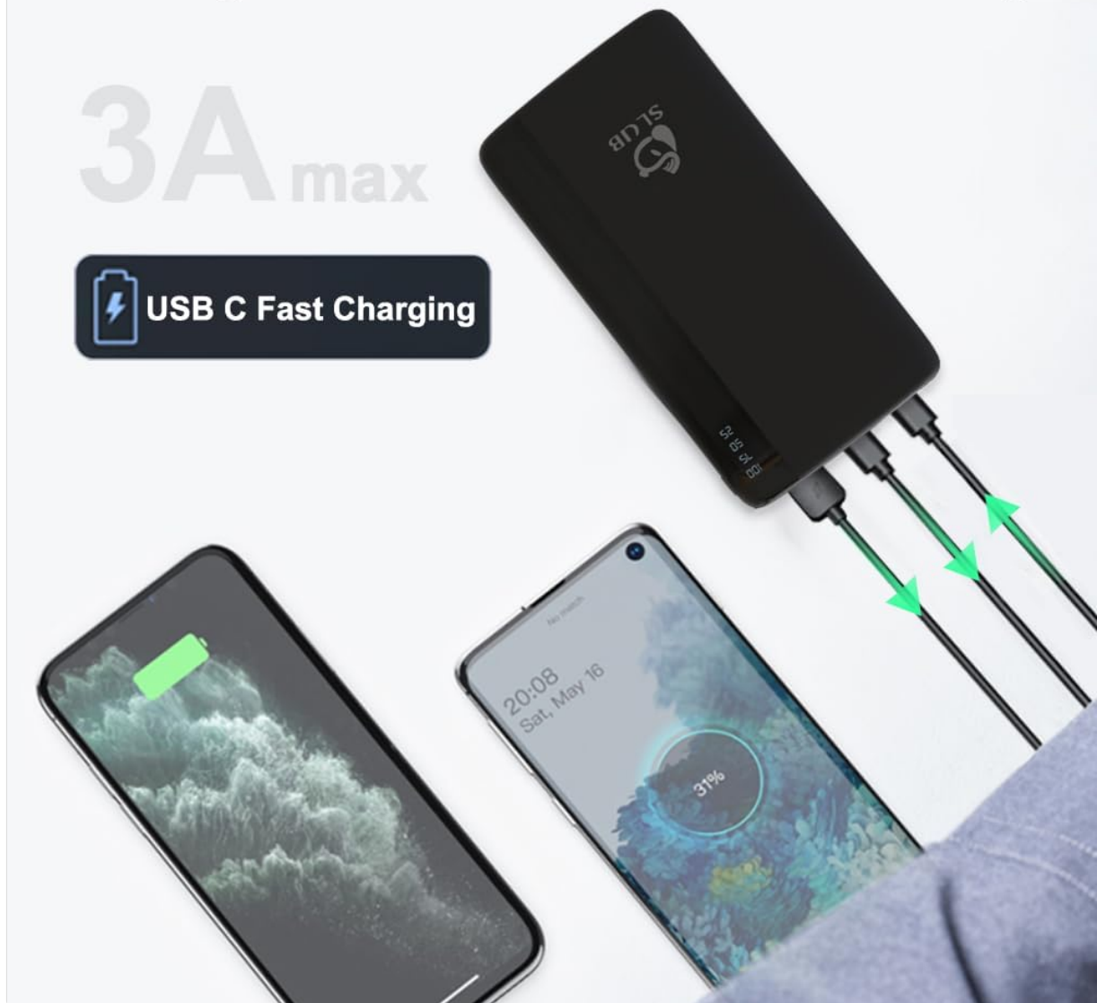
Figure 5.1: Charging two devices simultaneously.