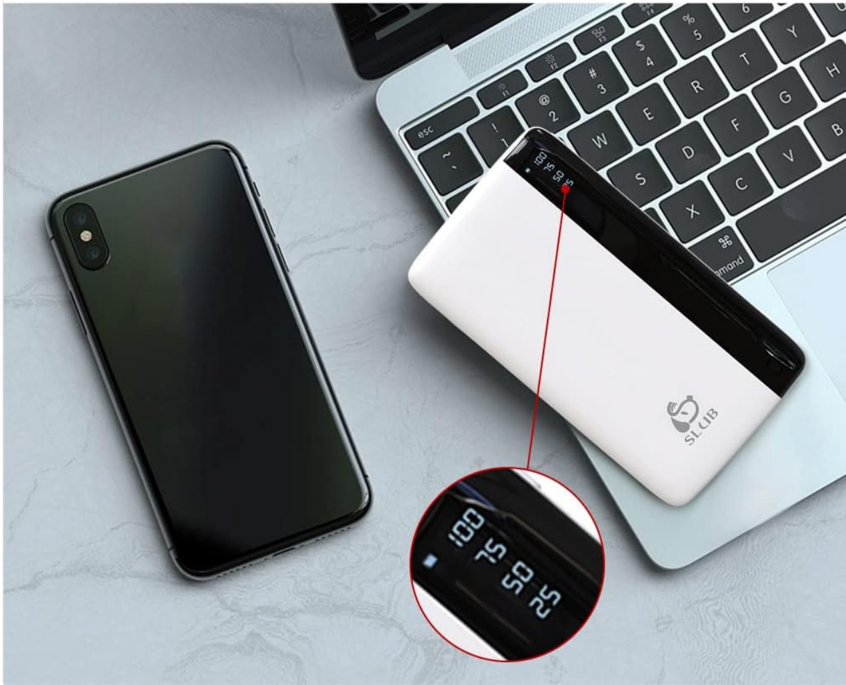
Figure 5.3: LCD Power Display indicating remaining charge.