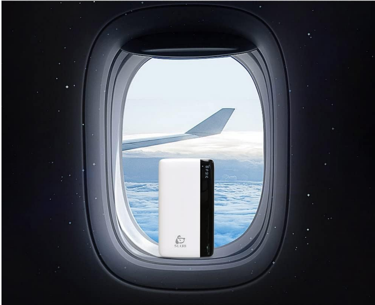
Figure 9.1: Aviation Compliance for safe travel.