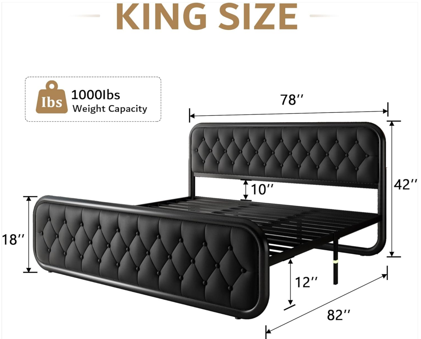
Image 8.1: Diagram illustrating the key dimensions of the King size bed frame, including length, width, height, and under-bed clearance.