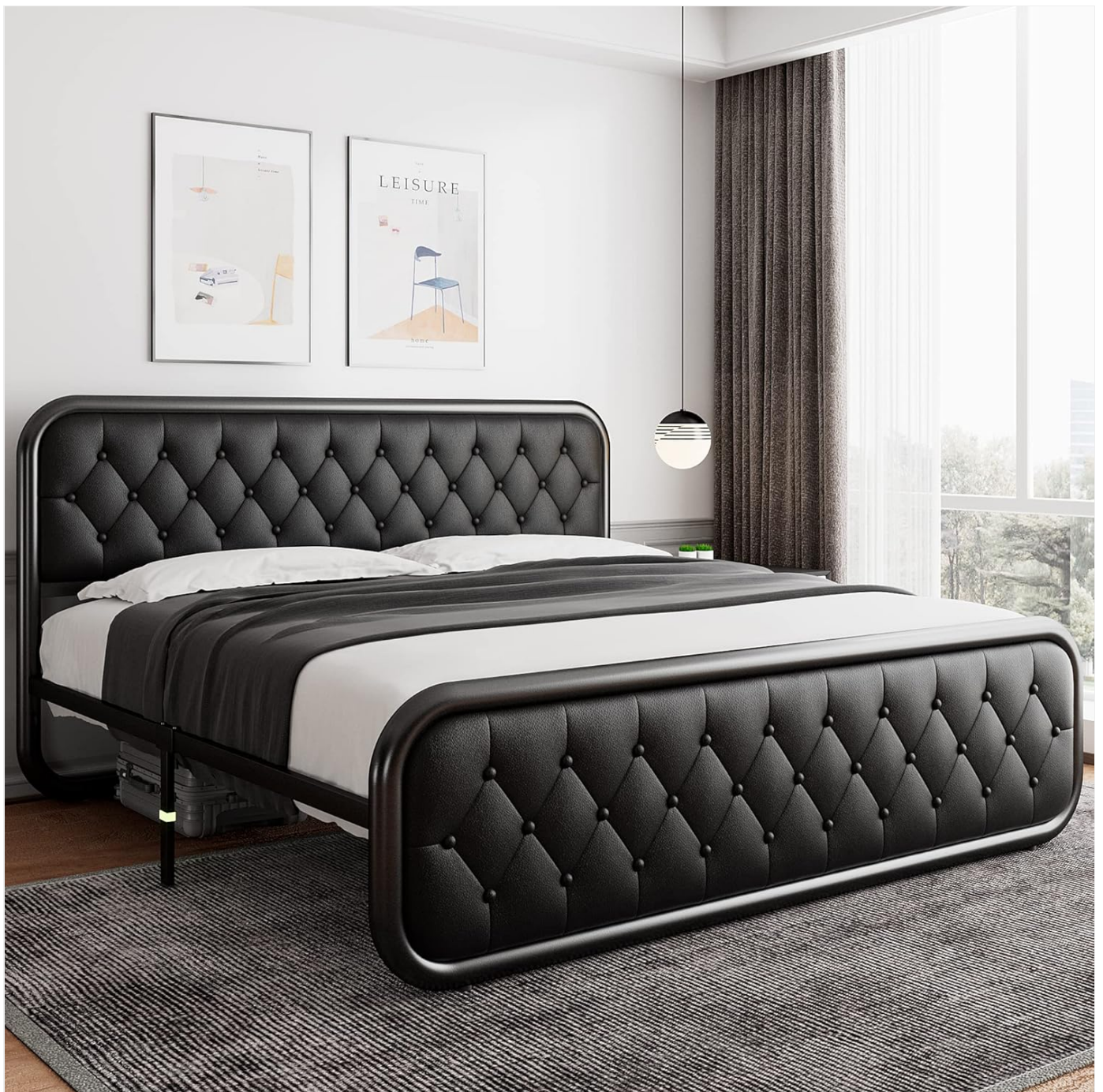
Image 1.1: Fully assembled iPormis King Size Metal Bed Frame with black faux leather headboard and footboard, showcasing its modern design in a bedroom setting.