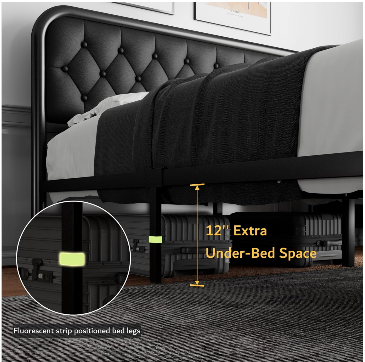
Image 5.1: View of the bed frame highlighting the 12-inch under-bed storage clearance and the fluorescent strips on the bed legs for visibility.