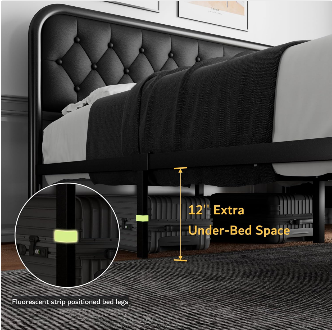
Figure 5.1: Illustration of the 12-inch under-bed storage space and the fluorescent strips on the bed legs for safety.