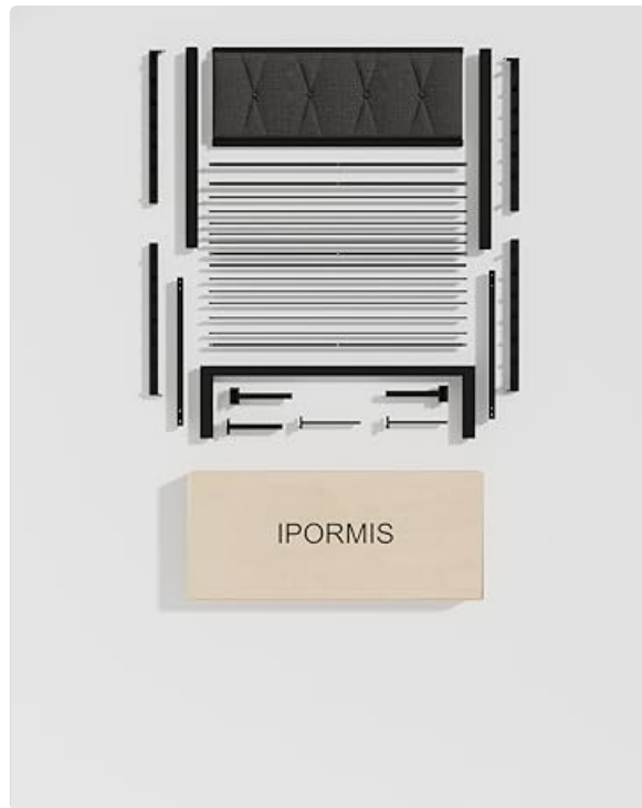
Figure 3.1: Exploded view of bed frame components and hardware.