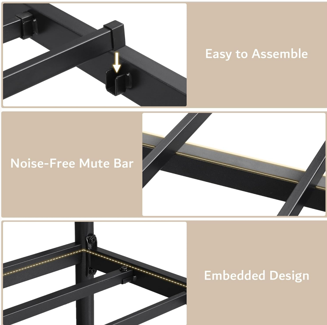
Figure 4.1: Details of easy assembly, noise-free mute bar, and embedded design for secure slat placement.