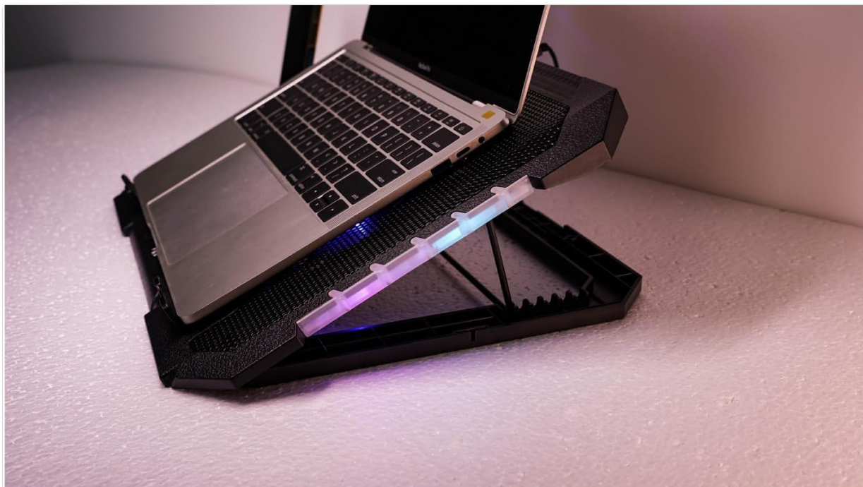
Image: Laptop positioned on the cooling pad, demonstrating the adjustable height feature and active RGB sidelights.