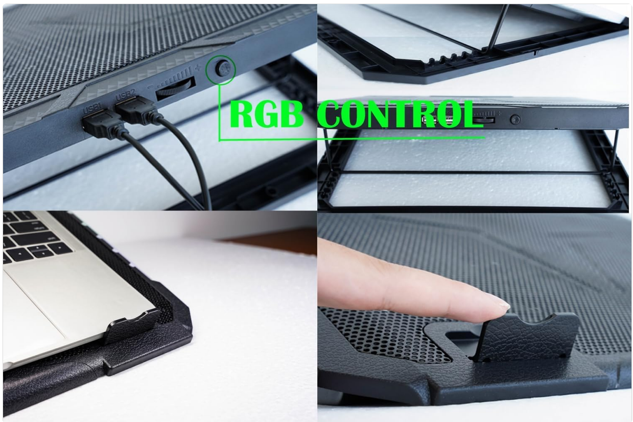
Image: Detailed view of the cooling pad's side panel, highlighting the USB ports, fan speed control dial, and RGB lighting button.