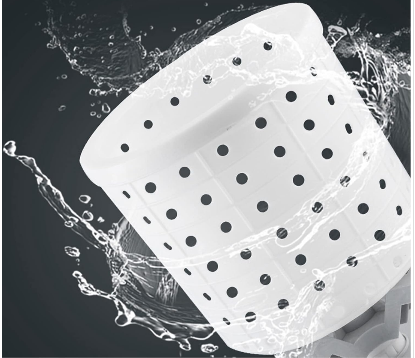
Figure 6.2: Visual representation of the fast dehydration process, showing water being efficiently removed from the clothes within the spinning basket.