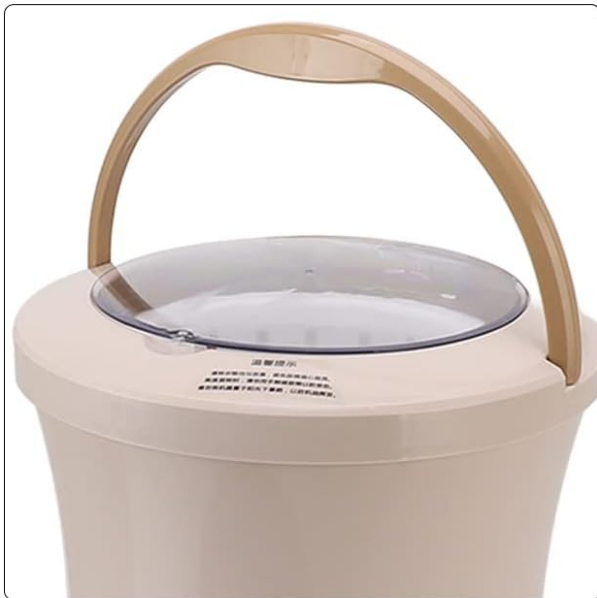
Hidden design Portable handle