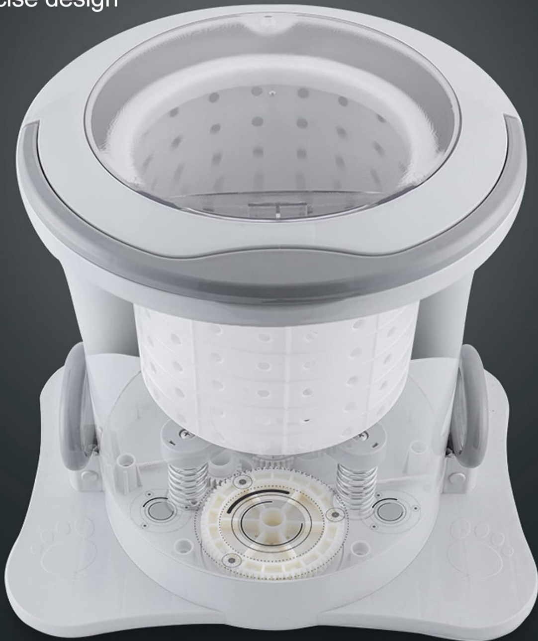
Figure 4.2: Internal view of the dryer, showcasing the precise design of the spin mechanism and the removable basket.