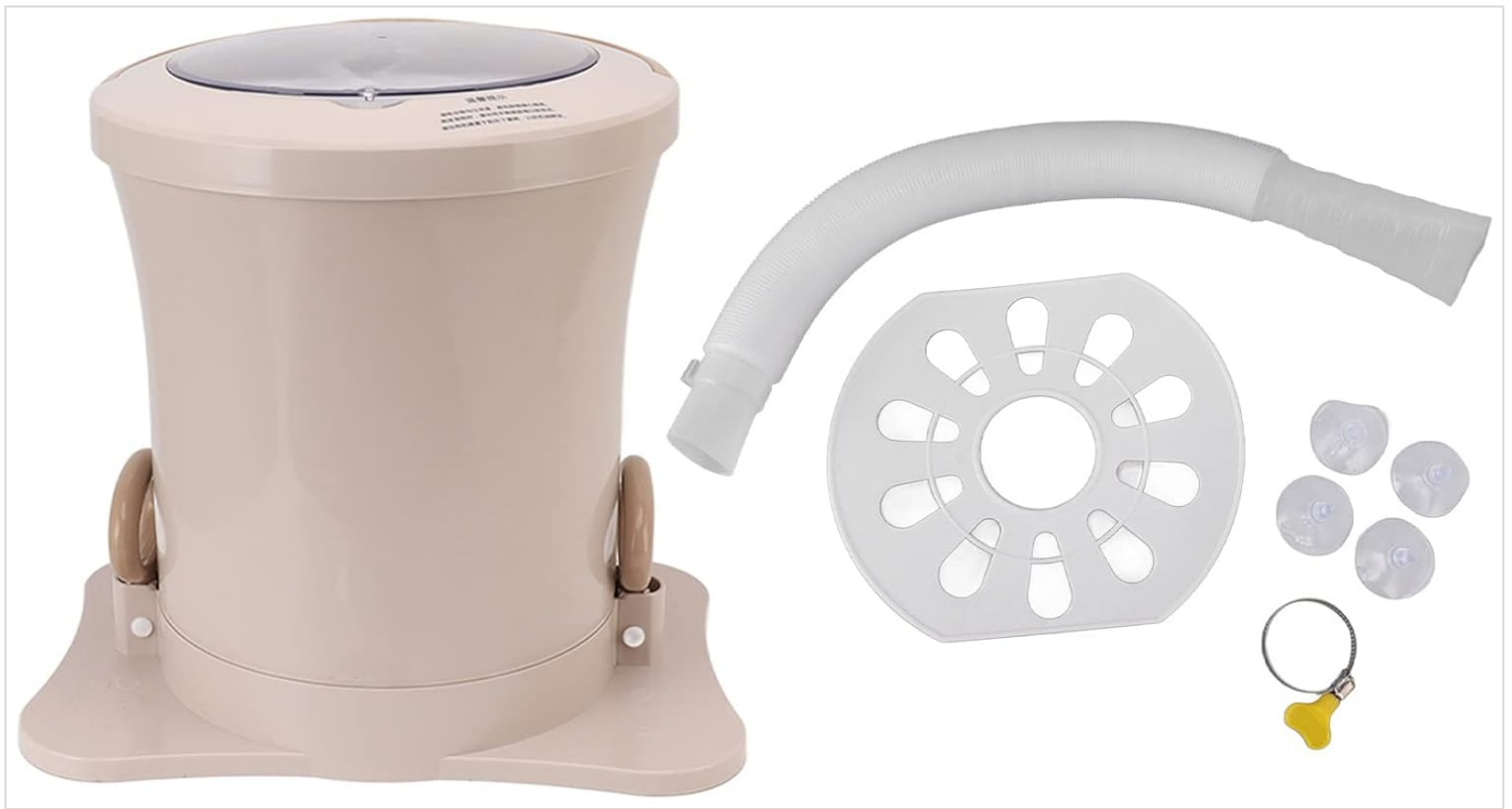
Figure 3.1: The Pyhodi Portable Manual Clothes Dryer shown with its included accessories, including the drain pipe, suction cup feet, and the removable basket.