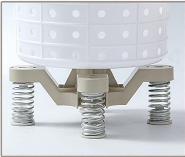
Strong support structure at the bottom