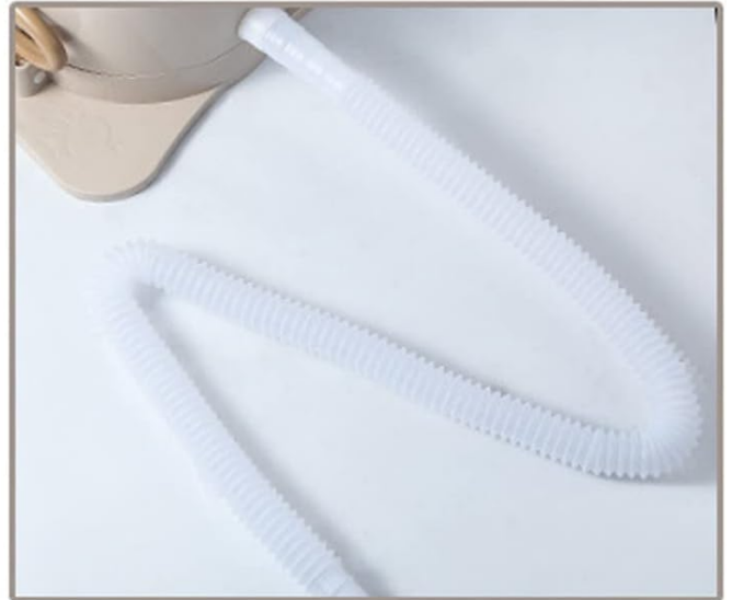
150cm telescopic drain pipe