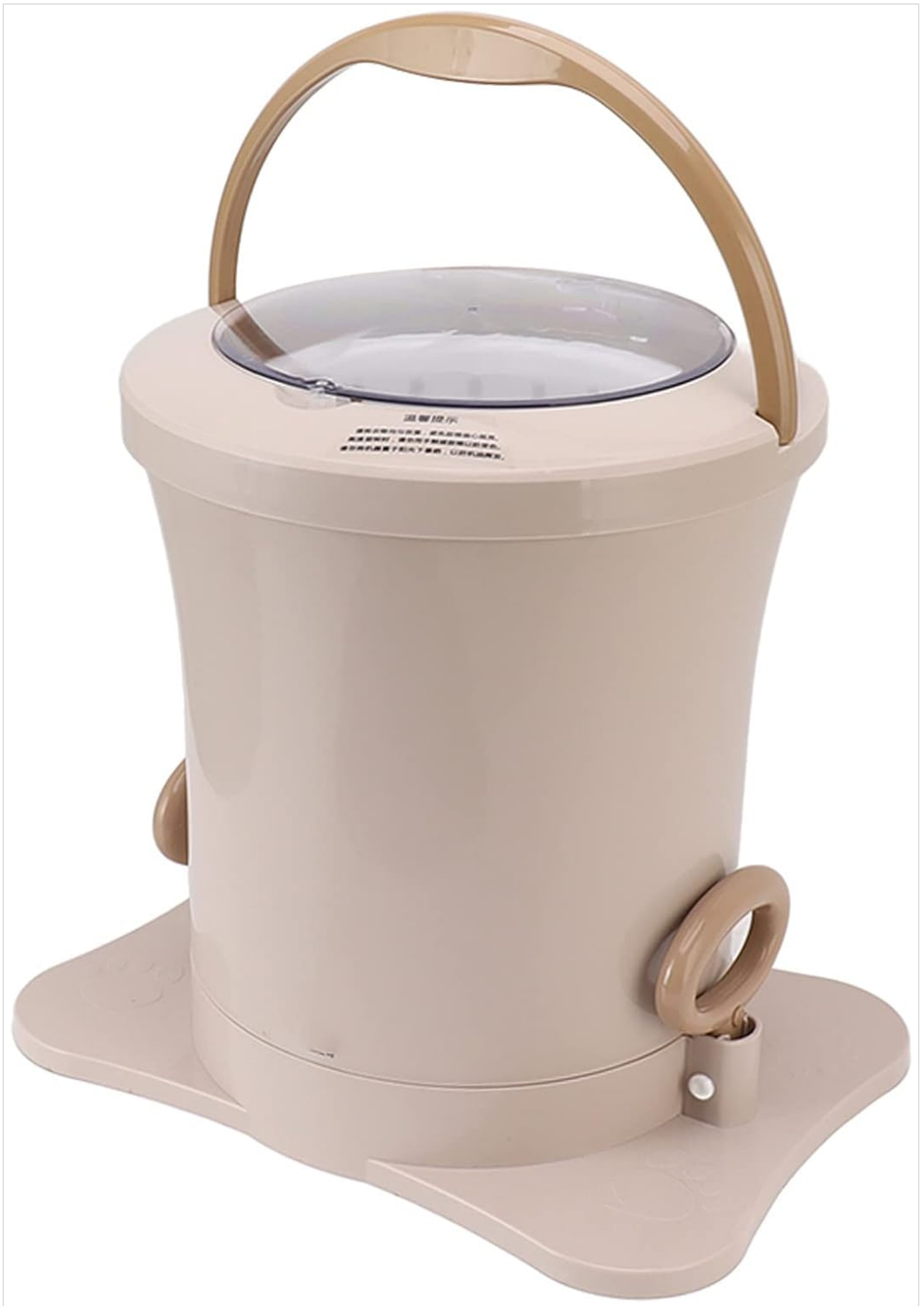
Figure 4.1: Front view of the Pyhodi Portable Manual Clothes Dryer, highlighting its compact and portable design.