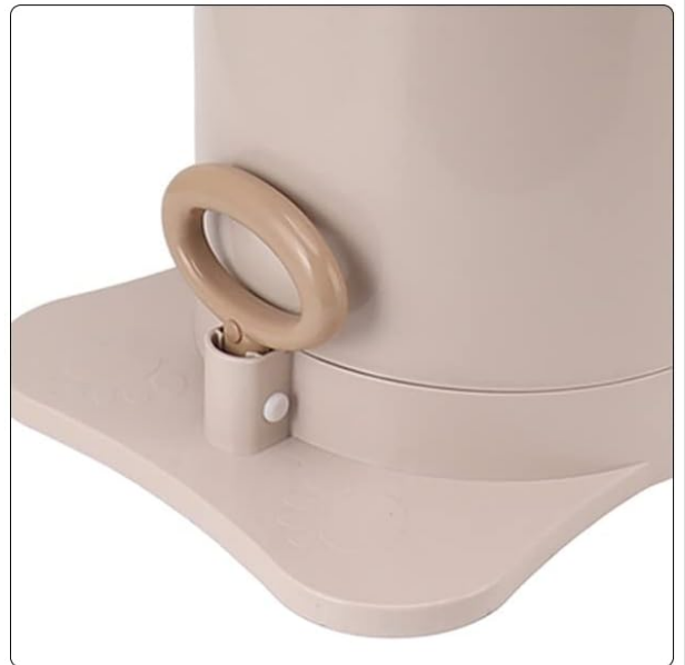
Wide comfortable bottom pedal