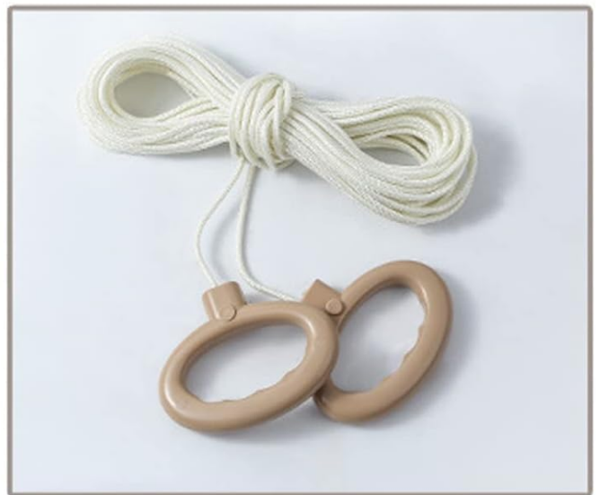
Selected high quality nylon drawstring