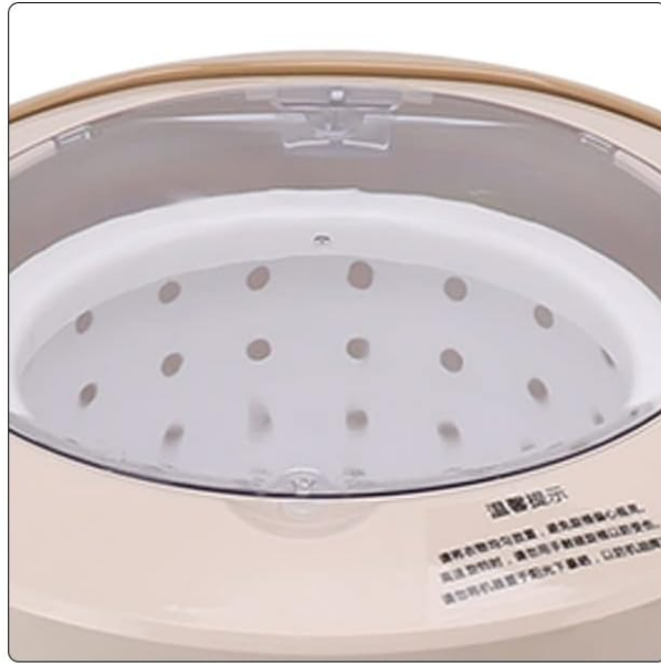
Safe and dustproof transparent top cover