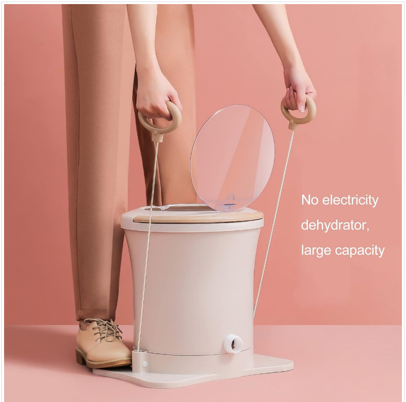
Figure 6.1: A user demonstrating the operation of the non-electric dehydrator, highlighting its large capacity and ease of use with the pull cords.