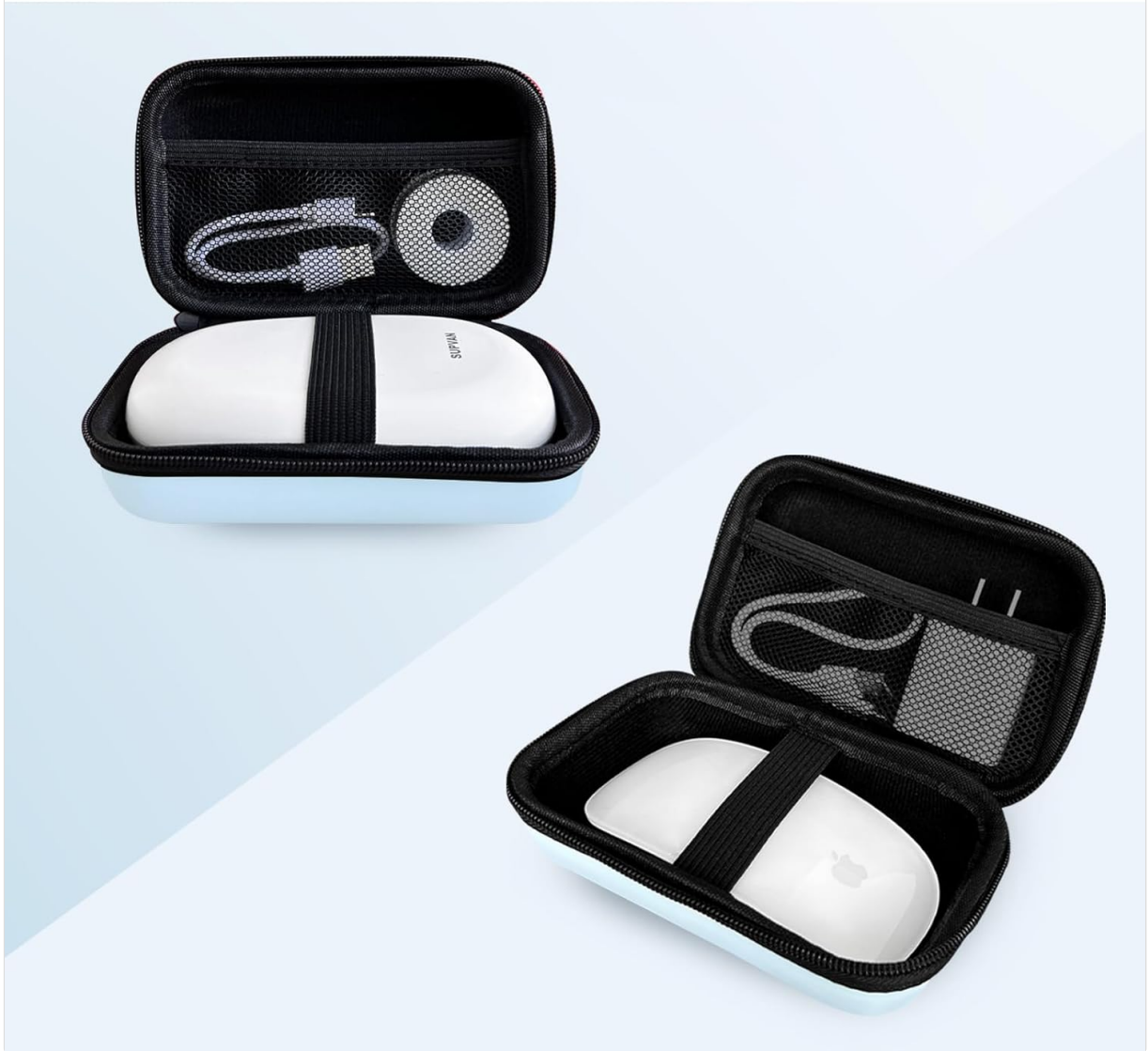
Image demonstrating the SUPVAN E10 label maker and its accessories (USB cable, label roll) neatly stored inside the carrying case.