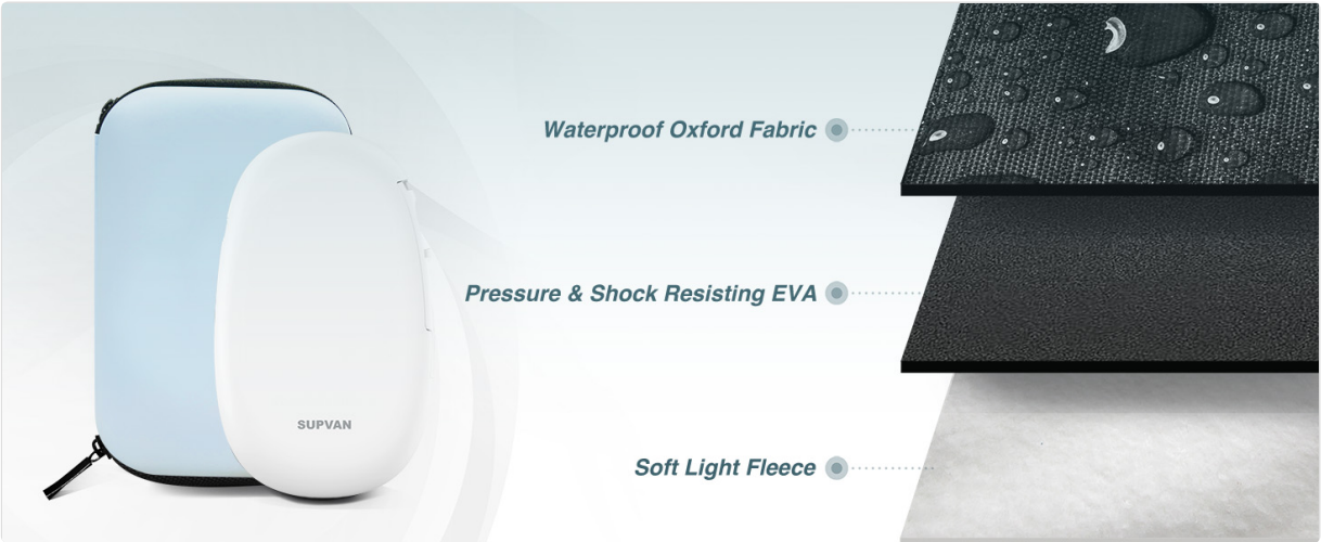
Image illustrating the three-layer construction of the carrying case: Waterproof Oxford Fabric exterior, Pressure & Shock Resisting EVA mid-layer, and Soft Light Fleece interior.