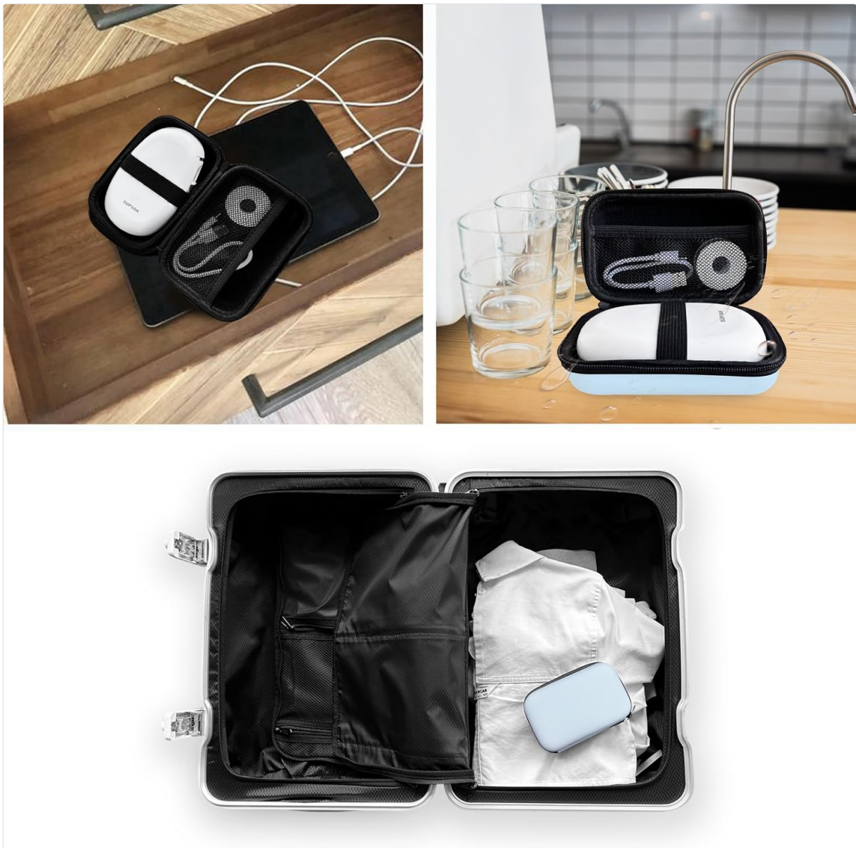
Collage of images showing the carrying case in various usage scenarios: charging the label maker while in the case, storing it on a kitchen counter, and packed inside a suitcase.