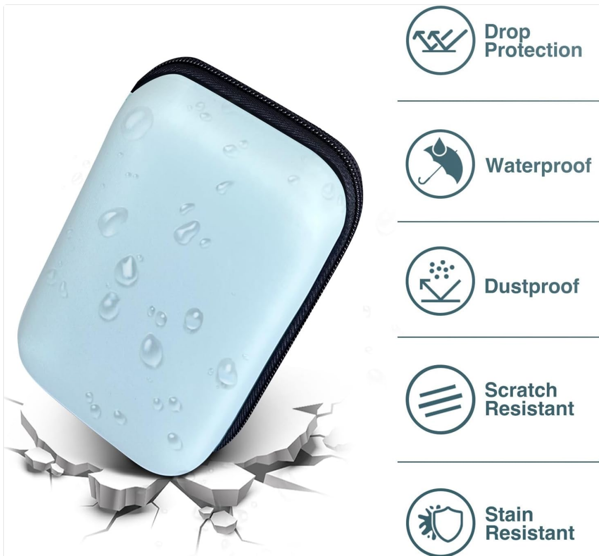
Image illustrating the protective features of the carrying case, including drop protection, waterproof, dustproof, scratch-resistant, and stain-resistant properties.