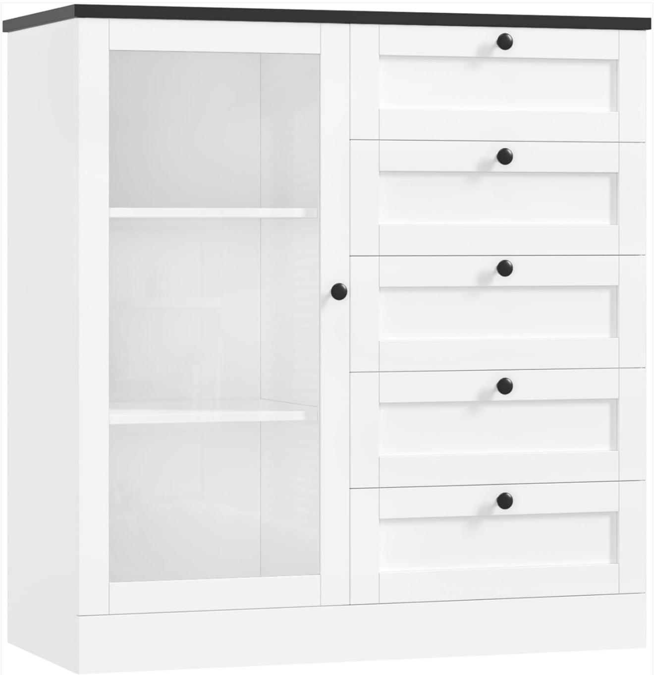
Image: The HOSTACK 5 Drawer Dresser with Door in White/Black finish, showcasing its five drawers and glass-front cabinet.