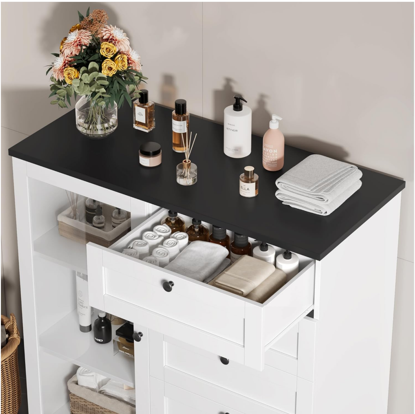
Image: A close-up view of the dresser, highlighting an open drawer filled with neatly folded items and the top surface adorned with various decorative objects.