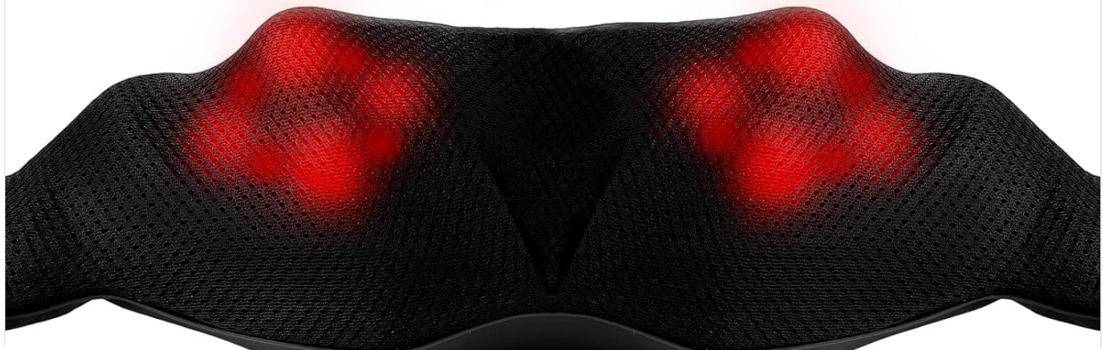
Image: Illustration of the advanced heating function, demonstrating muscle relaxation and warmth after use, along with 15-minute auto-off and overheating protection.