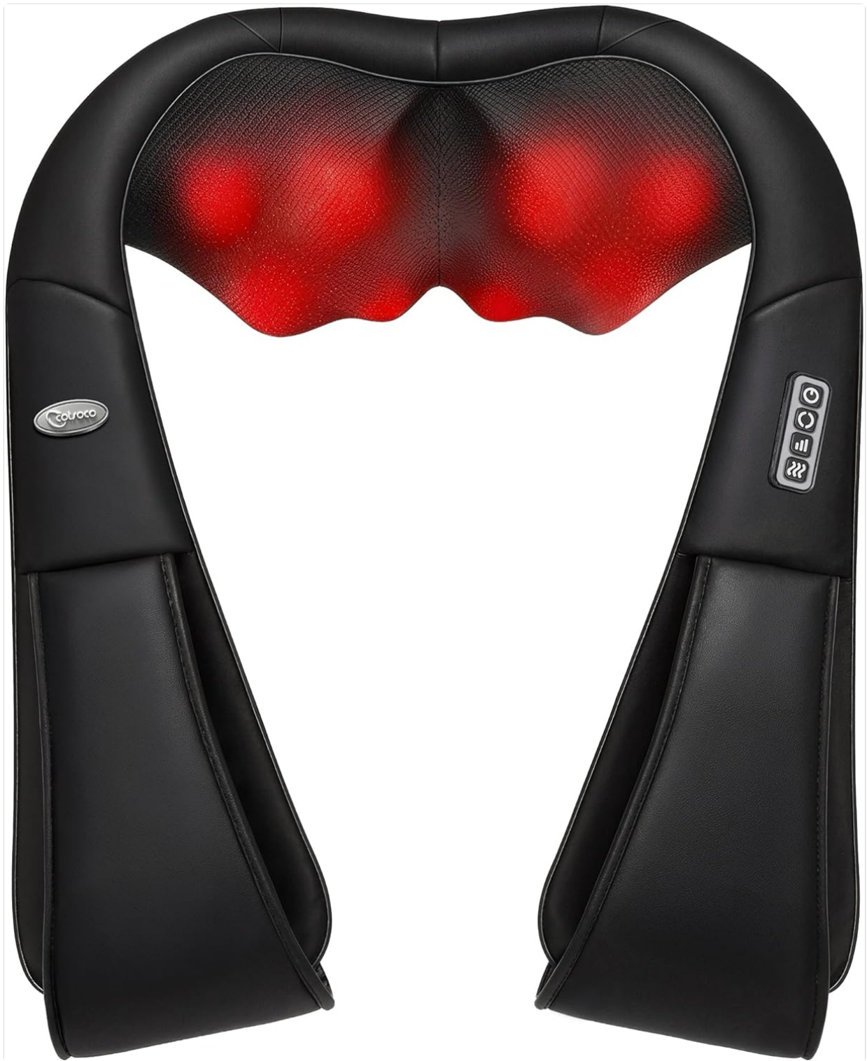
Image: Visual representation of the 16 deep kneading massage nodes, optional heating, overheat protection, 15-minute auto shut-off, and bi-directional massage.