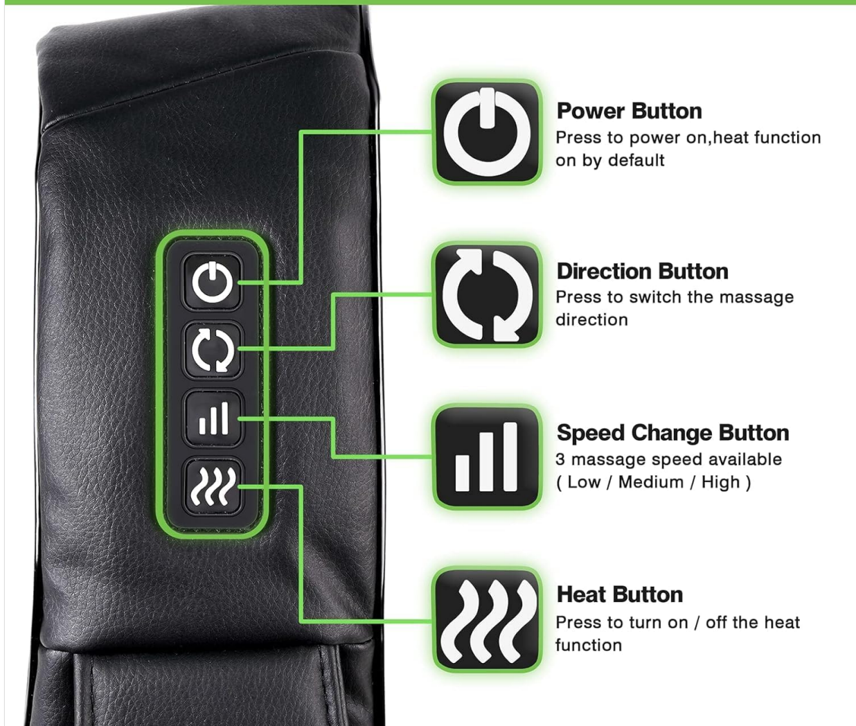
Image: Close-up of the control panel, detailing the functions of the Power, Direction, Speed, and Heat buttons.

3 intensities and 2 massage directions to choose