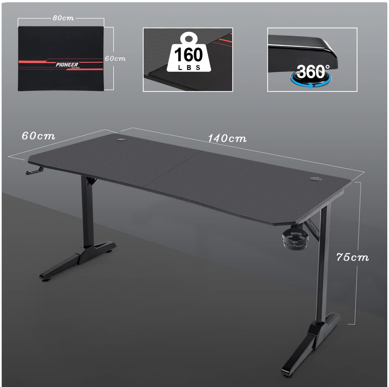
Image: Detailed dimensions of the Devoko Gaming Desk, showing length, width, and height.