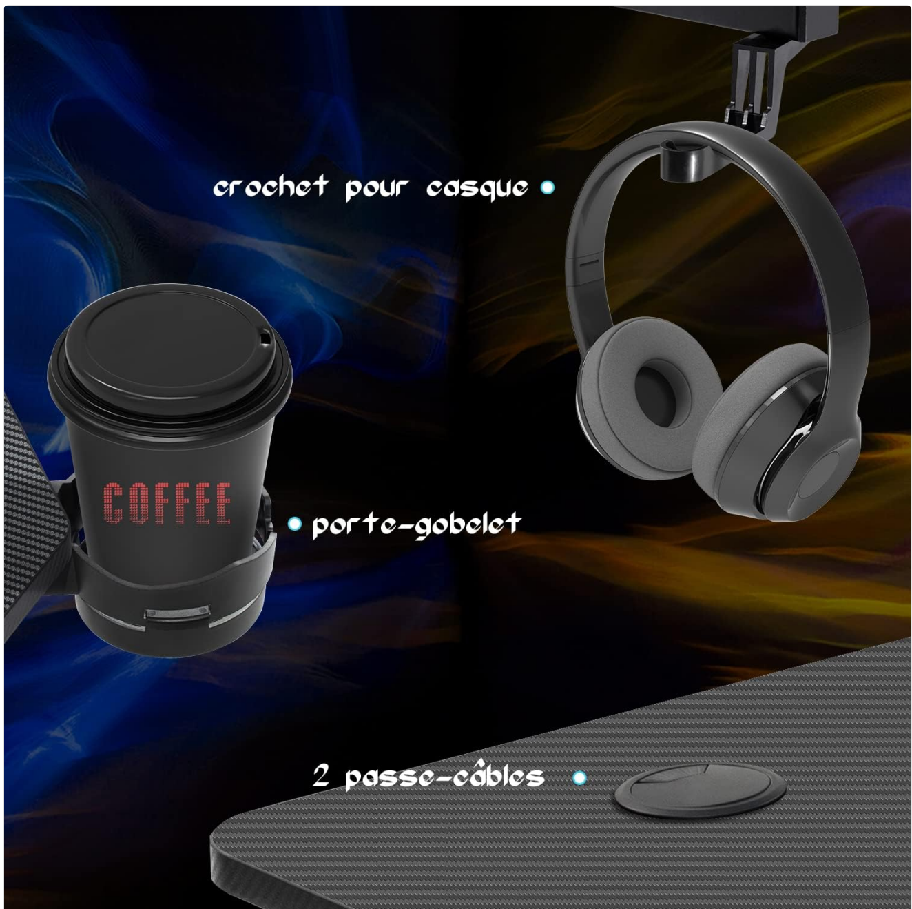
Image: Close-up view of the integrated headphone hook, cup holder, and cable management grommets on the Devoko Gaming Desk.