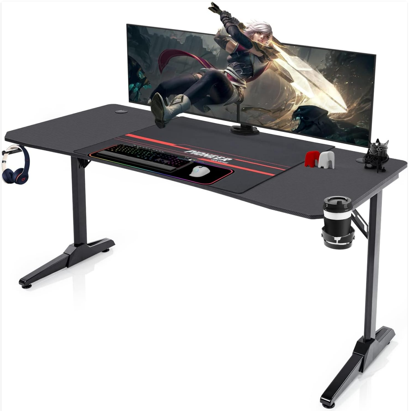
Image: Devoko Gaming Desk with included accessories like headphone hook and cup holder.