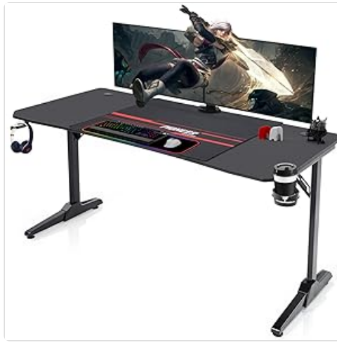
Image: The large mouse pad included with the desk, showing its dimensions (80cm x 60cm).