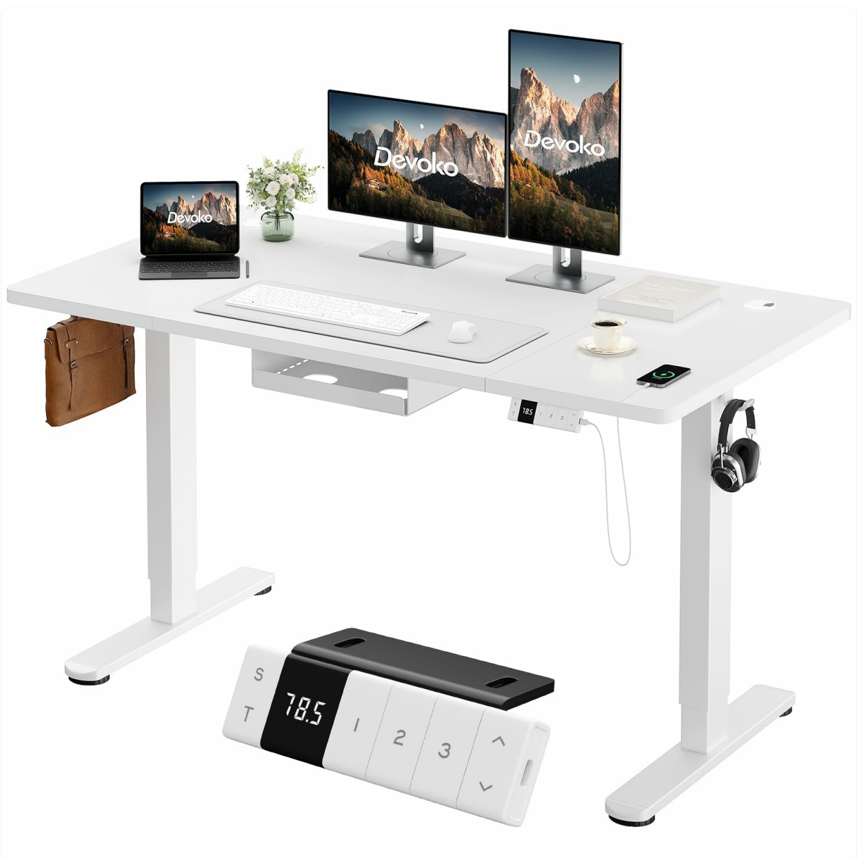
Image: Devoko Electric Sit-Stand Desk in white, 160x80cm.