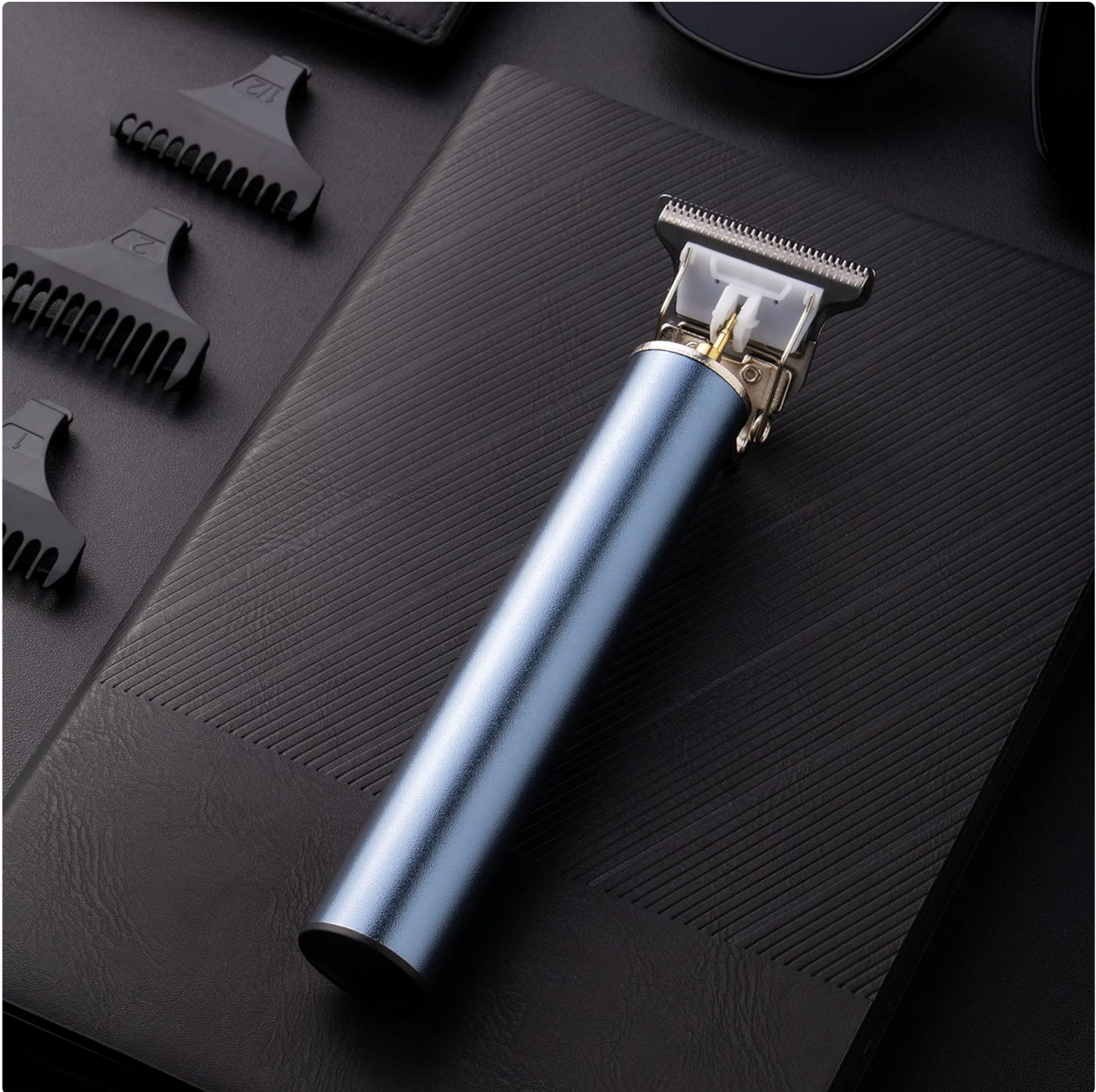
Image 2.1: All components included in the BarberBoss QR-2088 grooming kit.