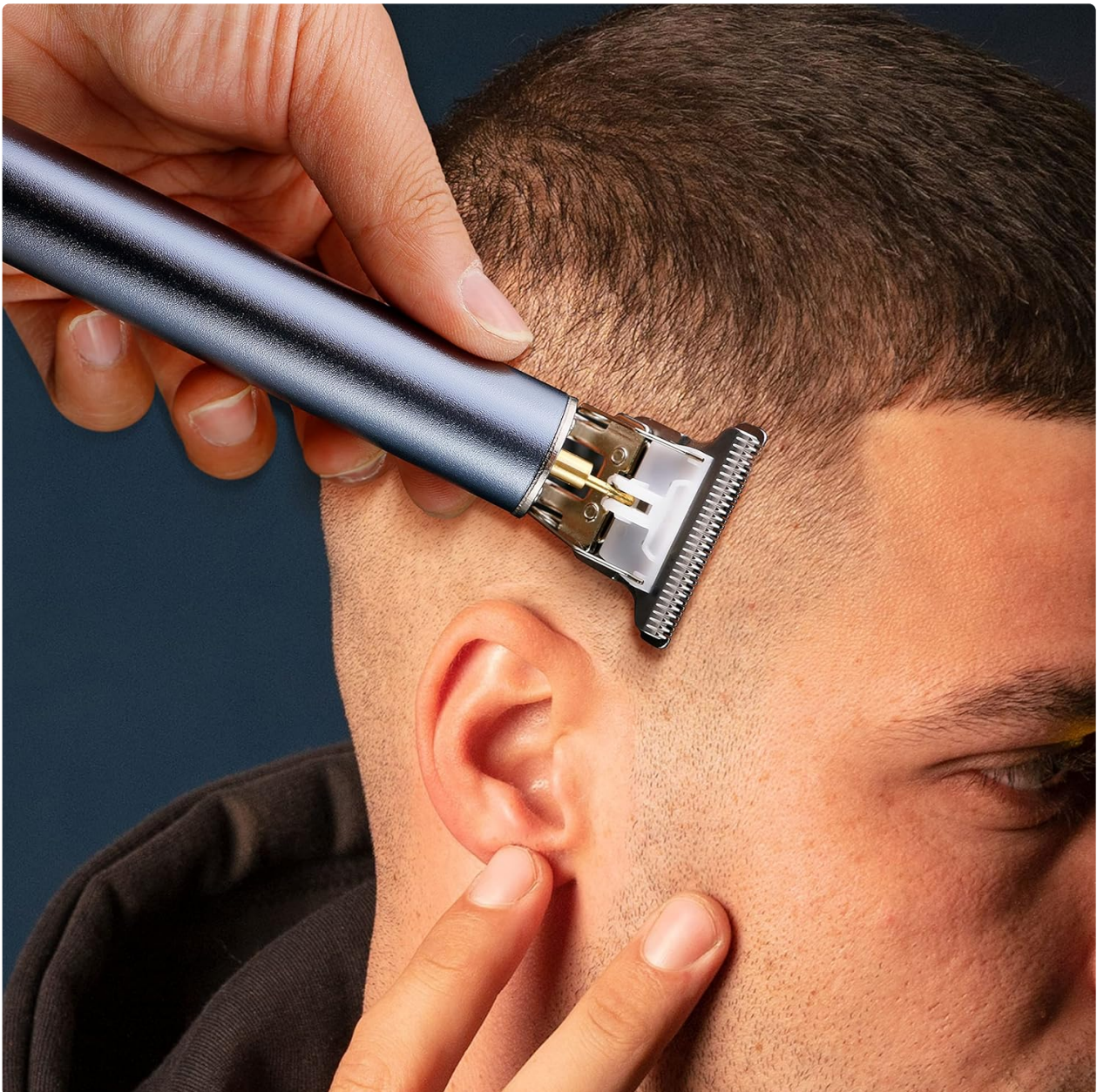
Image 5.1: The BarberBoss QR-2088 T-Blade Hair Trimmer being used for detailing.