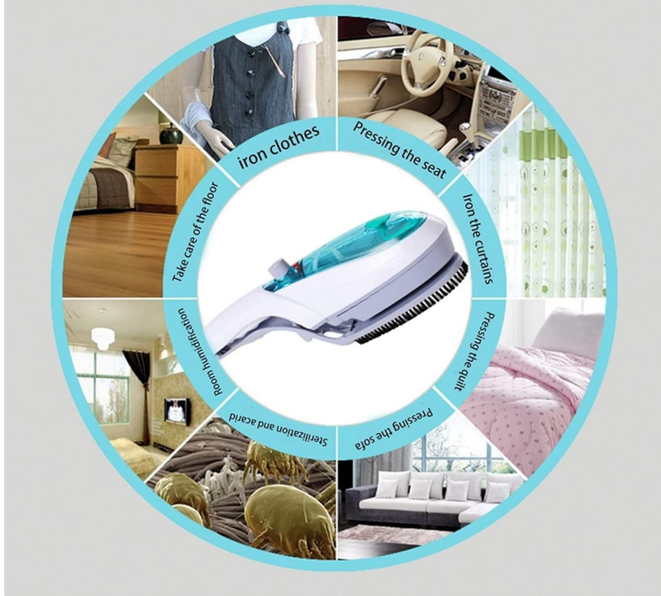
Image 4.2: This diagram illustrates the versatility of the steamer, showing its use for ironing clothes, pressing seats, ironing curtains, pressing quilts, sterilizing sofas, and room humidification.