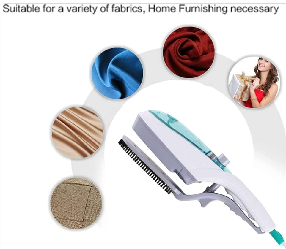
Image 4.1: The steamer is suitable for a variety of fabrics including silk, cotton, wool, polyester, and linen, making it a versatile tool for home furnishing and clothing care.

Learn how to effectively use your oiakus Handheld Garment Steamer for various applications.