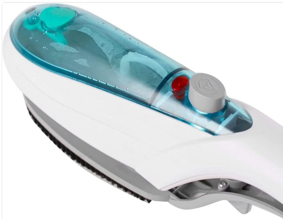
Image 2.2: Close-up view of the steamer's transparent water tank, steam button, and power indicator light, highlighting the user interface.