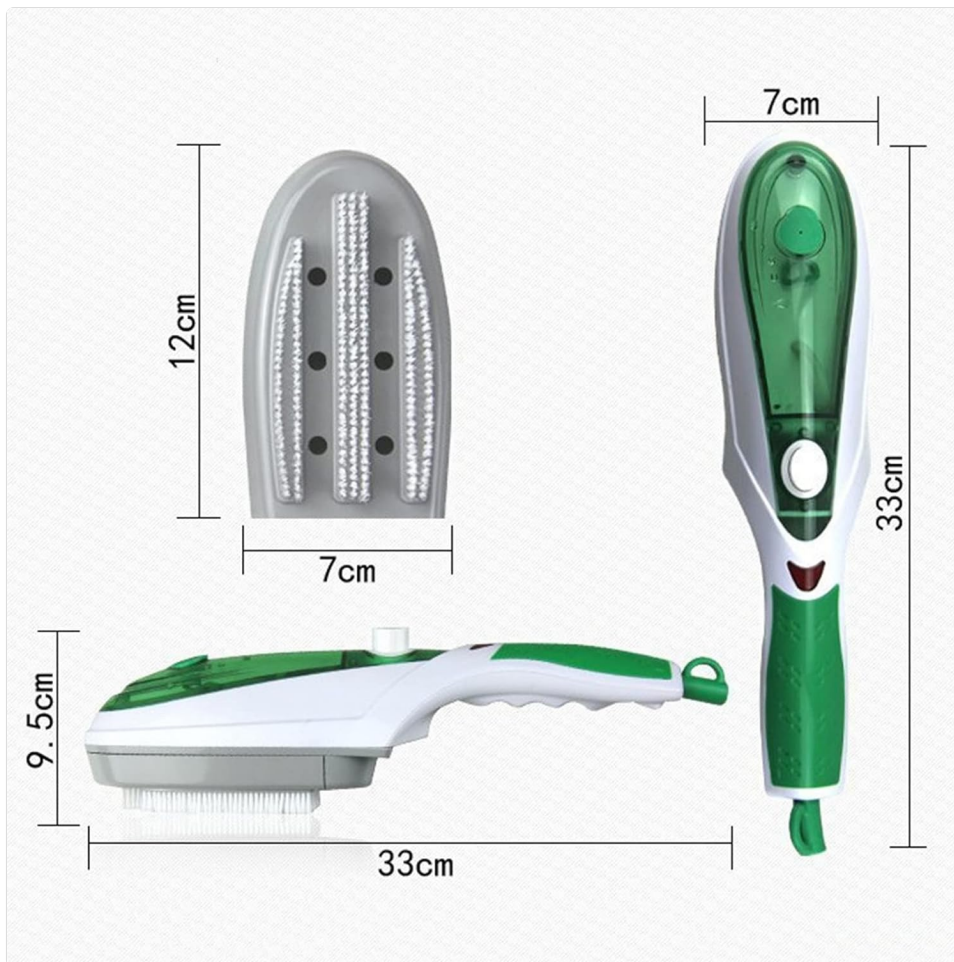
Image 7.1: Diagram illustrating the physical dimensions of the oiakus Handheld Garment Steamer and its brush attachment, showing measurements in centimeters.