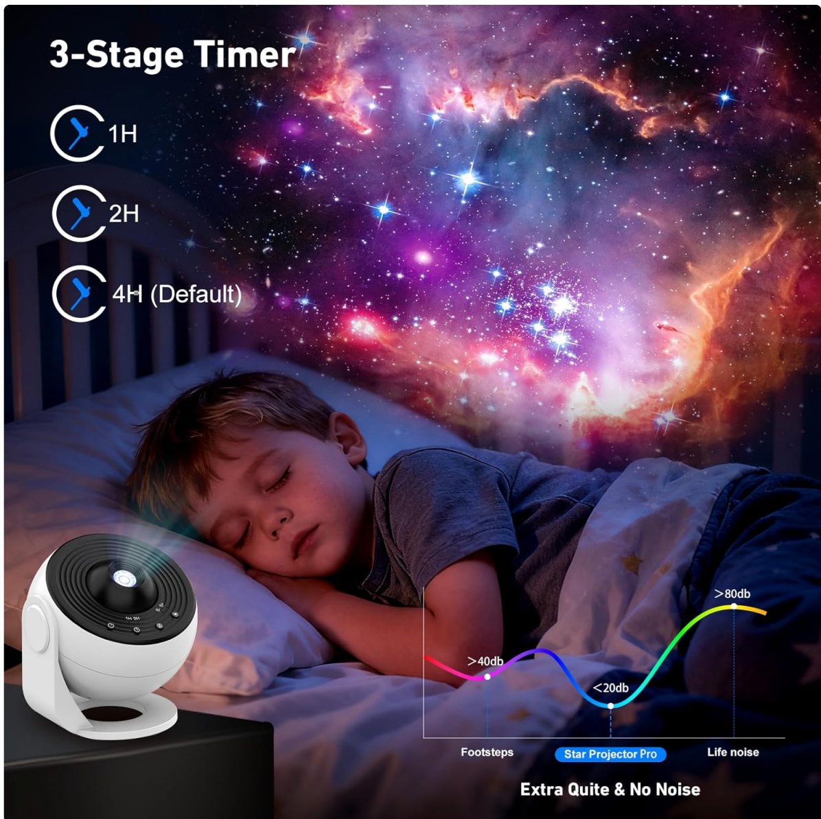
Image: A child sleeping peacefully with the projector displaying a nebula on the ceiling, demonstrating the 3-stage timer and the projector's quiet operation (below 20db).