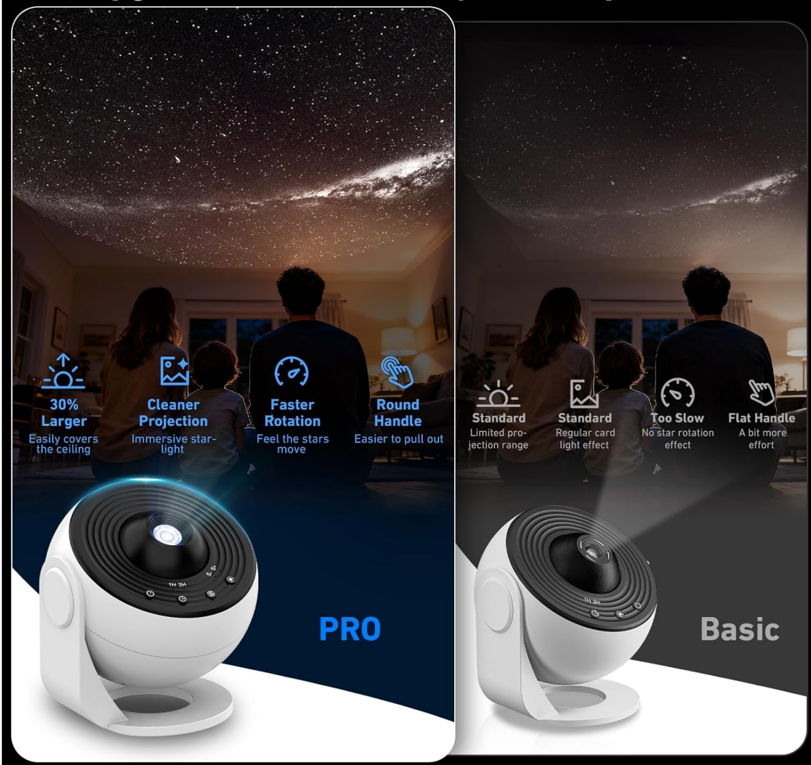
Image: This image highlights the projector's features, including 3-stage timer options (1H, 2H, 4H) and dynamic rotating star lights with 3-stage flow speed (Still, 12min/Turn, 16min/Turn).