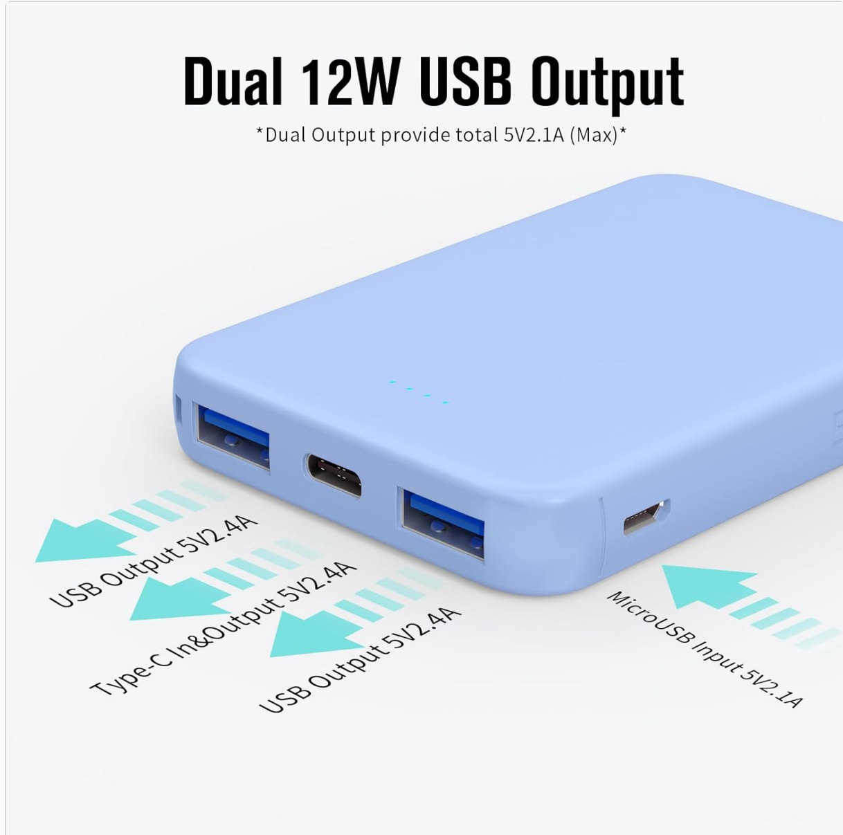
Image 3.1: Detailed view of the VANYUST S22's multiple charging ports.

*Dual Output provide total 5V2.1A (Max)*