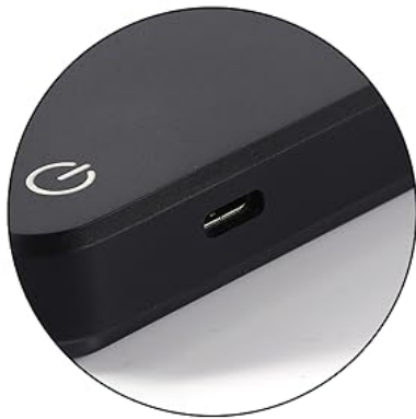
Image: Minimalist design with invisible LED screen and touch-sensitive buttons.