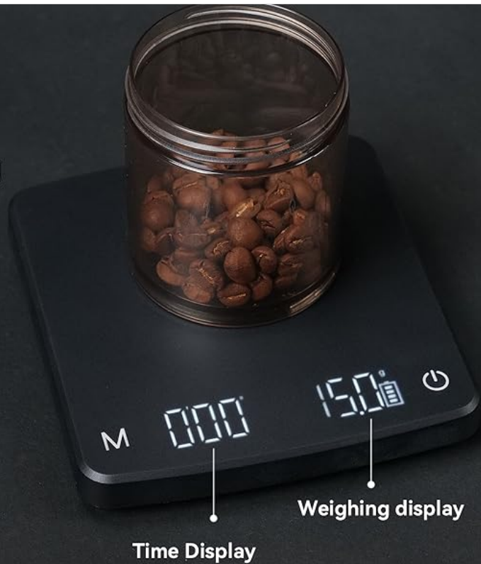
Image: Visual representation of the two auxiliary automatic modes.