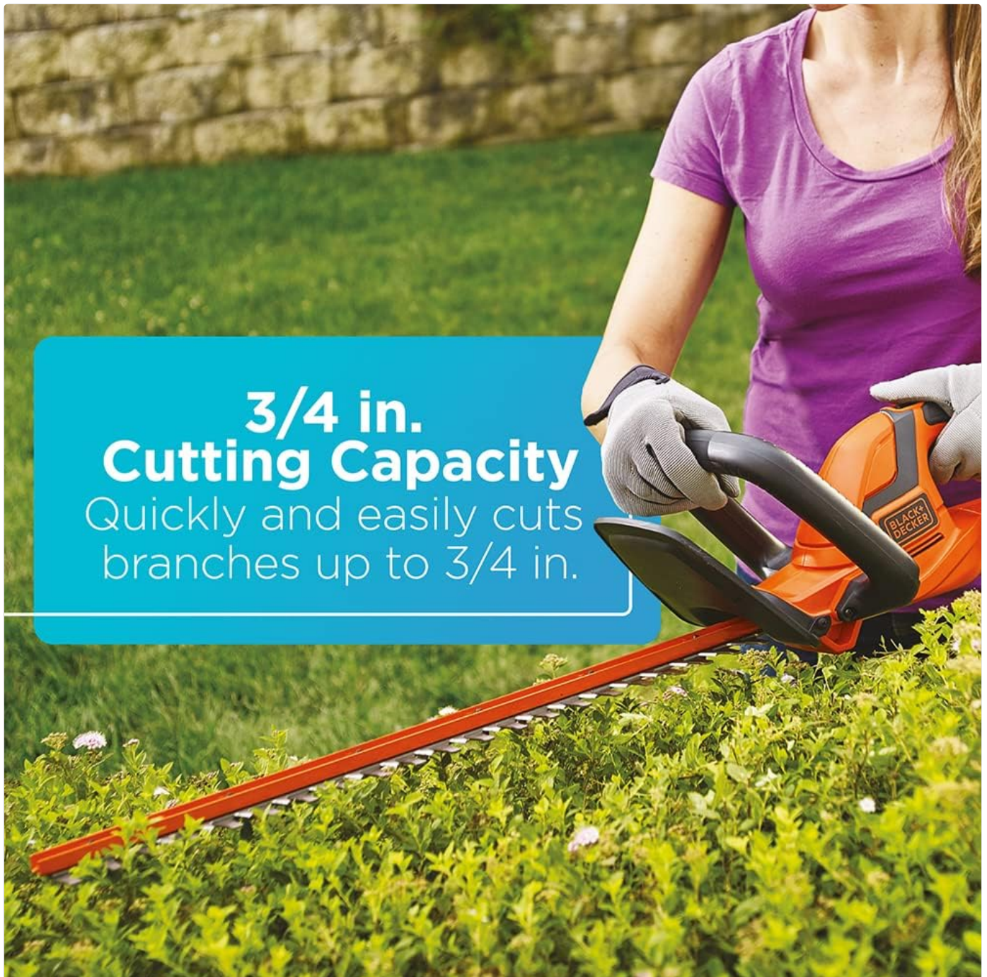
Image: Close-up of the hedge trimmer blades cutting through a branch, highlighting its 3/4-inch cutting capacity.