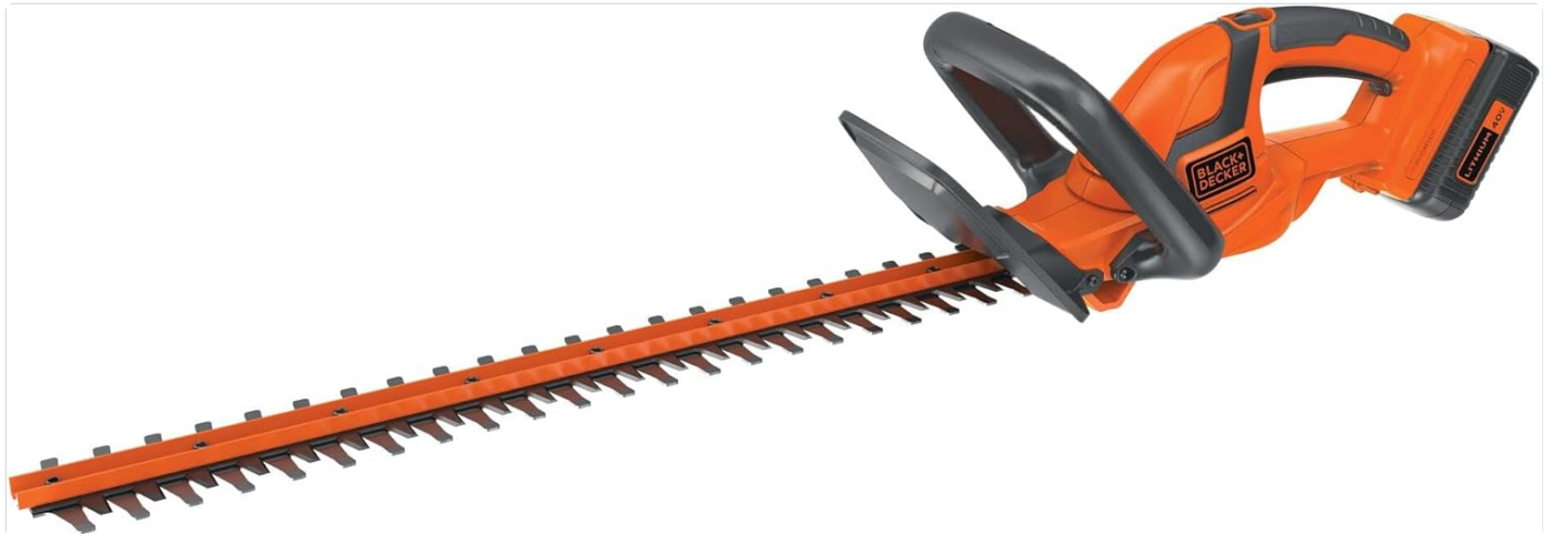
Image: The BLACK+DECKER 40V MAX Hedge Trimmer, showcasing its long dual-action blade and ergonomic handle with battery attached.

This manual provides essential information for the safe and effective operation, maintenance, and troubleshooting of your BLACK+DECKER 40V MAX Hedge Trimmer. Please read this manual thoroughly before using the product and retain it for future reference.