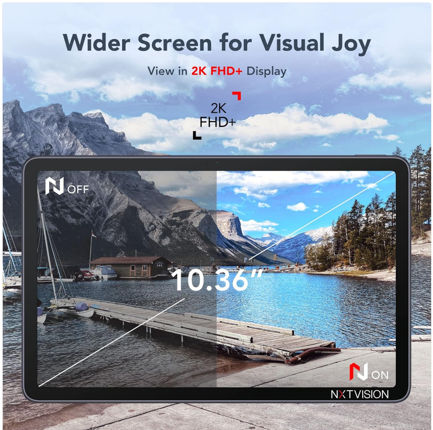
Image 4.1: The tablet's 10.36-inch 2K FHD+ display, showcasing the NXTVISION technology for eye comfort and vivid visuals.

The TCL Tab 10 features a 10.36-inch FHD+ display with 2K resolution (2000 x 1200 pixels). Navigation is primarily touch-based. Swipe, tap, and pinch to interact with the interface.